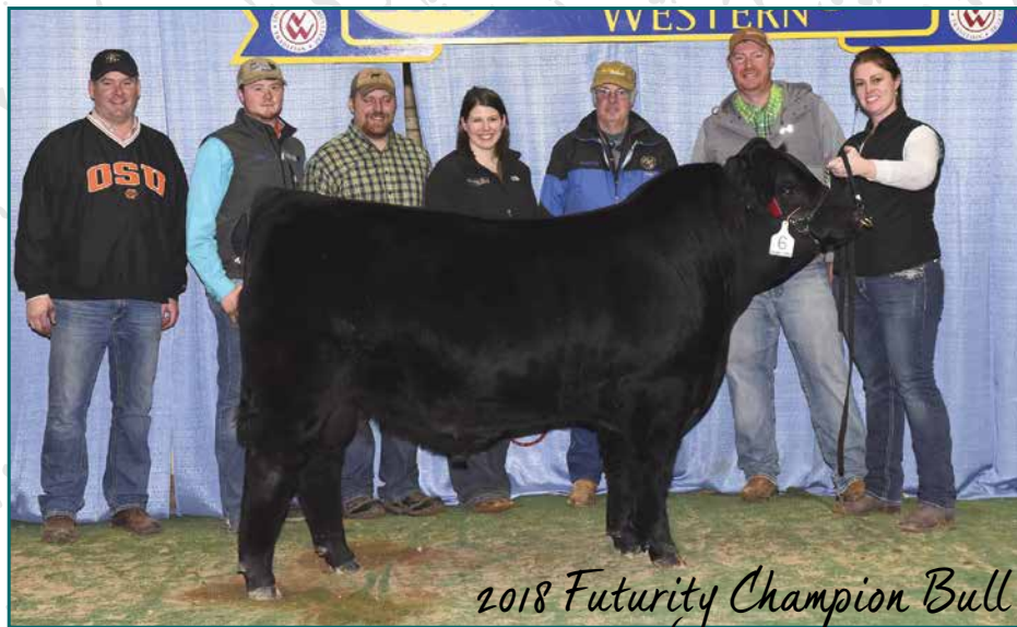
2018 Futurity Champion Bull