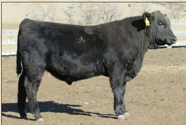
FGC E80 • Sells as Lot 56.

Performance bull sired by PHG Candy Man. E26 weaned at 802 with a weaning ratio of 107. He ranks in the top 15% for weaning and top 30% for yearling. Outstanding young growth bull.