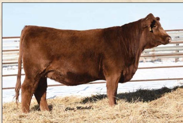
DDGR REBA 185D • Sells as Lot 13.