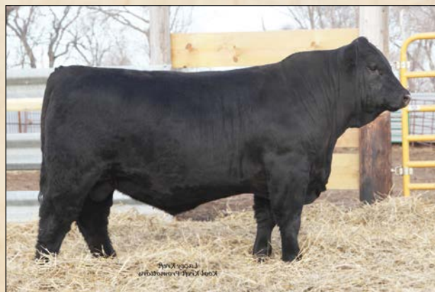
ZIMM ELI E518 • Sells as Lot 37.

Genomic enhanced EPDs. Heifer bull with exceptional growth and maternal values. Deep bodied and packed with muscle. Out of a first calf heifer that did an outstanding job. Weaned at 781 lbs! 12/9/17 Actual weight: 1070 lbs.