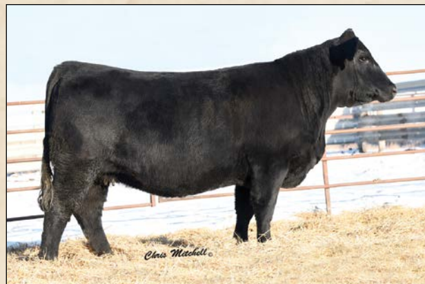
DCH HILLE D469 • Sells as Lot 9.

CHIMNEY BUTTE RANCH We really like Chisum sired cattle. This one is exceptionally good. Read the numbers, look at the performance, study the maternal pedigree and imagine a clean made, deep bodied, extra-long mama prospect. Your dreams of owning an exceptional female can come true with this lady!! Her maternal brother, DCH C169, is used both in our A-I program, and as a natural sire in the pasture. This package of proven maternal genetics is hard to part with. We opened the gate for Chris, and he selected these females from a group of 100 bred heifers. Ultrasound indicates an AI sired heifer calf due 2/26/2018. Service sire is DCH C134, co-owned with Thorstenson Gelbvieh.