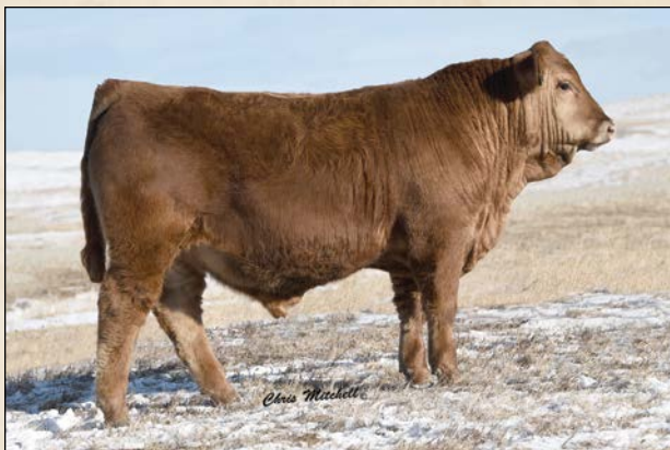
CD0C EARL 304E • Sells as Lot 54.