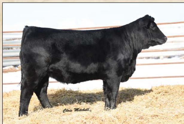
BGRG MERCEDES • Sells as Lot 26.

Sired by Spiderman, a bull purchased from the Gustin Diamond program. E22 is an outstanding young heifer that is loaded with volume, thickness and eye appeal. A very strong cow prospect that was chosen from the top of our open heifers. Sells open.