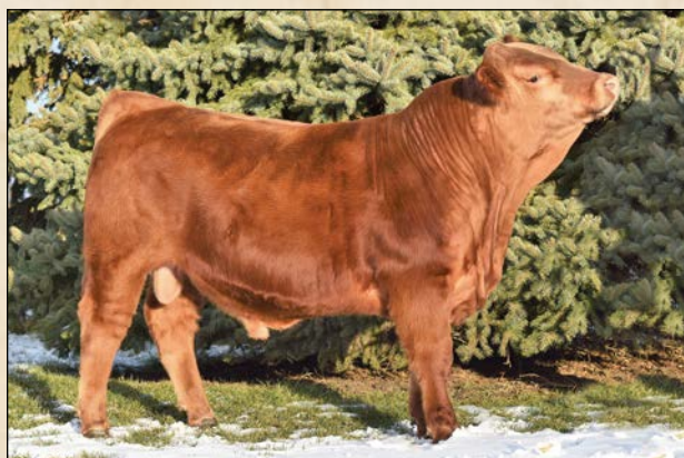
FPCC ECLIPSE • Sells as Lot 40.

Powerhouse bull that is as long and deep bodied as you can make them. He covers all the bases from performance, maternal, carcass quality, great feet, and eye appeal. You won't miss him when looking thru the pens. Weaned at 904 lbs! 12/9/17 Actual Weight: 1376 lbs.