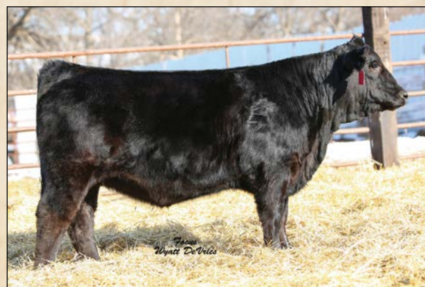
PHG ELVIRA E18 • Sells as Lot 20.

Elvira E18 is a heifer that received plenty of attention at our open house this summer. The very first daughter of PHG Paycheck to be offered at auction, and she's a good one! A half sister sold to McCarty Cattle Co in Colorado as the high seller in our 2014 sale, and has turned into one of their leading young females. Paycheck is a bull we retained to use in our herd as the replacement for his sire. His calves were the leading group at weaning and are "the right kind". Halter Broke, Homozygous Black and Polled!