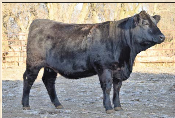
FPCC DANCING QUEEN • Sells as Lot 14.

The KKC Nobility sire has left us with a very productive set of females. With her look, excellent performance, and very strong EPD profile, she is a hard one to part with. She is due March 8 with a bull calf by the FMH 510C purebred sire.