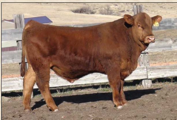
FGC E26 • Sells as Lot 55.

Talk about a hunk of meat! Another typical DVE McGraw son. This meat wagon bull is soggy middled and wide topped. He steps down with extra circumference of bone and stretches out on the move. If you're looking to add pounds and docility to your calves, make sure to find Earl on sale day.