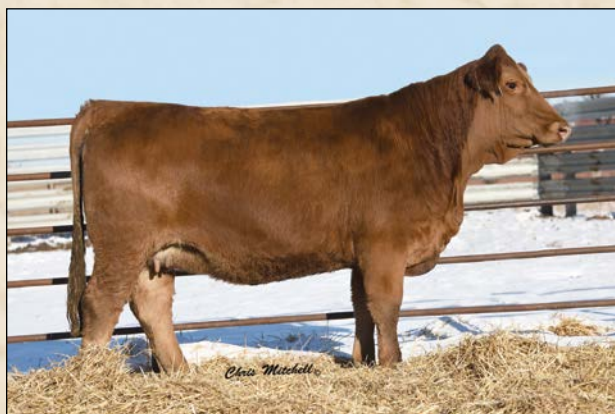
DCH HILLE D437 • Sells as Lot 6.