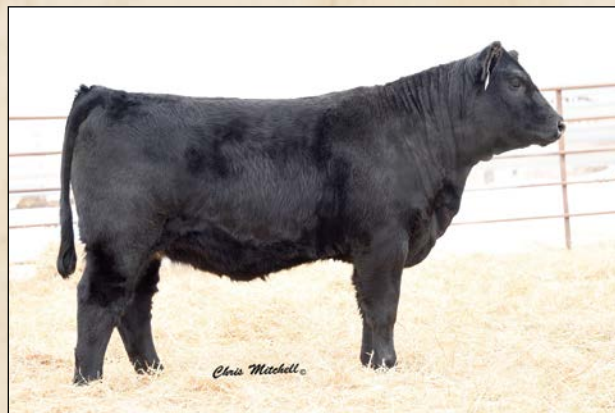
SGAR EVON • Sells as Lot 27.

711E is a thick, deep bodied heifer with excellent muscling. She has a wide top with plenty of length. She displays her performance well while still carrying a feminine, clean fronted stance. 711E is backed by a strong cow family and the genetics of a proven sire making her qualified to be a superior female in anyone's herd. Sells open.