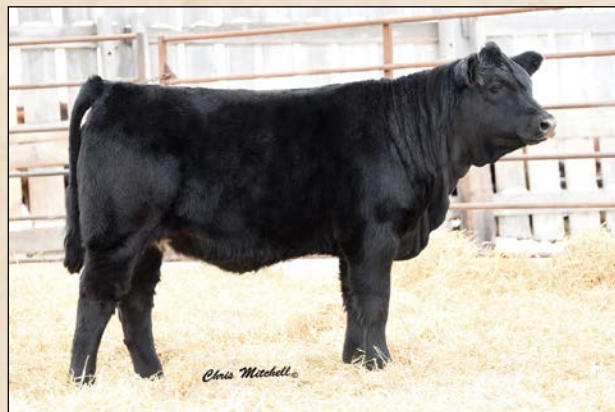
SGAR 701E • Sells as Lot 25.

701E is a moderate framed, clean fronted, stylish heifer. Her pedigree reads well boasting above average milk and calving ease. This calf's mother was the high selling bred female at Gustin's Diamond D 2015 production sale. This is the 3rd heifer calf her mother has produced, all of which are displaying a superior stance within our purebred herd. Sells open.