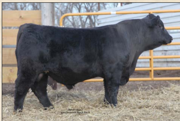
ZIMM EARL E98 • Sells as Lot 38.