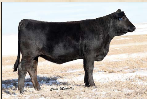
BDOC DEMI 190D • Sells as Lot 15.

A complete outcross pedigree female with strong performance and maternal strengths that ranks in the top 30% for both weaning and yearling. She weaned with a 112 ratio and had a 114 yearling ratio. Due 1-13-18 to LAZY TV Sam U451.