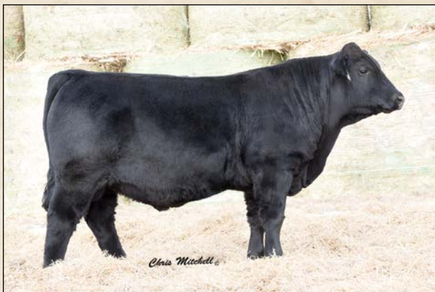
WOHL BLAZON IMPACT E21 • Sells as Lot 46.