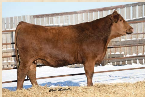
DCH HILLE D416 • Sells as Lot 4.

Deep dark cherry red, diluter free from both black parents. A real eye catcher with numbers to match. Her grand dam, R152, has achieved Dam of Distinction status, a foundation for longevity and performance. All heifers in this offering have a minimum of 3 generations of maternal genetics that have been raised and used in our program. She carries a heifer calf sired by Ellingson Identity. Identity calves in our program have been standouts. Ultra sound confirms AI due date of 3/18/2018.