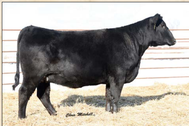
DDGR PASSION 13D • Sells as Lot 7.