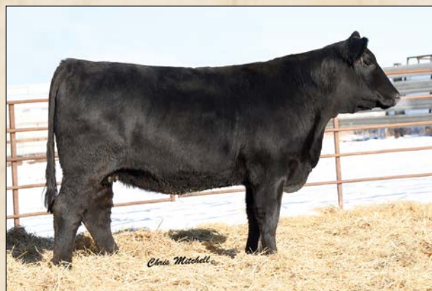
DCH HILLE D409 • Sells as Lot 3.

A powerful female loaded with performance while maintaining above average calving ease. A rock solid maternal pedigree that includes, Majesty, X102, and Tye. Should make a terrific mama cow. Great numbers, great performance and a phenotype to match. All heifers in this offering are AI sired, carrying AI calves. Ultra sound confirms an AI bull calf, sired by Ellingson Identity, due 2/27/2018.