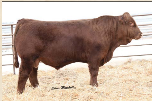
CMK E5 • Sells as Lot 34.

Excellent young herd sire prospect sired by Pistol Pete out of a Post Rock Granite dam. He posted a weaning ratio of 106. He ranks above breed average for all calving ease, performance and carcass EPDs.