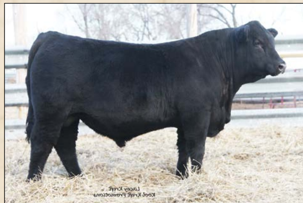
ZIMM ETHAN E409 • Sells as Lot 52.

Genomic enhanced EPDs. Our youngest bull in the offering, but you sure can't tell. First calf crop out of SGRI C263 who was the highest selling bull calf that we purchased out of the Schroeder Ranch dispersion sale. Weaned at 896 lbs! 12/9/17 Actual Weight: 1120 lbs.