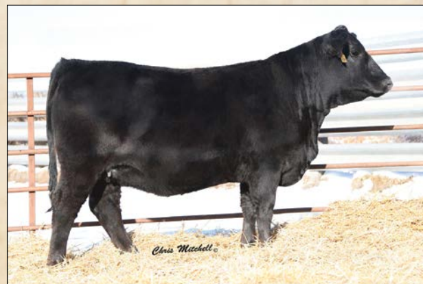
DDGR SHEEZA DREAM 181D • Sells as Lot 12.