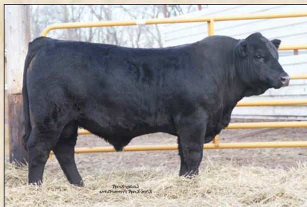
ZIMM EMMETT E526 • Sells as Lot 35.

Genomic enhanced EPDs. Exceptional length of body with good muscle. Probably the best WOHL EVERETT Y24 calf we have ever raised. Out of an Exar Upshot first calf heifer that did a great job. The maternal side of our bulls is the foundation of our business. Weaned at 842 lbs! 12/9/17 Actual Weight: 1230 lbs.