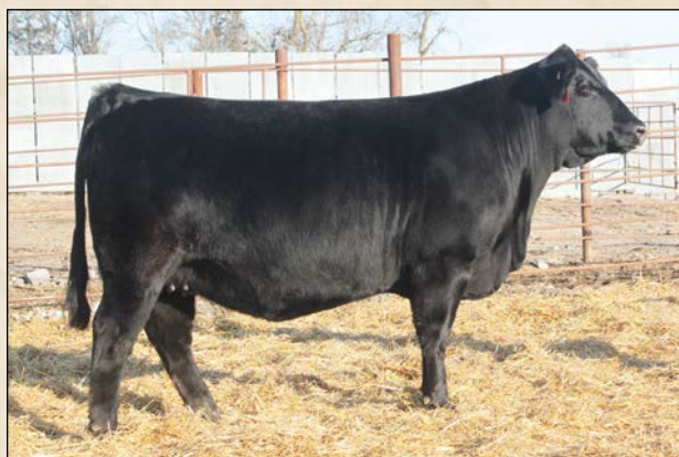
LRSF LRL NELLIE D40 • Sells as Lot 5.

CHIMNEY BUTTE RANCH The very first SAV Resource 1441 daughter we have offered for sale. She is just flat out good. Her mama is one of the good old cows. Her Grand dam, L156 achieved dam of distinction status, and was a donor cow in our ET program. Solid dependable maternal genetics. All heifers in this offering have had DNA samples submitted. When results are available, we will publish on our website, and genomic enhanced EPD's will be available on sale day. Ultra sound indicates an AI heifer due 3/20/2018. Service sire is DCH C134, purchased from us by Thorntenson Gelbvieh. We have the first C134 calves in our feedlot and they look great.