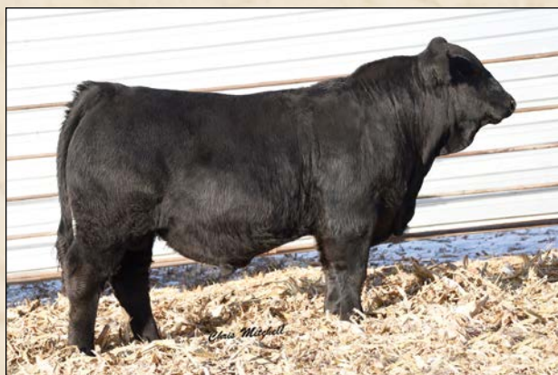
BTHU DIESEL • Sells as Lot 30.

Wrangler weaned with ADJ 205 weight of 918 and a weaning ratio of 115. His dam is a first calf cow that is a complete outcross pedigree. He ranks in the top 10% for weaning, top 20% for CED and top 30% for yearling. His maternal grandam is a Dam of Merit. Here is a very strong young bull that is loaded with rib and thickness.