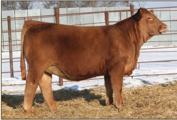
LRSF LRL NELLIE E154 • Sells as Lot 21.