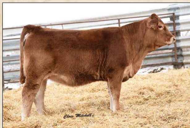
CMK SURPRISE • Sells as Lot 18.

A full sister to CMK D4, also selling as lot 1. This is a very strong mating from one of our top production dams on the ranch. Please note the strength of these Durango daughters. We look forward to the future of these young Durango females. Sells open