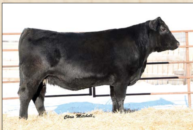
DCH HILLE D462 • Sells as Lot 8.