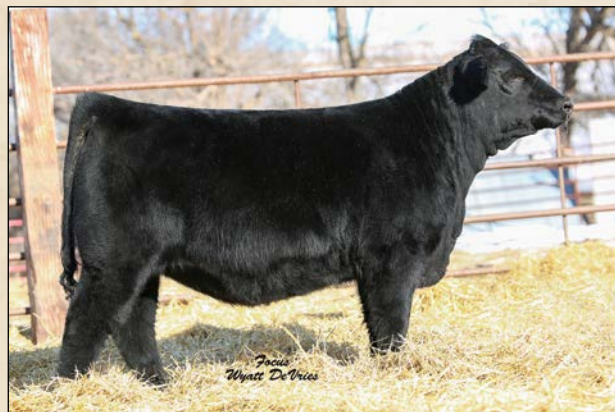
PHG IVANKA E01 • Sells as Lot 17.

PRAIRIE HILLS GELBVIEH PHG Ivanka E01 is probably the most exciting female we've ever consigned to the Golden Rule sale. She is one of the first daughters of the 2017 National Champion Balancer bull - MCCA Capitol Hill 516C to sell, and she's the real deal. Her dam is a moderate framed Traction daughter who came off pasture in show shape, even in a drought! This girl is halter broke for a 6 year old, and has already visited the backdrop, winning Reserve Champion Balancer Female honors at Agribition in November. There's simply not enough room to write about all of the good this heifer puts together. Homozygous Black and Polled.