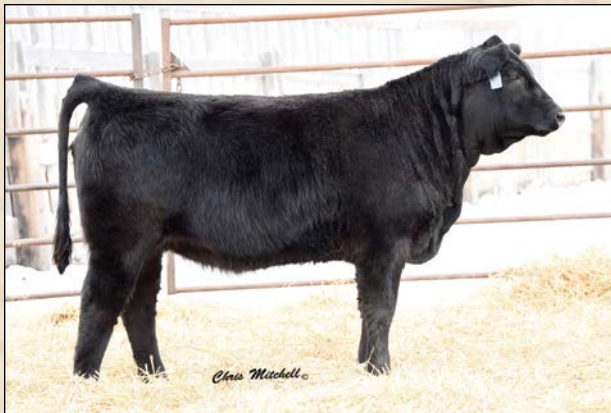
SGAR ESTHER • Sells as Lot 22.

SCHOCK RANCH Genomic enhanced EPDs. If you are looking for a more moderate female that is capable of delivering performance to the ground, this is your girl. She has an excellent pedigree with powerful numbers straight across the board. 703E is a young calf, out of a first calf heifer that is showing early signs of becoming a top performing cow anywhere. Sells open.