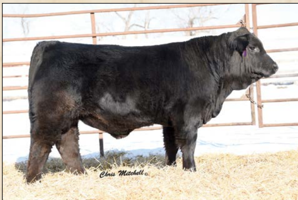
KWDT EBONY KNIGHT • Sells as Lot 48.

Heifer bull with style and substance. Females with productive longevity. Homo-Black. Genomic, HP and genetic test results pending. Retaining 1/3 Semen interest.