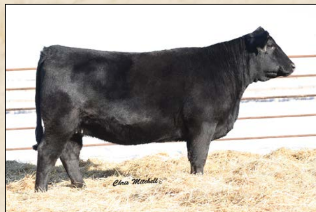
DDGR SASSY FRASS 41D • Sells as Lot 10.

The SAV Resource females need no introduction, as they are consistently deep bodied, eye appealing, and have the brood cow look. This sweet female is bred to our CKS C11 purebred sire and is due with a bull calf on March 21.