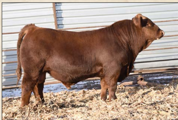
THUL WRANGLER • Sells as Lot 29.