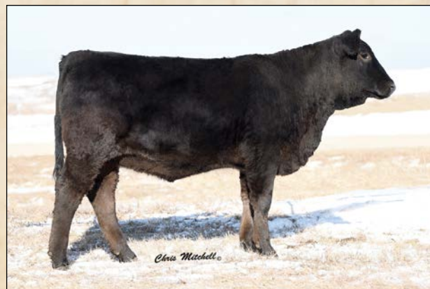
DCHD GOLDEN BUCKLE GELV 101E • Sells as Lot 28.

We are offering an excellent front end heifer out of Dam of Merit Roy daughter. 101E has top notch growth being in the top 4% for weaning and top 5% for yearling weight. Don't pass up this heifer if you are looking to add a productive female to your herd.