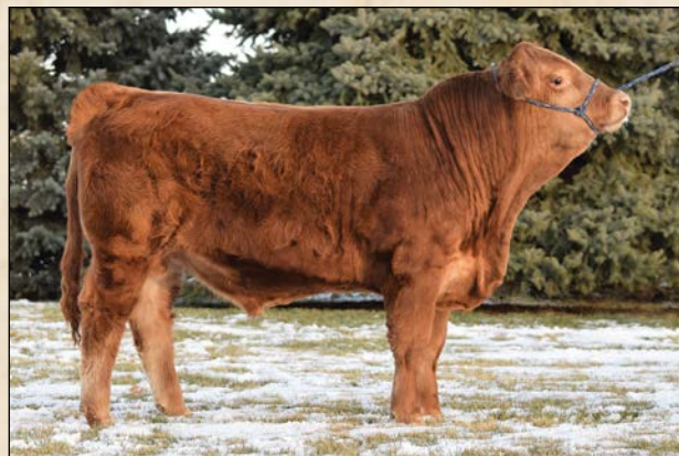
FPCC EL TIGRE • Sells as Lot 36.

Low birth bull that weighed 78 at birth with an 816 weaning weight. Excellent performance bull out of a first calf cow.