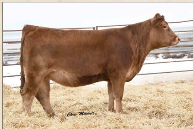
CMK D4 • Sells as Lot 1.

We sold a group of Durango son's in the Golden Rule Sale in 2017 that were very impressive and caught the attention of many breeders. D4, is a Durango daughter out of the same calf crop that is right from the top of our bred heifers. She is a high volume heifer that is very broody. Weaned with a 107 weaning ratio. AI'd on 5-02-17 to Mr At Ease 2020, then Pasture Exposed 5-15-17 to 8-15-17 to CMK C6, an Independence son.