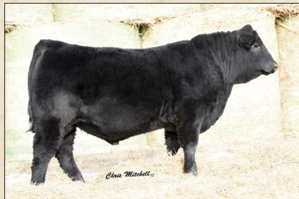
WOHL BIG TOP E71 • Sells as Lot 44.

Thickness galore and built to make you money. Every bull out of these Zimm cow families has been selected for the NDGA sale. Genomic test results pending. Retaining 1/3 Semen interest