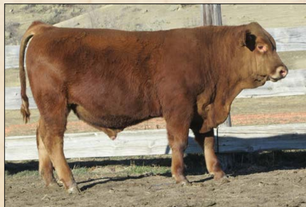
FGC E8 • Sells as Lot 53.

Genomic enhanced EPDs. Strong performance bull coming from Feist Gelbvieh that ranks in the top 25% for weaning and the top 35% for yearling. He also weaned with a ratio of 102.