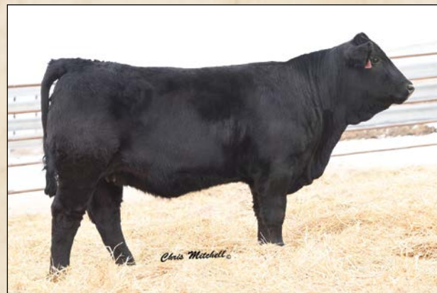
CMK E8 • Sells as Lot 19.

A daughter of Davidson Jackpot that ranks in the top 15% for weaning and the top 25% for yearling. Outstanding combination of performance, maternal and eye appeal. Sells open