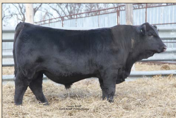
ZIMM EDDIE E170 • Sells as Lot 39.

Another bull out of our powerhouse herdsire SGRI C263, don't miss an opportunity to purchase one of his sons. Out of a great SITZ NEW DESIGN 458N Daughter. Weaned at 766 lbs! 12/9/17 Actual Weight: 1170 lbs.