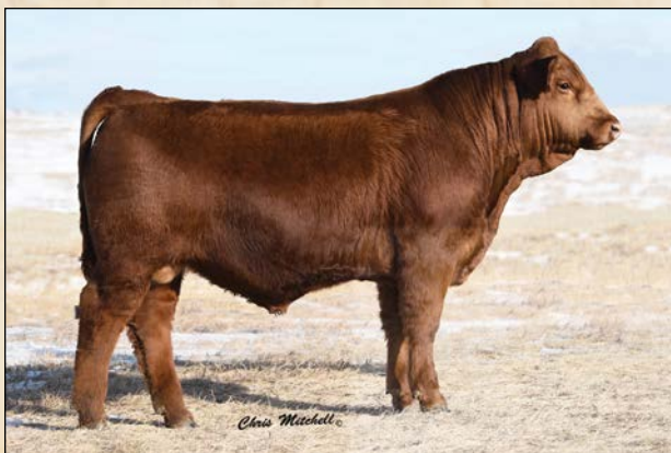
DCHD GBG EARL 179E • Sells as Lot 49.

A very strong young bull with excellent thickness and volume in a very moderate package. He ranks in the top 25% for yearling growth.