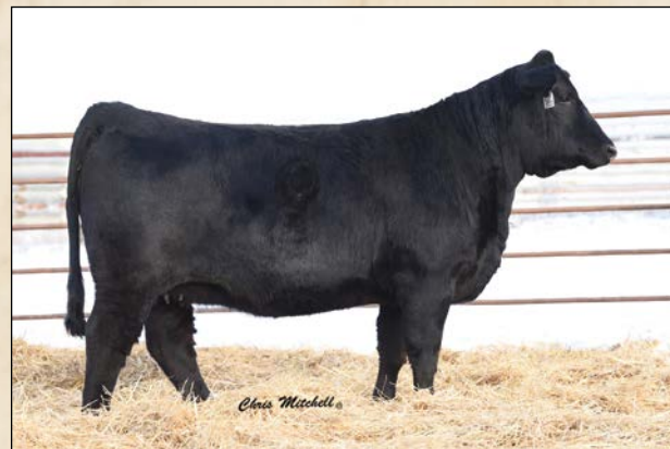
DDGR OBSESSION 285D • Sells as Lot 11.

This heifer is an extremely flashy, moderate framed female with plenty of eye appeal. She is going to make a great cow with her look and EPD profile. Her mother has been a top producing cow in our herd and we love our Ten Plus daughters. She's due March 8th with a purebred heifer calf sired by Flying H Grand Slam 128D ET, one of the top 3 bulls in the 2017 Bull Futurity.