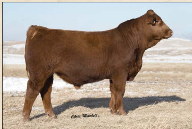
DCHD GBG EXCALIBUR 070E • Sells as Lot 50.

GOLDEN BUCKLE GELBVIEH Excalibur is one of those bulls you can't help but notice. His dark cherry red color catches your eye right away. As you study him more, you will admire his softness, depth of rib and total mass. His dam is a dam of merit and has been a powerful, influential female in our herd. She has a son working in our herd currently and has proven himself his first year. Excalibur will be one of the only offspring to sell out of the high selling DDGR Innovation bull as we lost him to an injury shortly into breeding season. Excalibur was one of our Agribition show string and was a finalist for the Canadian People's Choice Futurity Bull.