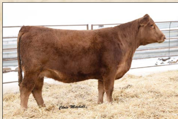
CMK D12 • Sells as Lot 2.

A true calving ease female that ranks in the top half of the breed in marbling. Dam is an Independence daughter that is among the top cows in our program. AI'd on 5-02-17 to Pistol Pete, then Pasture Exposed 5-15-17 to 8-15-17 to CMK C6, an Independence son.