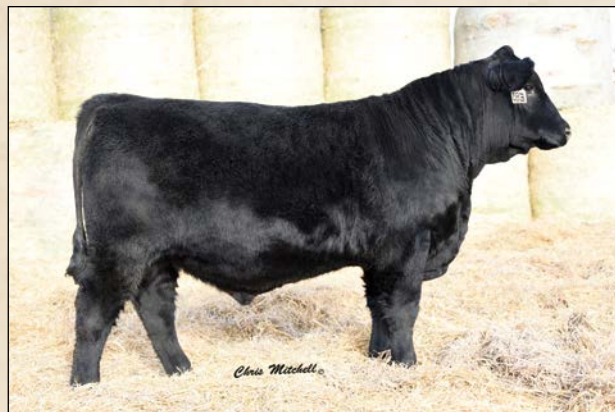
WOHL BRULE'S EASE E83 • Sells as Lot 42.

Calving ease, deep sided and growth oriented. Dam is 12 years old with daughter's bull as Lot 47 (E13) and great-grand-daughter's bull as Lot 51 (E37) in the sale. Homo Black. HP results pending.