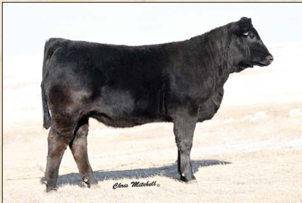
DCHD GOLDEN BUCKLE GELV 357E • Sells as Lot 23.

GOLDEN BUCKLE GELBVIEH Take a good look at this heifer. You don't want to miss a chance at a female out of the Golden Buckle replacement pen. Out of a dam of merit cow who sold a maternal sister to 357E through a past Golden Rule Sale. This will be one of the only offspring to sell out of the high selling DDGR Innovation bull as we lost him to an injury shortly into breeding season. 357E is a broody type heifer with a large amount of width and dimension who will make a great addition to anyone's herd.