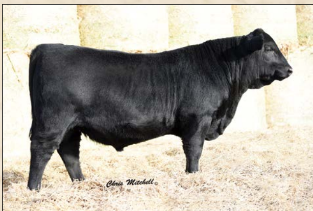
WOHL BRULE'S GENT E13 • Sells as Lot 47.

Smooth shoulders, docile and built similar to his sire. The Impact sire and his daughters continue to put seedstock quality bulls in this sale.