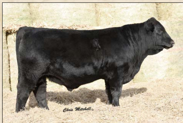
WOHL TENPOINT E37 • Sells as Lot 51.

PB with moderate birth weight and explosive growth. He weighed a solid 1020 lbs off the cow. Sire was our top selling bull in a previous sale. Dam's 3rd State sale bull and great grandam has Lot 42 (E83). Retaining 1/3 Semen interest.