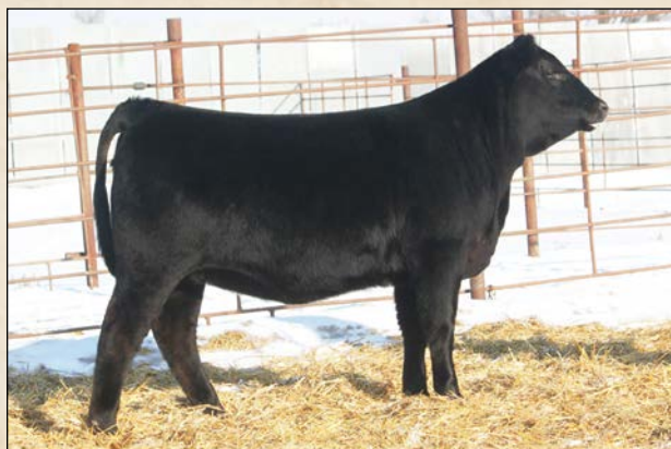
LRSF LRL NELLIE E59 • Sells as Lot Donation.