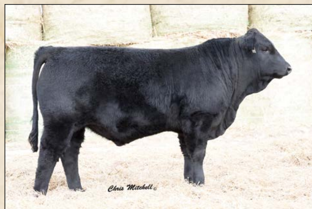
WOHL TOTALITY E1 • Sells as Lot 43.

Moderate frame with thickness. He comes from a growth oriented cow and calving ease sire with great carcass.