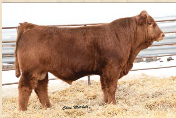
CMK E27 • Sells as Lot 41.

Low birthweight of 71 and a weaning weight of 758. Excellent low birth/performance combination bull with an outcross pedigree.