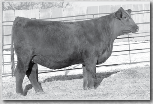
LRL FOREVER QUEEN D210 Sells as Lot 71.

Forever Queen D210 is a female that will instantly catch your eye in the pen. She is extended through her front one-third, huge middled, and is sound on her feet and legs. And whether she is coming at you or going away, you can really appreciate her width and dimension. She is due March 11, 2018 with a calf sired by DLW Highly Focused 503C.