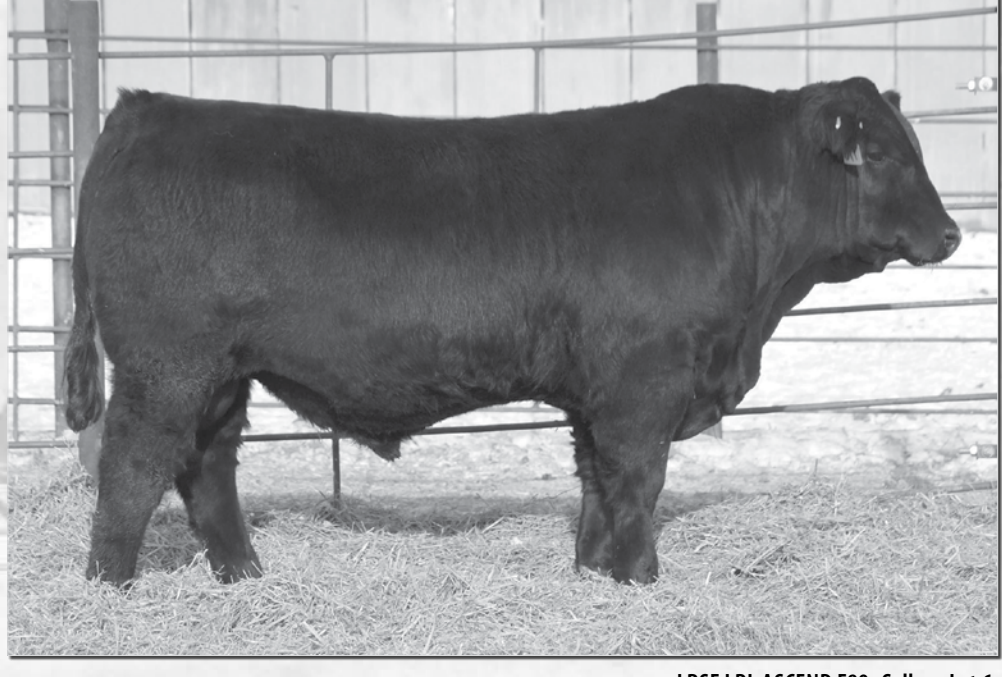
LRSF LRL ASCEND E89 Sells as Lot 6.

Ascend E89 has been an eye catcher since early on and has continued to get better every day. This heterozygous black and homozygous polled purebred Gelbvieh calf is special in so many ways. His phenotype is one to behold; smooth shouldered, deep ribbed, excellent muscle shape and he's as free moving and loose structured as any bull in the pen. His EPD's are just as impressive with top 20% BW, top 20% growth, top 10% maternal traits and top 15% FPI. And his terrific dam is a top-notch producer being honored as a Dam of Merit 3 years running. Also, he can really pack the pounds on with an ADG of 4.68 pounds. Ascend E89 is a no-holes calf and will be sale day favorite.