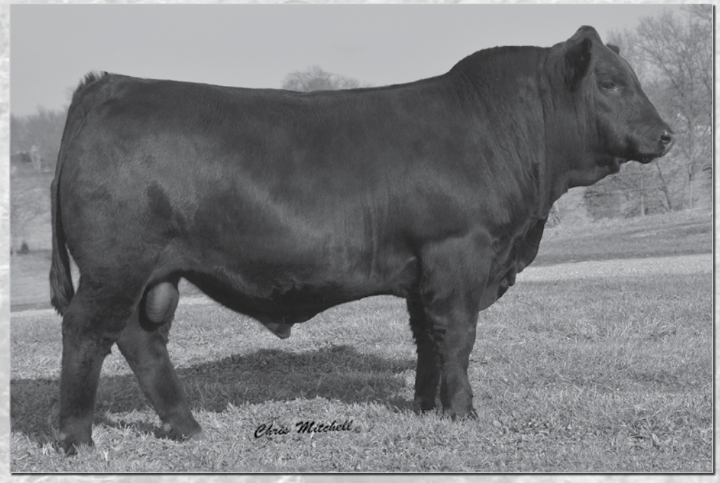
CCRO CAROLINA LEVERAGE 3214A Sire of Lots 1-4.

If you're looking to add some performance to your next calf crop, look no further than Throttle E95 ET; he's an absolute powerhouse. He has a little extra frame size than this ET siblings but doesn't give up any depth or dimension. And since he's purebred Gelbvieh, he's a bull that's really going to produce dividends when put on a group of high percentage Angus females. Can you imagine the amount of hybrid vigor those calves will have? You can put them up against any calves in your country and they'll be tough to beat.