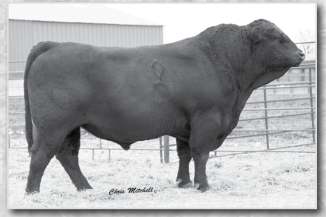
DDGR DDGR BLACKHAWK 10B Sire of Lots 25-32.