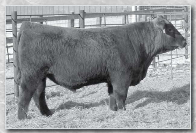
LRL WIZARD E152 Sells as Lot 53.

Spitz E75 is a super long bodied and deep ribbed son of the aptly name Bieber Deep End. And with all the depth and length of body he has, he has performed very well. He has an adjusted weaning weight of 768 pounds, good enough for a WW ratio of 107. His growth EPD's are also excellent with a WW EPD ranking in the top 9% and a YW EPD ranking in the top 12%. Spitz E75 also has a docile disposition and is easy to handle in the pen as well as the chutes.