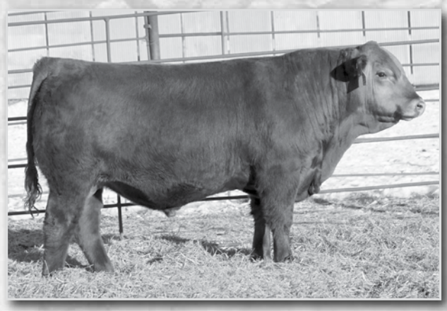
LRSF LRL IN THE MONEY E26 Sells as Lot 35