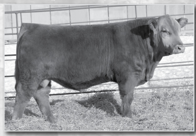
LRSF LRL PARAMOUNT E22 Sells as Lot 42.

JRI PRIME CUT 406S30 Sire of Lots 42, 43.