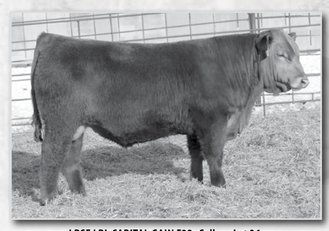
LRSF LRL CAPITAL GAIN E32 Sells as Lot 36.