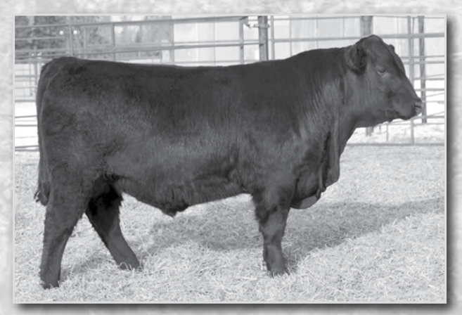
LRSF LRL HEAD START E79 Sells as Lot 20.