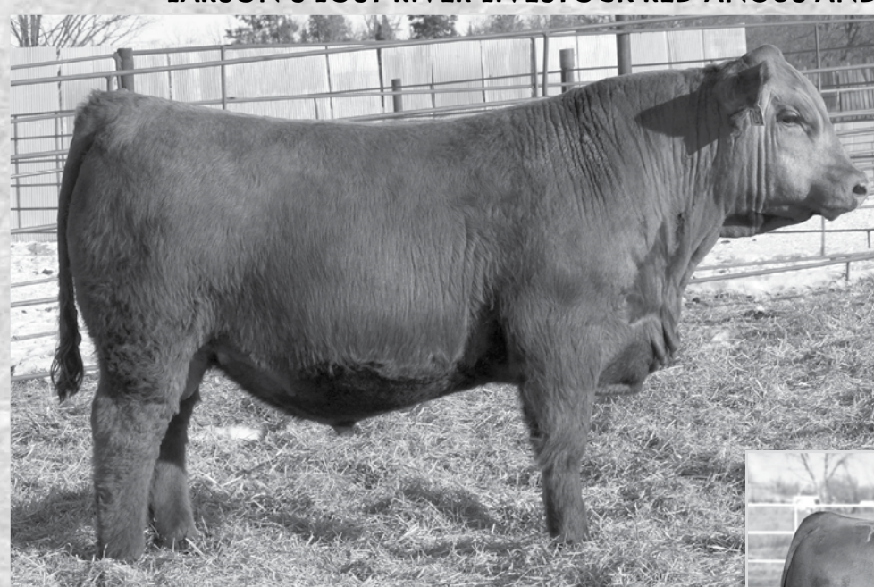
LRL HEDGE FUND E47 Sells as Lot 38.

H2R PROFITBUILDER B403 Sire of Lots 33-40.