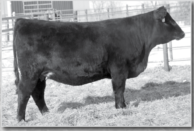
LRSF LRL IMPROVEMENT D27 Sells as Lot 59.

LAZY TV Watchman has been one of the Gelbvieh breed's most heavily used sires for the past few years and for good reason. Just take a look at this girl. Ma Belle D44 is very tight fronted, smooth shouldered, super wide topped and travels on a great set of feet and legs. Due March 1, 2018 with a calf sired by DLW Highly Focused 503C.