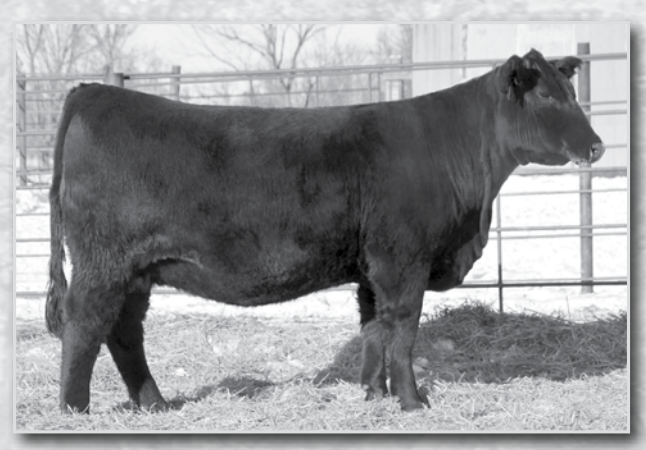
D56 COMMERCIAL BRED HEIFER Sells as Lot 78.