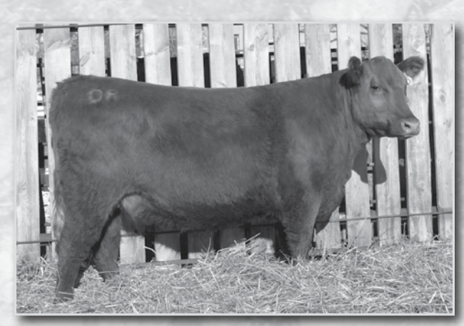
DAHLKE MS.TJ 6D Sells as Lot 83.