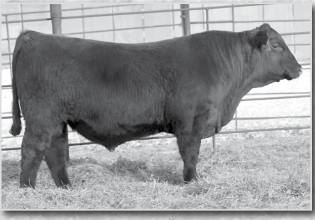
LRL SPITZ E75 Sells as Lot 51.