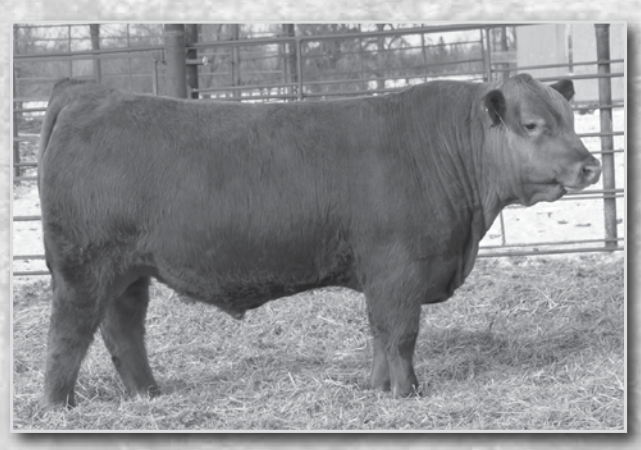
LRSF LRL MARKETPLACE E14 Sells as Lot 34.