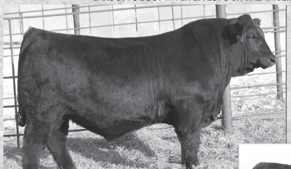
LRSF LRL UPPER HAND E125 ET Sells as Lot 17.