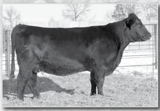
LRSF NELLIE B119 Dam of Lot 28.