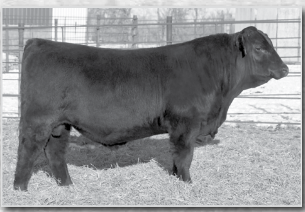
LRSF LRL WASHINGTON E133 Sells as Lot 25.