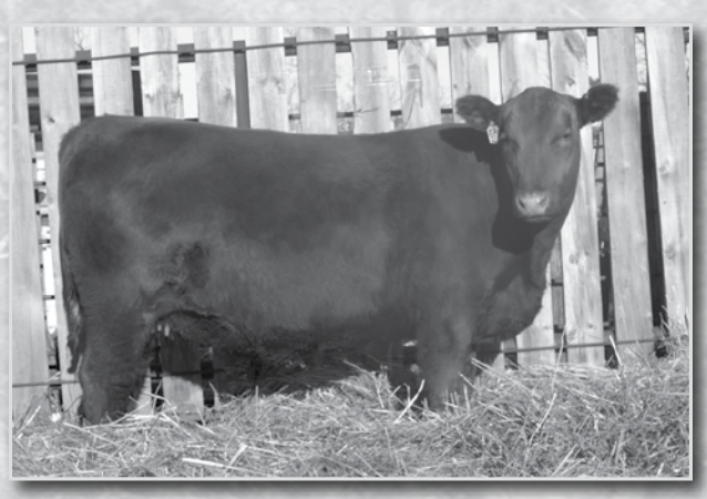
DAHLKE MS.BYRDIE 19D Sells as Lot 82.