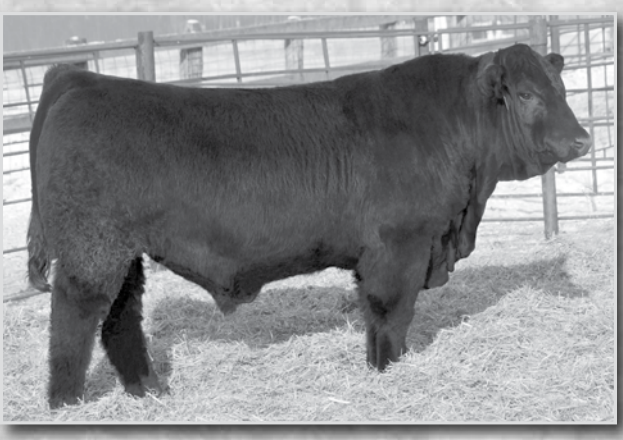
LRSF LRL EISENHOWER E164 Sells as Lot 30.