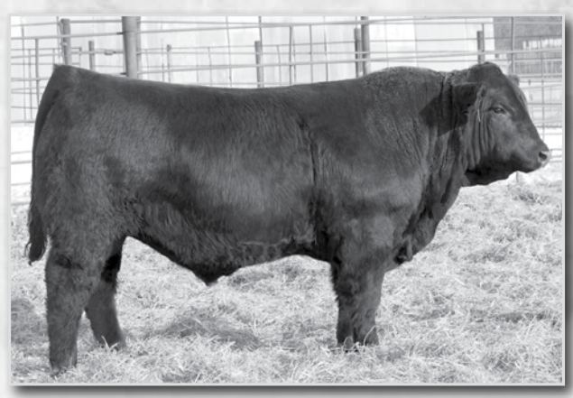
LRSF LRL PATTON E141 Sells as Lot 28.