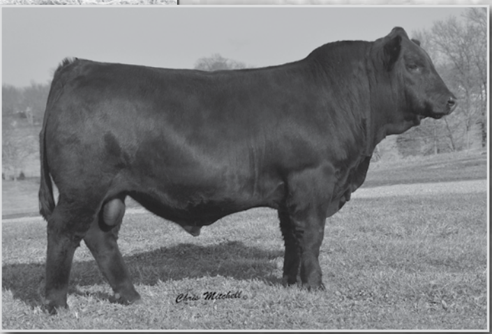
CCRO CAROLINA LEVERAGE 3214A Sire of Lots 5-9.

Every year there's a bull that takes home the crown of heaviest adjusted weaning weight in the pen and this year, Momentum E116 is that calf. His adjusted weaning weight of 862 pounds was good enough to deliver a ratio of 121. Talk about power. And it's easy to see where he gets his power and quality from. His dam has been an outstanding cow for us, producing two bulls who sold through previous production sales, two females who are now working in our herd, and lot 62 in this sale.