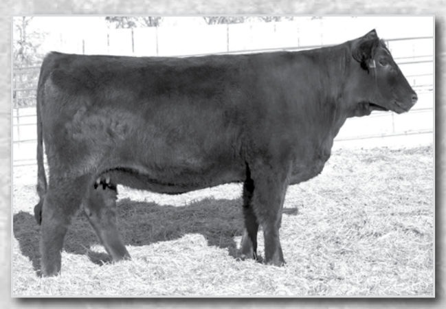
LRSF LRL PANCAKE D48 ET Sells as Lot 56.