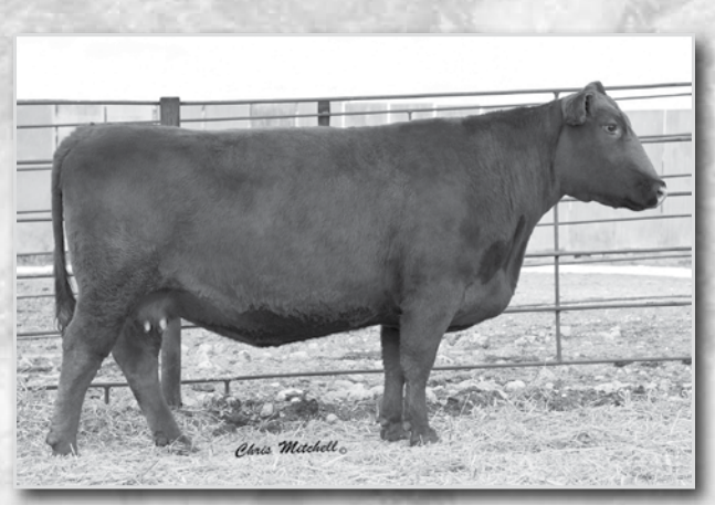
LAKOTA W1 Dam of Lots 44-46.