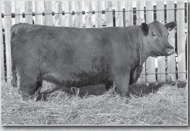
DAHLKE HANNAH 30D Sells as Lot 81.

This smooth made heifer is sure to attract your attention with her beautiful eye-catching phenotype. 24D is built for longevity, combining her moderate frame size with her fluid range of motion when she gets on the move. She has a sweetheart disposition that will work for any age. Ratioed 107 IMF, 111 REA. Bred 7-4-17 to Dahlke Endeavor 9 due 4-13-18.