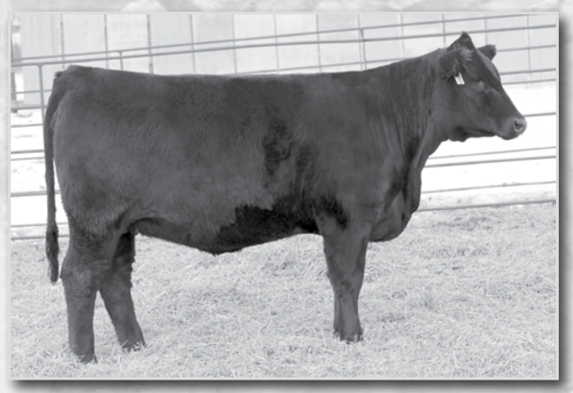
LRSF LRL PANCAKE D86 ET Sells as Lot 57.