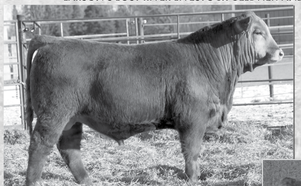
LRSF LRL SPOTLIGHT E169 Sells as Lot 41.