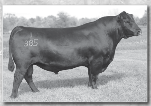
CONNEALY COMRADE 1385 Sire of Lots 23, 24.