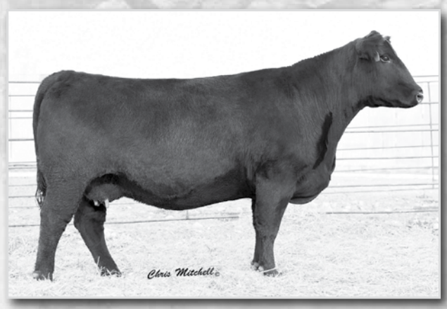
LRSF NELLIE Y5 ET Dam of Lot 20.