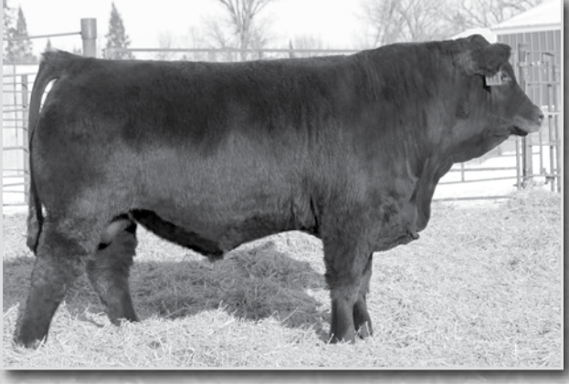
LRSF LRL ULYSSES E151 Sells as Lot 29.

Calves with width and depth are always going to weigh up. And if you stretch that body type out a little, you're really going to have some whoppers. Those are exactly the type of calves you're going to get with Sherman E178. He is as long bodied as any calf in the pen with great depth of body and width. When you get behind him, he is super square and carries his muscle deep into his quarter. He gets many of his great qualities from his outstanding sire and many more from his dam. She is very functional purebred Gelbvieh cow with a great udder and near perfect feet. She's a cow that would fit nicely into any herd.