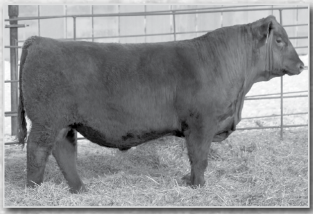
LRL NASDAQ E9 Sells as Lot 33.