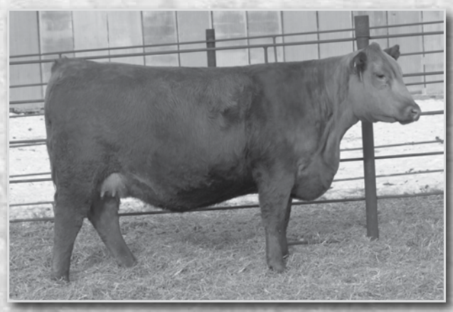
LRSF LRL KENZIE D24 Sells as Lot 64.