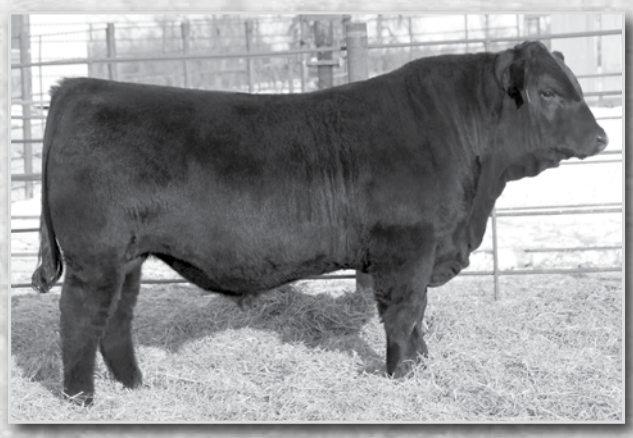
LRSF LRL VINTAGE E84 Sells as Lot 19.