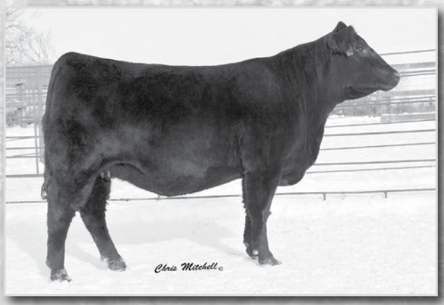
LRSF LRL COTTON CANDY C5 Dam of Lot 10.