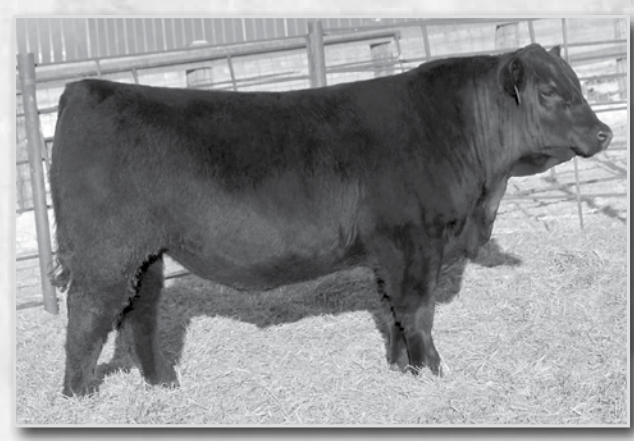
LRSF LRL CONCENTRATION E187 Sells as Lot 22.