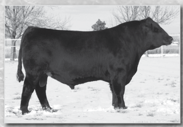
VRT LAZY TV WATCHMAN W021 Sire of Lots 61, 62.

We feel this is one of the great females in this year's offering. As you can see from her picture, Improvement D27 possesses tremendous natural depth and dimension. What you can't see from her picture is the amount of thickness and power she has in her hind quarter. She is also as easy going as a tomcat and that's always a plus. And if you take a look at her EPD's, she is incredibly sound and balanced with 14 traits that rank at or above breed average. She calved January 19, 2018 with a heifer calf weighing 87 pounds sired by JKGF Ditka C85. Lot 59a: F42