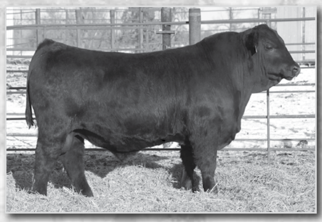
LRSF LRL PERSHING E199 Sells as Lot 31.