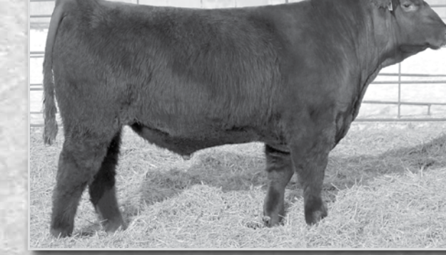
LRL LOCHTE E111 ET Sells as Lot 44.

Lochte E111 ET is the first of three full ET brothers out of the great Bieber Deep End sire and one of our very best purebred Red Angus cows, Lakota W1. She is a direct daughter of the maternal legend, Seeger Lakota 9708, the matriarch of our Red Angus herd. Couple that maternal strength with the growth and carcass traits Bieber Deep End features, you end up with a set of balanced calves with great performance.