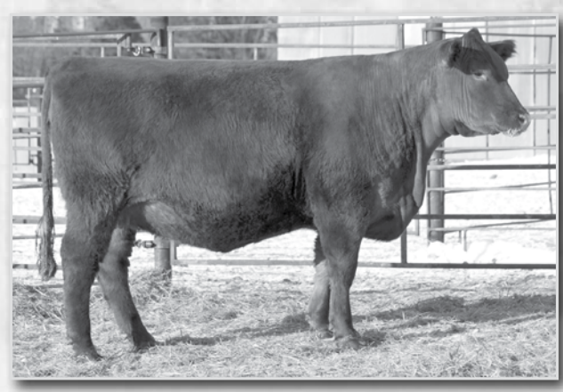
LRSF LRL SARA D9 Sells as Lot 70.

Cherri D107 is a very attractive female with a dark red haircoat that is so easy to like. She is built very similarly to her sire and maternal grandsire with a ton of muscle shape and depth of body. She is definitely easy on the eyes. And the calf she is carrying is going to be good. Take a look at lots 22 and 41 to see what her service sire can do. She's due March 1, 2018 with a calf sired by DLW Highly Focused 503C.