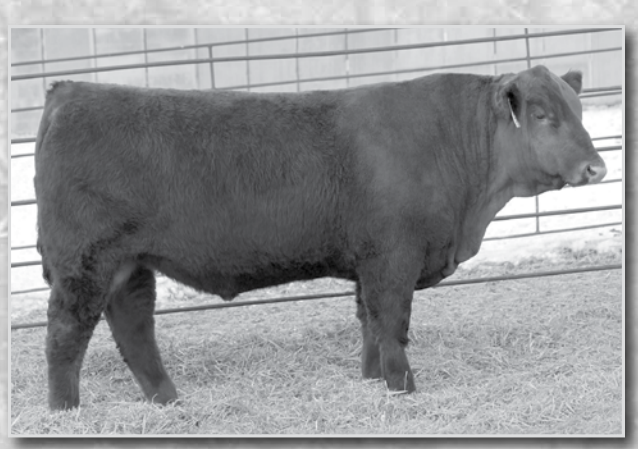
LRL PACIFIC E115 ET Sells as Lot 45.