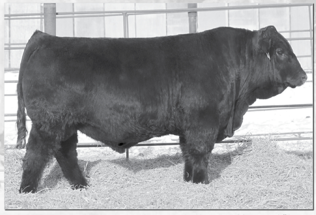
LRSF LRL EXPANSION E105 ET Sells as Lot 2.

Expansion E105 ET is built very similarly to his full brother, lot 1, with an added benefit. He's not only homozygous polled, he's also homozygous black. The depth of body and overall power this bull has is truly impressive. And it' not just his phenotype that's impressive, his EPD structure is incredibly strong. He ranks above breed average for BW and has explosive growth traits ranking in the top 1%. Talk about a curve bender. He also sports some of the best maternal traits you'll find in the breed, all ranking in the top 10%.