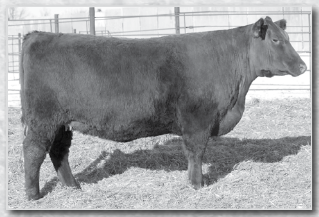
LRL DYNAMIC D4 Sells as Lot 76.