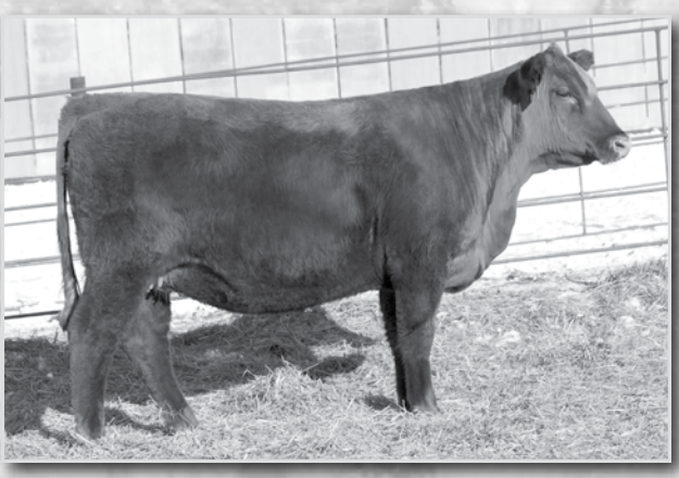
LRL PENNY D218 Sells as Lot 74.

Penny D218 is backed by a great female producing mama cow. This girls dam produced our high selling bred heifer in 2016 going to Prairie Hills Genetics of ND and an open heifer that sold on the ND Red Select sale going to Dahlke Red Angus. Penny D218 does not only score high for maternal traits, she is very strong phenotypically. She's due February 15, 2018 carrying a purebred Red Angus heifer calf sired by H2R Profitbuilder B403 and not only are his bull calves great, his females are too.