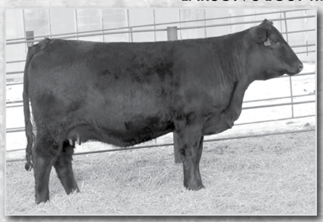
LRSF LRL BLACKSTAR D49 Sells as Lot 55.