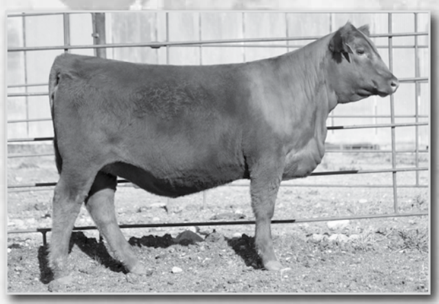
E54 Maternal sib to Lot 74.

Kansas D241 is a paternal sister to lot 73 and is designed very similarly. Lot necked, deep bodied and very sound on her feet and legs. She also ranks highly in the performance department with top 30% WW and top 23% YW. Couple that with the calving ease and overall balancer of her service sire, she will have a no-miss calf. She's due April 14, 2018 carrying a heifer calf sired by LSF KCC True Grit 6619D.