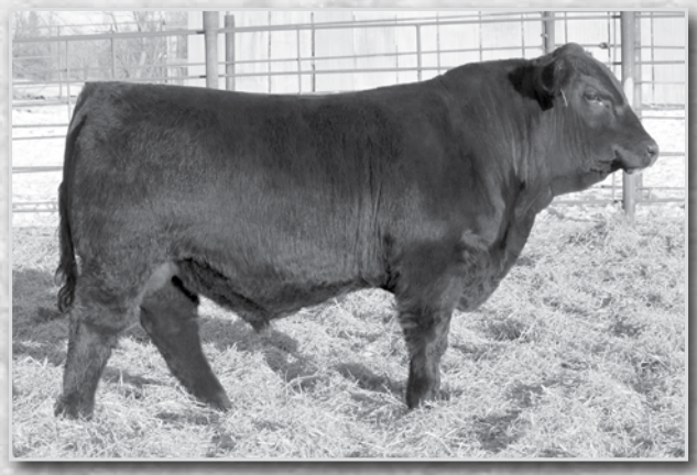
LRSF LRL TOROUE E6 Sells as Lot 10.