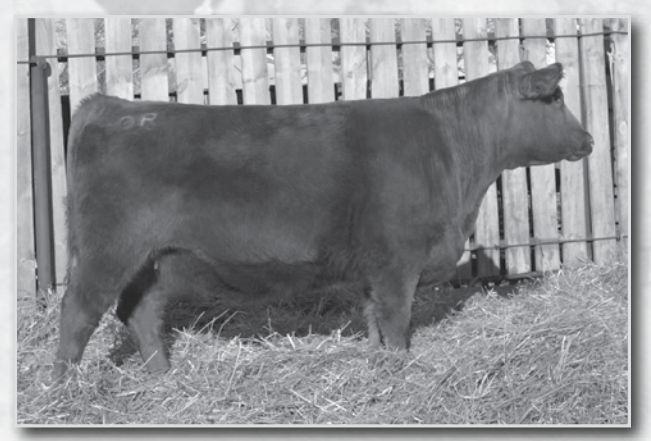
DAHLKE WILLIES GIRL 24D Sells as Lot 84.