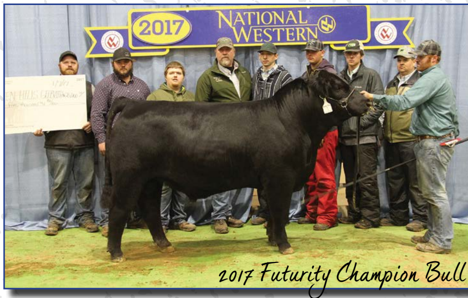
2017 Futurity Champion Bull