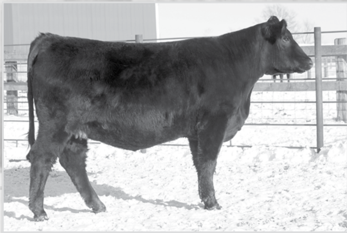
LRSF LRL SARAH C43 Sells as Lot 61.

Sarah C43 is a very fancy made female from a great cow family. Her great granddam, Sarah 5J, can be found in many of our pedigrees. The maternal traits are bred into this female. She sells safe to Connealy Comrade 1385 with a heifer calf due February 11, 2017.