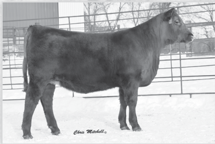
LRL LAKOTA D55 Sells as Lot 59.

Lakota D55 is another fine addition to our Lakota line of females. This line of cows is easily the most productive line of Red Angus cows we own and Lakota D55 is proof. She is long necked, big middled and has an excellent disposition. She also has a bullet proof set of EPD's. Her HerdBuilder index ranks in the top 16% of the Red Angus breed, her GridMaster ranks in the top 5% and her growth traits rank in the top 4%. Great cow family, great numbers and a great heifer. And don't forget she sells halter broke.