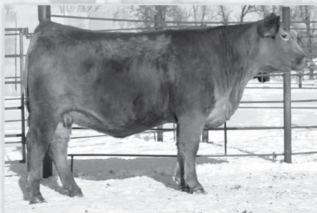
LRSF LRL KANSAS C12 Sells as Lot 66.

Kansas C12 is one of the most powerful and complete females we are offering this year. She is clean fronted, deep bodied and sound footed. She has a great disposition and looks to be setting down an excellent udder. Kansas C12 should go on to be a terrific mama cows. Sells safe to H2R Profitbuilder B403 with a heifer calf due February 11, 2017.