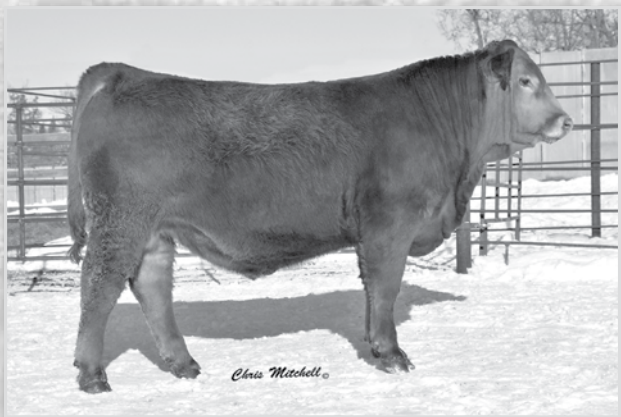
LRSF LRL ZEUS D213 Sells as Lot 18.