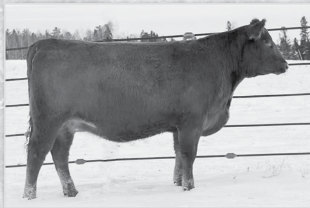
DAHLKE MS. GOLD DIGGER 282C Sells as Lot 74.

Another Birdie lineage female that is carrying a Merlin sired calf which is exciting in itself. She could easily pay for herself with her first calf. We sold a maternal sister to Skeeter Creek Angus in 2015 on this sale. These Birdie females are known for their excellent nature and docility. A.I bred to (Genex) LJC Merlin 937C (#1535025) on 5-19-16. P.E to Dahlke Energy 260C (#3470682) from 6-25-16 to 8-27-16. Ultrasounded safe to A.I date for a 2-27-17 calf.