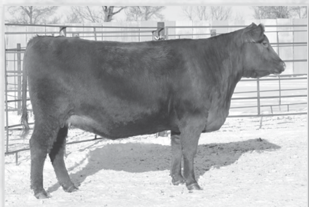
SADIE B200 Sells as Lot 72.

Ursa C33 is an eye appealing female with a great disposition. She also features great calving ease EPD's. With these traits, she should be every farmers friend at calving time. She sells safe to H2R Profitbuilder B403 with a bull calf due February 11, 2017.