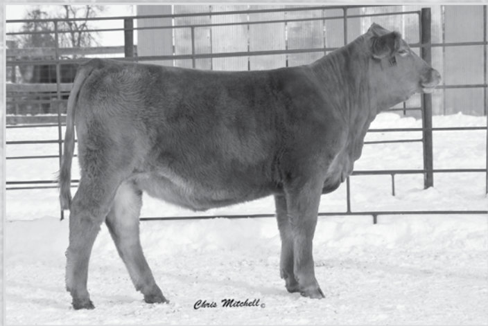
LRSF LRL NELLIE D187 Sells as Lot 58.

Nellie D187 is another female that traces back to our great N605 donor. Her dam is also a direct daughter of Prime Cut, making Nellie D187 a maternal powerhouse. Her sire, CRAN Buck, has been doing an excellent job for us siring moderate, heavy muscled, easy fleshing calves. This female has a bright future ahead of her. She's also homo polled and sells halter broke.