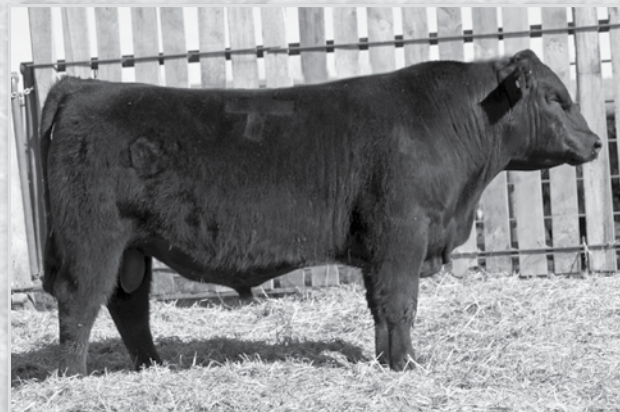
JCB LAZY TV CRATER B431 Sire of Lots 29-31.

Tension D87 is a purebred Gelbvieh ET son out of our Pancake Y153 donor. He is sired by RWG Traction and he has sired excellent some females for us. They will start calving this spring and we are really excited about them. They look to be developing very sound udders and have a ton of depth and capacity. Tension D87 should sire balanced calves and highly maternal females.