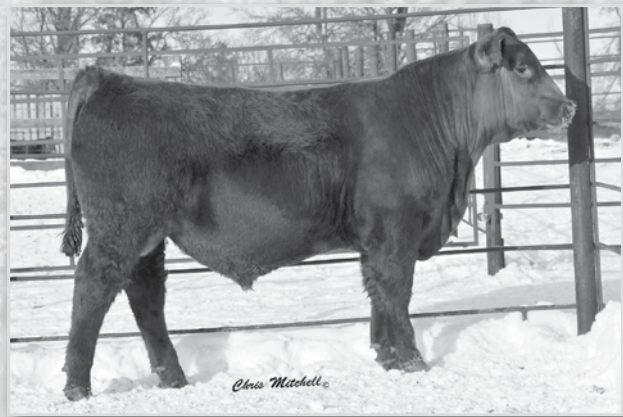
LRL HIGH CAPACITY D33 Sells as Lot 47.

High Capacity D33 is a larger framed Hard Drive son with a ton of growth and very balanced EPD's. He ranks in the top 10% for both growth EPD's and has another 10 traits that rank at or above breed average. He has a very easy going disposition and a great appetite. His dam is another quality female in the Lakota line and is also the dam to a bred heifer in this sale, Lakota C140.