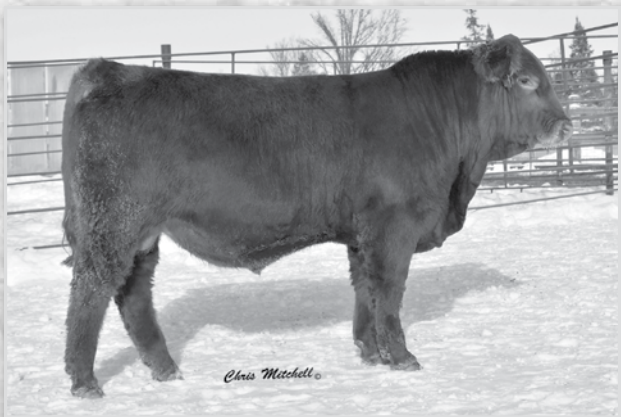
LRSF LRL ACHILLES D79 Sells as Lot 17.