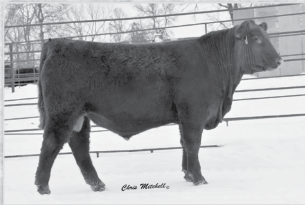
LRL HAIL MARY D66 Sells as Lot 51.

Hail Mary D66 is one of the most complete and balanced bulls in the sale. He is clean fronted, smooth shouldered, big middled and really thick. He also gets out and moves almost perfect. And to top it off, he has a great disposition. Hail Mary D66 is the natural son of our newest Red Angus donor, LRL Lakota W1. She is a very well made cow with a huge middle, wide hip and perfect udder. Hail Mary D66 has an excellent set of EPD's with his HerdBuilder ranking in the top 13% and GridMaster in the top 23%. He is definitely a sale highlight.