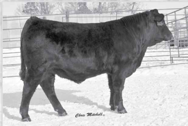
LRSF LRL WAR HAWK D111 Sells as Lot 24.

War Hawk D111 is a very typical son of our Blackhawk herd sire. He has great length and depth of body, tremendous muscling, and very correct feet and legs. We didn't push Blackhawk very hard as a yearling, but seeing how his progeny perform, you can expect to see many more in the future. Don't miss getting in on these fresh and powerful genetics with War Hawk D111.