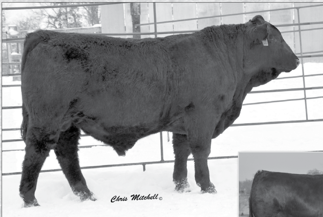
LRSF LRL INFLUENTIAL D89 Sells as Lot 5.