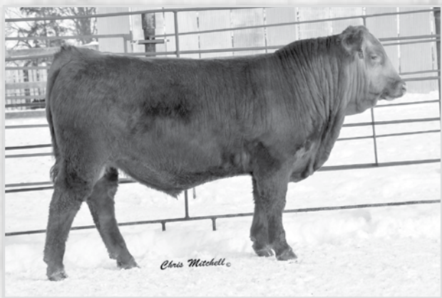
LRL HELIOS D108 Sells as Lot 50.

Helios D108 is definitely one of the most soggy and stout calves in the sale. The mating between Apollo and his very moderate framed Red Angus dam was a home run. They complimented each other so well and Helios D108 is the kind of calf we wish we had a hundred of. He is so deep and thick and his calves should perform well. They will weigh up come sale time and make money.