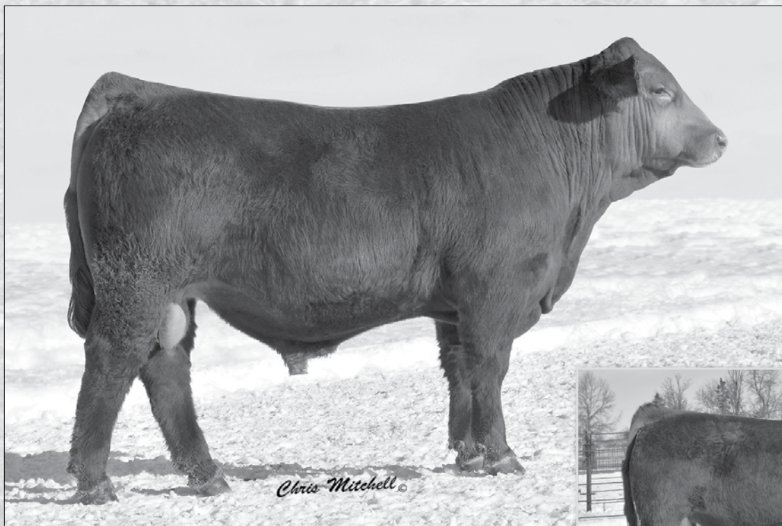
LRSF LRL ARTEMIS D112 Sells as Lot 14.