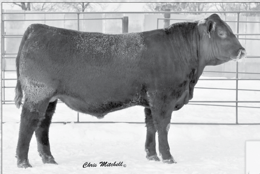
LRSF LRL COMPASS D16 Sells as Lot 41.