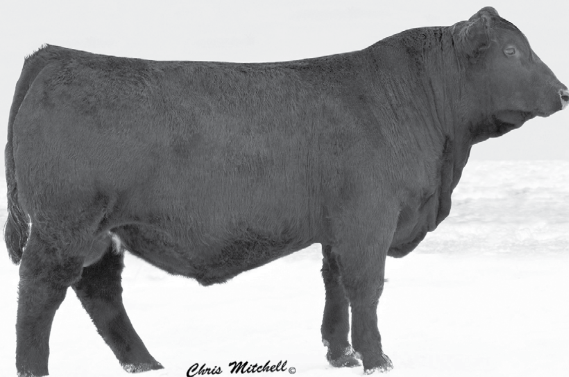
LRSF LRL SENTINEL D43 ET Sells as Lot 1.