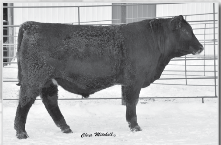
LRSF LRL SENTRY D57 ET Sells as Lot 4.

Bid live online on DV Auction www.dvauction.com