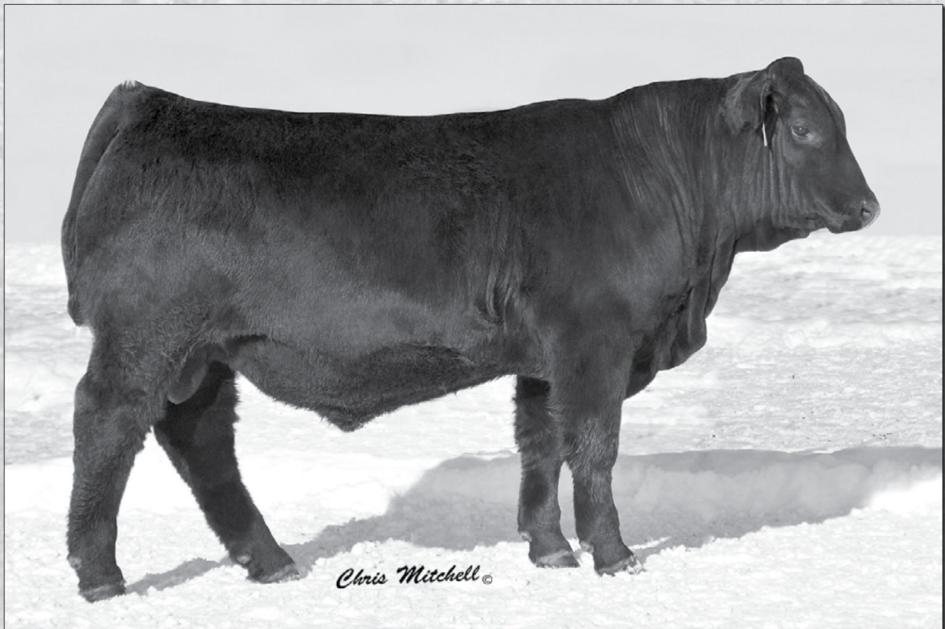
LRSF LRL SPOTTER D73 ET Sells as Lot 3.