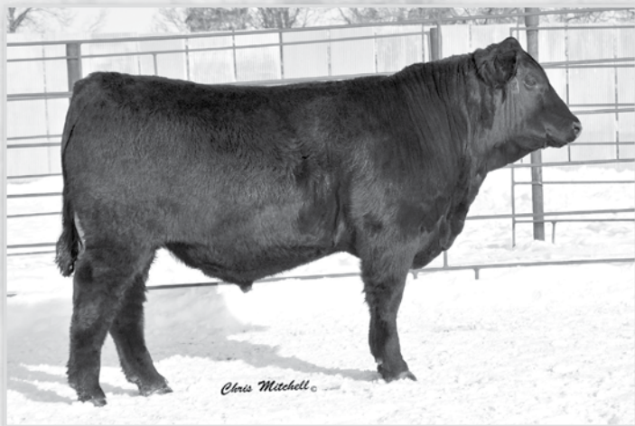
LRSF LRL DEFENDER D70 Sells as Lot 2.