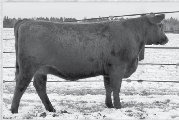
DAHLKE MS. GOLDBLOCKS 279C Sells as Lot 73.

Here's a direct daughter out of 93T who is our original Birdie cow. We have ten females in production at our farm that are descendants of her. 279C is a real moderate easy keeping type that scanned over 5% IMF. Her sire, Solid Gold, is a bull that we have used naturally and artificially for three years now for his ability to sire cattle that are correct on their feet and legs. P.E to Dahlke Energy 260C (#3470682) from 6-25-16 to 8-27-16. Observed being bred 7-8-16. Due to calf April 17, 2017.