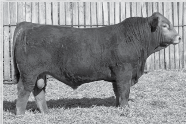
BNC APOLLO B433 Sire of Lots 13-22.

Pluto D94 is a purebred son of Apollo and without a doubt one of the most balanced bulls on the sale. From his incredibly balanced and powerful EPD's (12 traits ranking in the top 30% of the breed), to his great structure, he is a very well rounded calf. He is tight fronted, very deep sided and has excellent muscle structure. He moves very freely and should have great longevity.