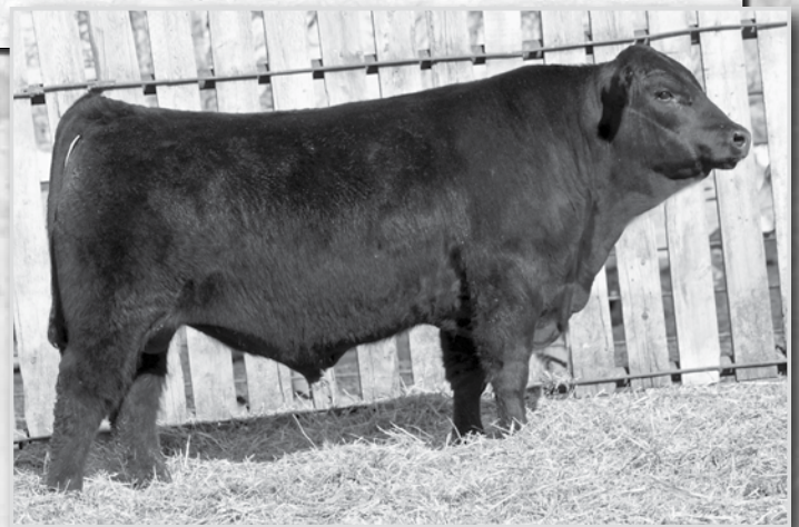
DDGR DDGR BLACKHAWK 10B Sire as Lots 27, 28.