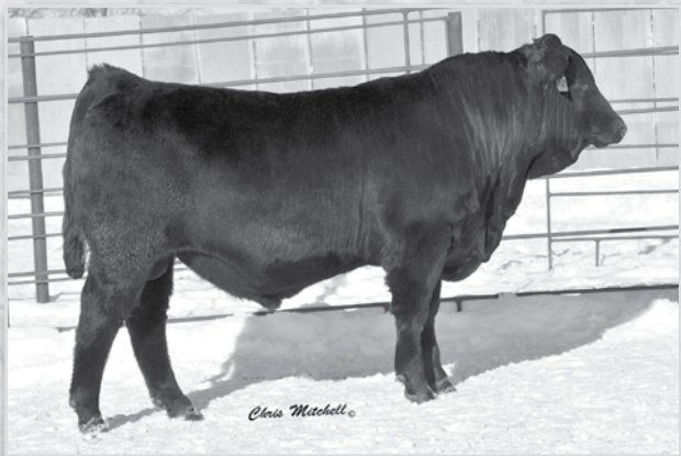
LRSF LRL HEISMAN D202 Sells as Lot 8.