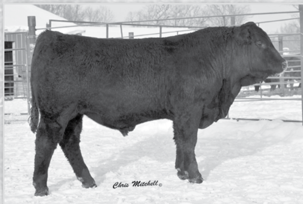
LRSF LRL EAGLE D109 Sells as Lot 23.

We were really excited to get some calves on the ground out of our new herd sire DDGR Blackhawk and this guy surpassed all of our expectations. Eagle D109 has been a favorite of ours since early this spring. His length, muscle development and width make him a top end prospect. Couple his physical make up with his genetic strength, he should sire the kind of calves make money for his new owner.