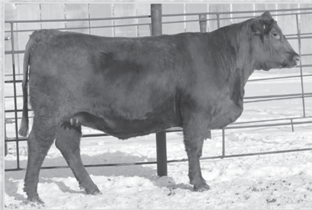
LRL LAKOTA C140 Sells as Lot 62.

Lakota C140 stems from our most productive line of Red Angus females. The Lakota line is synonymous with maternal traits and this female should be no different. She is as eye appealing as any in the offering while maintaining a ton of power. She sells safe to BARM Mr. King 2009 due April 2, 2017.