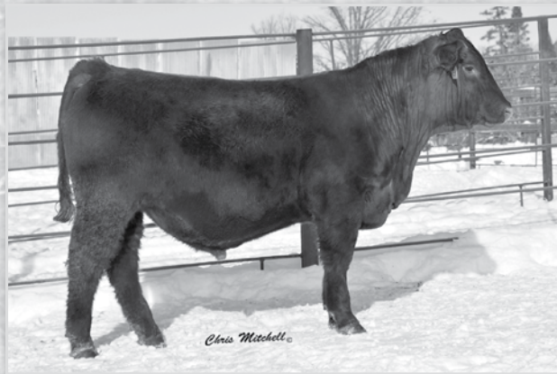
LRL HARD COUNT D71 Sells as Lot 52.

Hard Count D71 is one of the most eye appealing bulls in the sale. His striking phenotype makes him really easy to find in the pen. He is very deep sided and thick but remains clean fronted and tight sheathed. His terrific dam out of Wagon Master has produced some great calves for us including a high selling bred heifer that sold in 2015 to North Country Red Angus of Lakota, ND and another bred heifer that sold in 2016 to Lonny Burrack of Trail. Hard Count D71 will sire attractive and highly maternal calves.