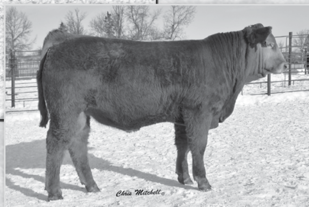
LRSF LRL HERMES D165 Sells as Lot 15.