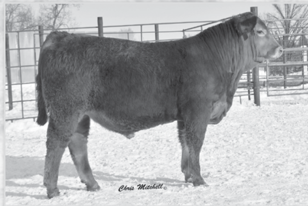
LRSF LRL KRONOS D215 Sells as Lot 16.