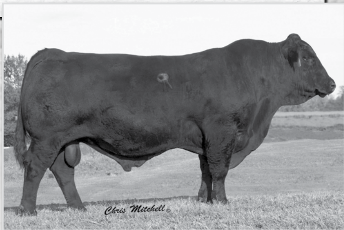
DCSF POST ROCK GRANITE 200P2 Sire of Lot 60.

Genomic enhanced EPDs. Cotton Candy C5 is one the most complete bred females we have ever offered. She is a phenotypic standout, she has a sweetheart disposition and her cow family is one of our best. And to top it off, she carries the service of the $102,000 valued Carolina Leverage bull who is the talk of the Gelbvieh bred. Sells safe to CCRO Carolina Leverage 3214A with a bull calf due February 11, 2017.