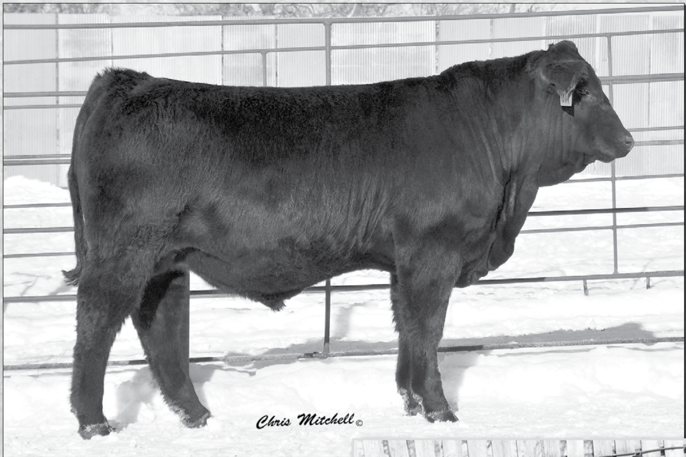
LRSF LRL FALCON D169 Sells as Lot 27.