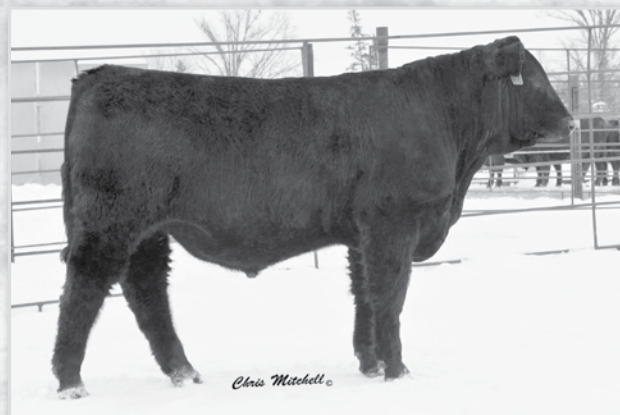
LRSF LRL AUTHORITY D206 Sells as Lot 6.