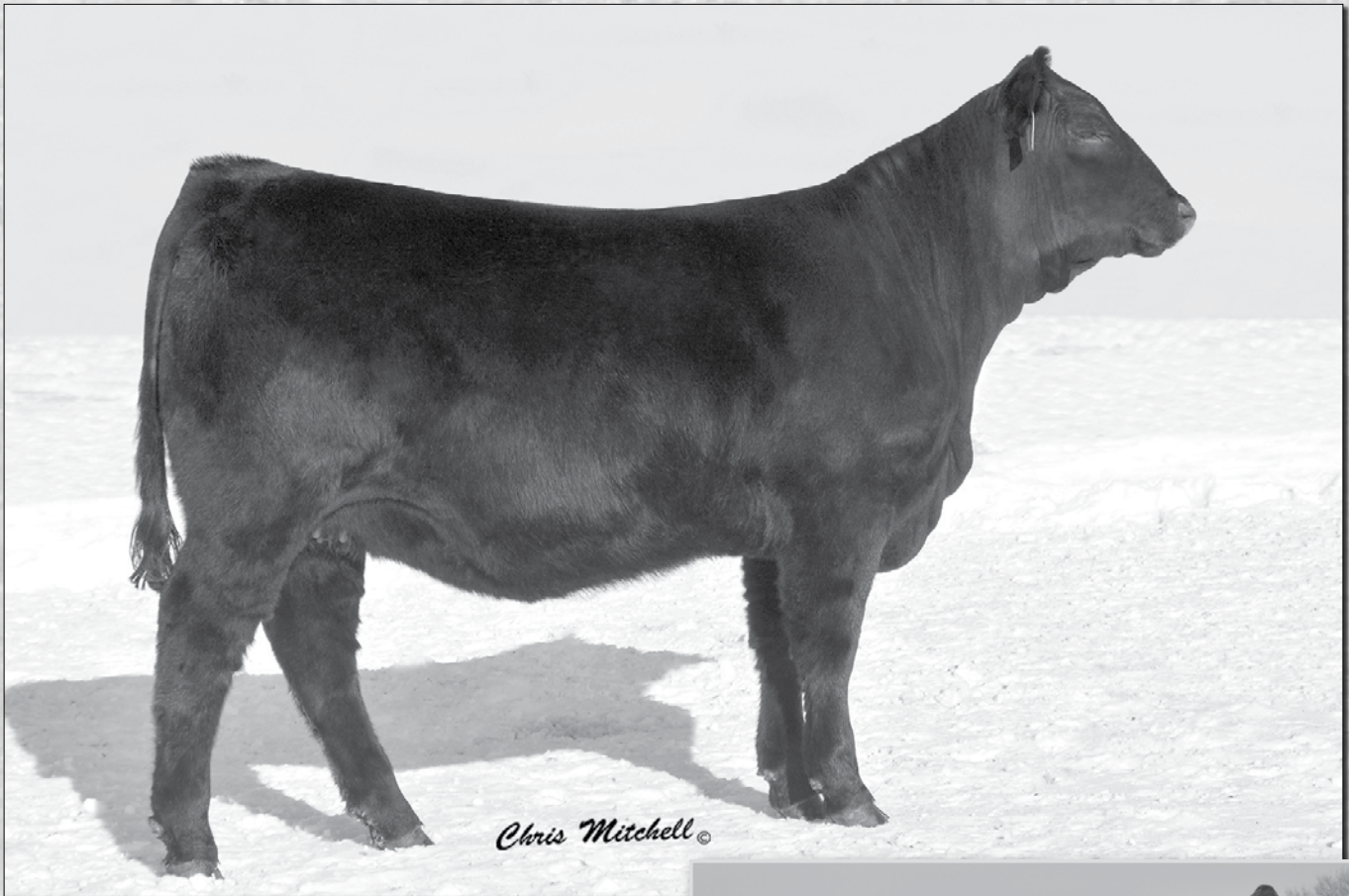
LRSF LRL NELLIE D34 Sells as Lot 56.