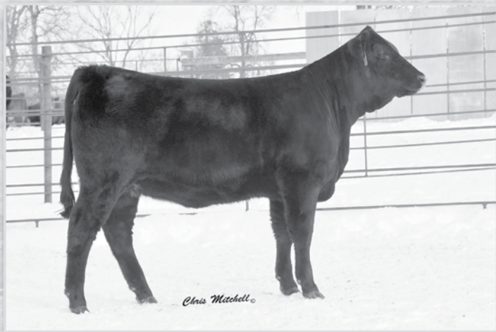
LRSF LRL SARAH D41 Sells as Lot 57.

Sarah D41 is a direct daughter of the ever-popular Lazy TV Sam and with progeny like this girl, it isn't hard to see why he's been so heavily used. Not only are Sam progeny eye appealing but they also excel on paper. Sarah D41 has 11 traits that rank within the top 30% of the Gelbvieh breed. With EPD's like that and sweet look, this heifer should make an excellent addition to any herd. Don't forget she's homo black and homo polled. She sells halter broke.