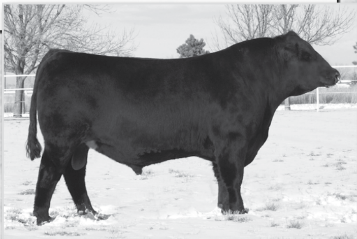
VRT LAZY TV WATCHMAN W021 Sire of Lots 1-4.