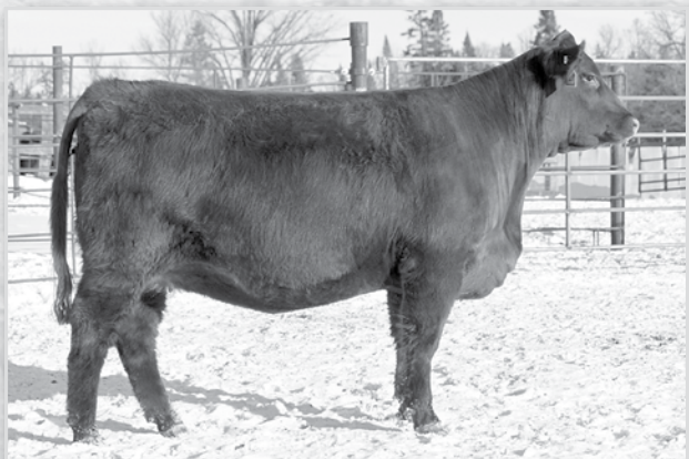
LRSF LRL GOLDY C14 Sells as Lot 67.