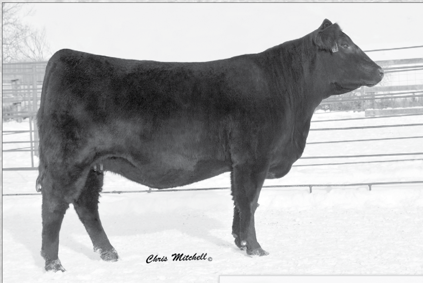
LRSF LRL COTTON CANDY C5 Sells as Lot 60.