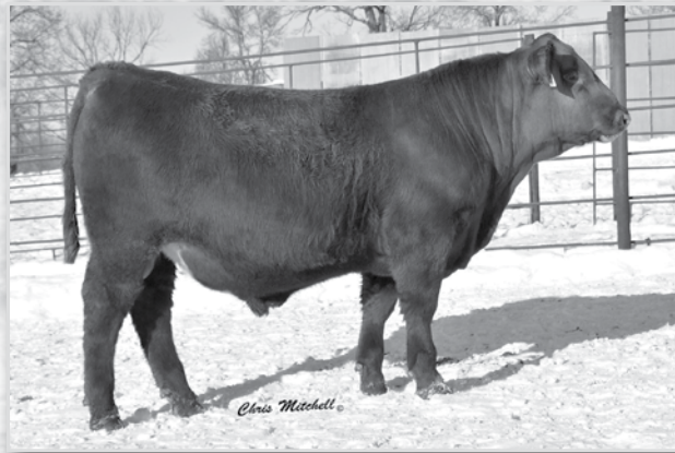
LRL DRIVEN D63 ET Sells as Lot 53.

Driven D63 is one of the heaviest and highest performance calves in the pen. He is a true performance powerhouse. Check out his powerful WW EPD that ranks in the top 7% and YW EPD ranking in the top 12%. He has been performance standout since early this spring and we knew he was going to be at the top of our bull pen. But he isn't just about performance, take a look at his excellent carcass traits. His MARB EPD ranks in the top 25% and his impressive REA EPD ranks in the top 4%.