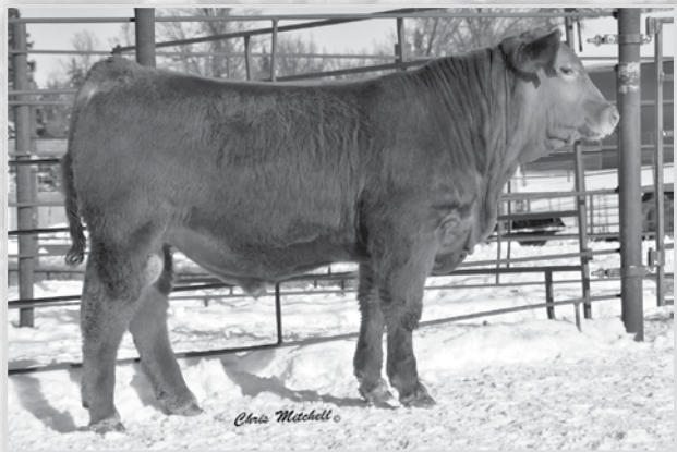
LRSF LRL HERACLES D231 Sells as Lot 19.