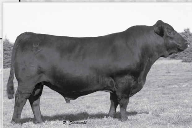
HYEK BLACK IMPACT 3960N Sire of Lot 42.

Compass D16 has been a standout since he was calf. At an early age, you could see he was going to develop into an impressive bull. His power and mass are what first catches your eye, but he remains clean fronted and clean sheathed, making him very eye appealing. And his young Yukon sired dam is going to be a top cow for us in the future. Her power, dimension and udder quality are all traits we are striving for.