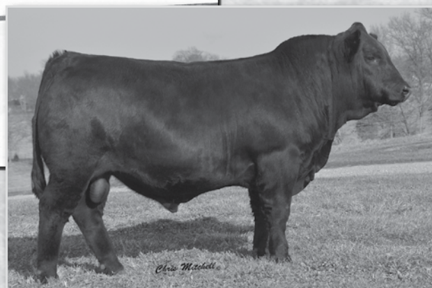
CCRO CAROLINA LEVERAGE 3214A Sire of Lots 5-7.

Genomic enhanced EPDs. Authority D206 represents some of our best and most current genetics. He is the son of the highly-regarded Leverage bull and his dam is in our donor program. In the spring of 2015, she produced 25 grade one embryos and bred back on her first cycle. That pregnancy resulted in this stud. Authority D206 is powerful, yet clean and has excellent growth. Check out his top 1% growth EPD's. He is also homozygous polled.