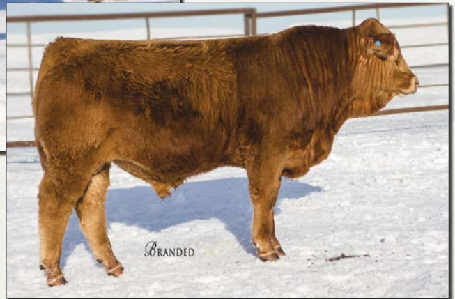
BDOC DALE 060D || Sells as Lot 22.