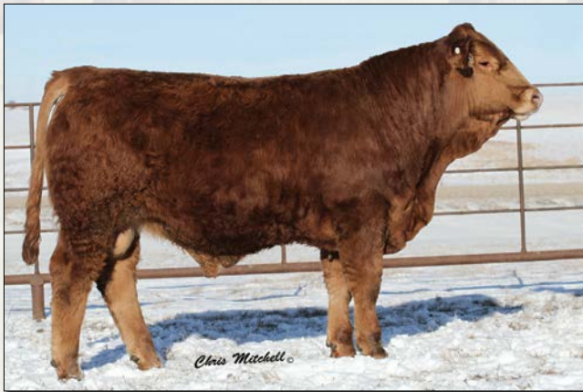
DCHD GOLDEN BUCKLE GELV 726Z || Sire of Lots 38, 39.

Don't overlook this guy, he may be young, but he's good. Out of a no miss cow family going back to the 030L cow who is still active in our herd at 16 years old.