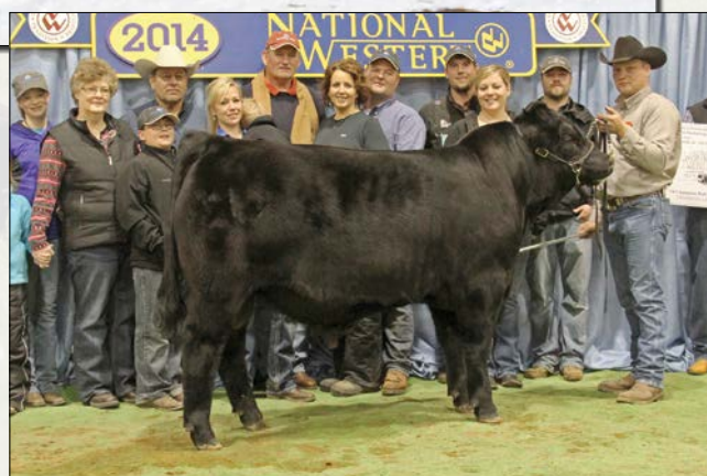
DLW Alumni 7513A ET || Sire of Lots 1, 2.