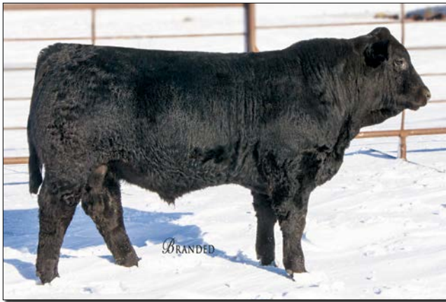
DCHD GOLDEN BUCKLE GELV 193D ET || Sells as Lot 25.