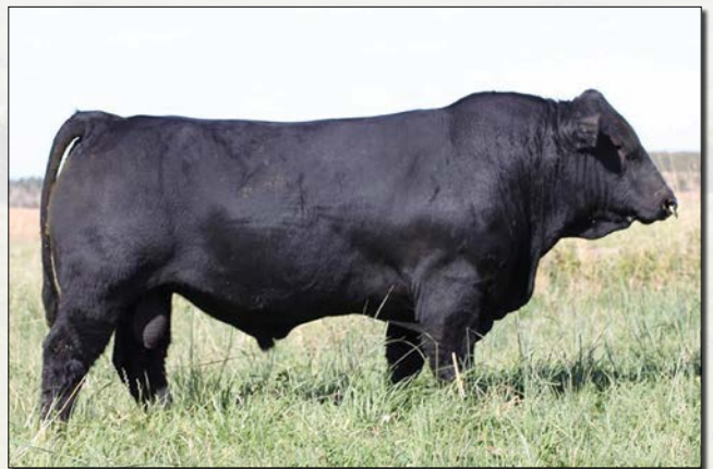
RWG INTENSE 2501 || Sire of Lots 41, 42.

Well balanced heifer that combines a nice balance of calving ease, performance, maternal and carcass values. Top 10% for CE and FPI, top 20% for WW and YW and the top 30% for Milk and Marbling. Sells open.