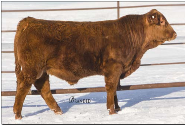
DCHD GOLDEN BUCKLE GELV 005D || Sells as Lot 35.