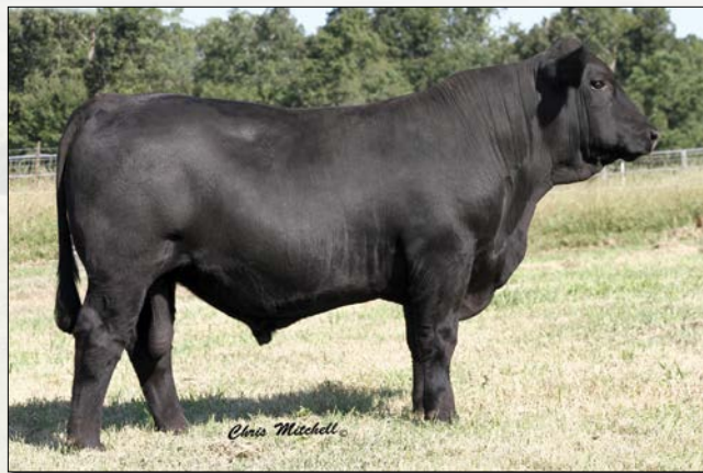
CCRO CAROLINA EXCLUSIVE 1230Y || Sire of Lots 25-27.

Homozygous Black Exclusive son who ranks in the top 2% for carcass weight, 3% for weaning and yearling. If you are looking for performance, he is balanced from top to bottom.