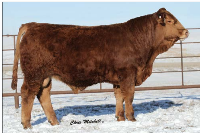
DCHD Golden Buckle Gelv 726Z || Reference Sire F.

A Tremor son we retained and have used on our commercial cows, registered cows and heifers. He combines calving ease and performance. He comes from a strong, productive cow family.