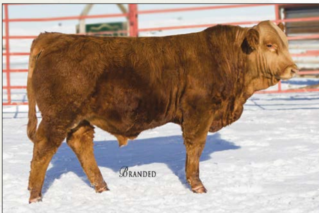
DOCC CIERRA'S GUY 155D || Sells as Lot 12.

This guy comes out of a great first calf heifer who goes back to a strong cow family, including one of Cheyenne's show heifers. He ranks right up there across the board in calving ease, growth, maternal and carcass.