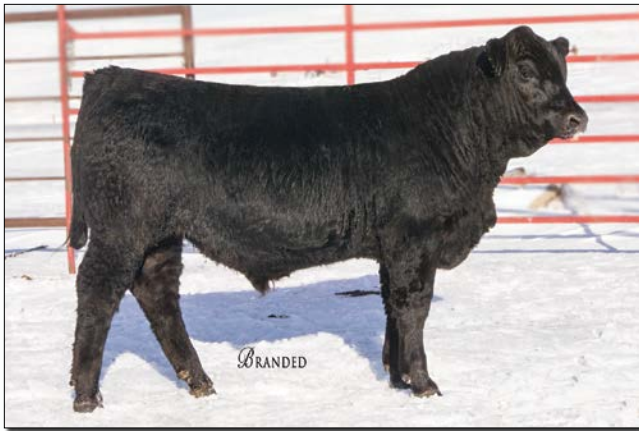
DCHD GOLDEN BUCKLE GELV 298D || Sells as Lot 7.