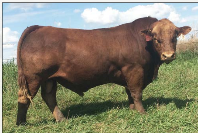
DVE DAVIDSON MCGRAW 21B || Reference Sire G.

McGraw was named the 2014 Reserve Grand Champion Bull at the 2014 FarmFair International. This is the first set of calves to sell out of McGraw and they are proving to be top notch. McGraw is an easy fleshing bull who holds his condition well and adds tons of depth and thickness to his calves, all in a moderate framed package. His daughters are remarkable and we can't wait to see what kind of momma cows they are going to be. In addition to what you see, McGraw rates high in docility and tenderness to complete the package.