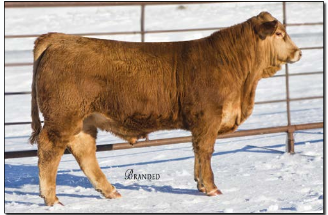
DCHD GOLDEN BUCKLE GELV 121D || Sells as Lot 29.

Homozygous Polled, Non-Diluter bull out of a no miss cow. This guy was our April entry at Agribition and in the Canadian People's Choice Gelbvieh Futurity in November.