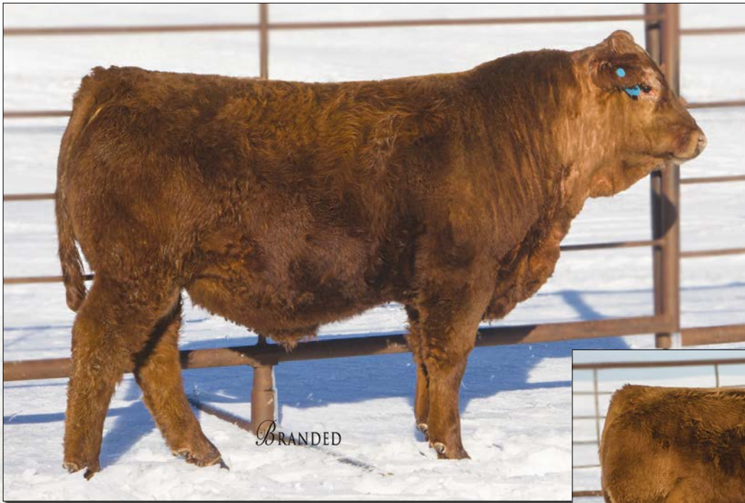
BDOC DONALD 173D || Sells as Lot 21.