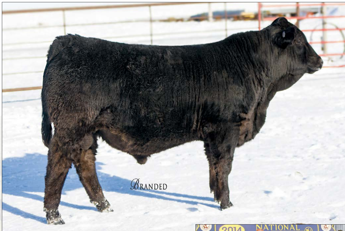
DCHD GOLDEN BUCKLE GELV 156D || Sells as Lot 1.