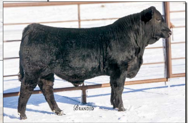
DCHD GOLDEN BUCKLE GELV 209D || Sells as Lot 18.