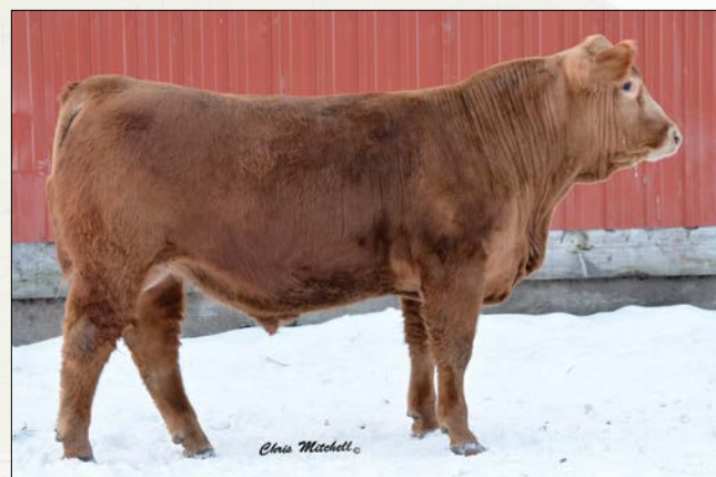
SBMG WINDMAN || Sire of Lots 51, 52.

Performance heifer that ranks in the top 3% for weaning and yearling. Sells open.