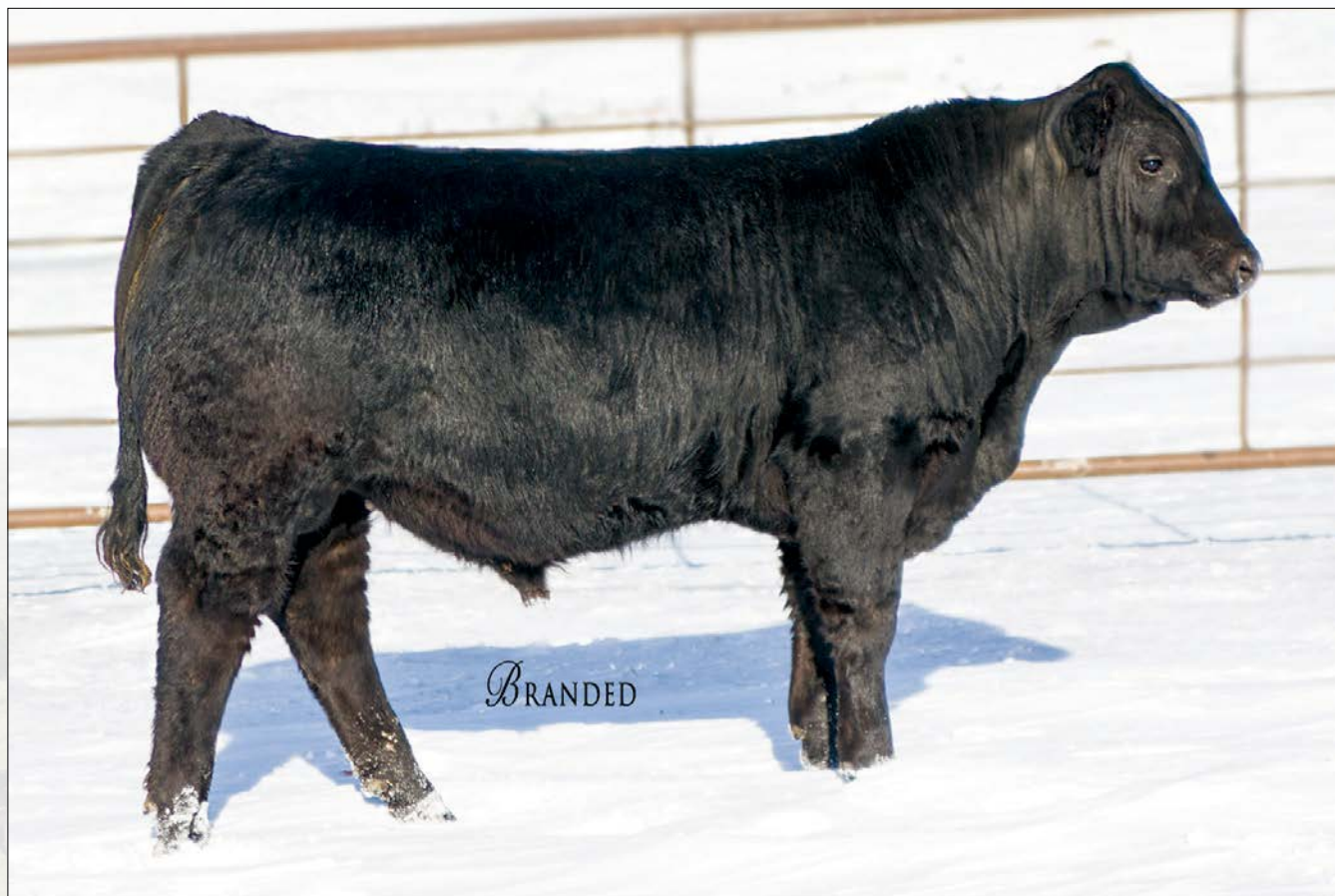
DCHD GOLDEN BUCKLE GELV 066D || Sells as Lot 3.