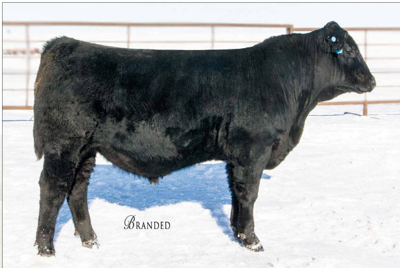
BDOC DRAKE 233D || Sells as Lot 2.