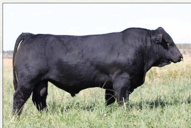
RWG INTENSE Z501 || Reference Sire B.

This will be Intense's last offering of calves as he was injured last year.