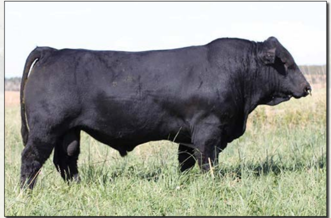
RWG INTENSE 2501 || Sire of Lots 30-34.

This heifer did a great job on her first calf. Great spread from birth to weaning-check him out if you are looking for calving ease and growth all in one package.