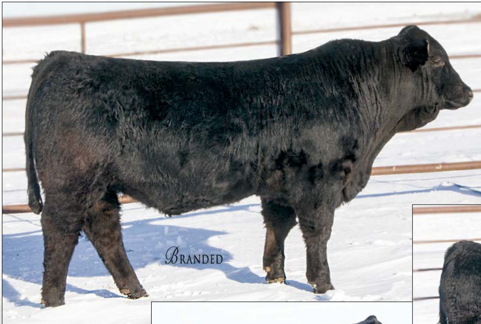
DCHD GOLDEN BUCKLE GELV 154D || Sells as Lot 17.