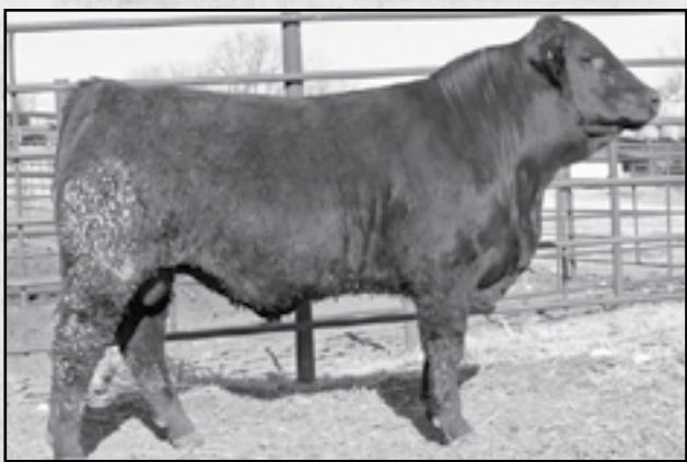
MDR BLACK OAK 5154C ET Sells as lot 10.