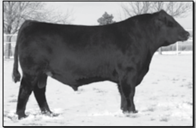
VRT LAZY TV WATCHMAN W021 Sire of lot 22.

Genomic enhanced EPDs. A calving ease son of the heavily used AI sire Watchman. This young herdsire prospect weaned with a ratio of 107 and posted a yearling ratio of 103. His ultrasound IMF ratio is 116. He ranks in the top 10% for milk, top 20% for MB, FPI and TM and the top 25% for CE.