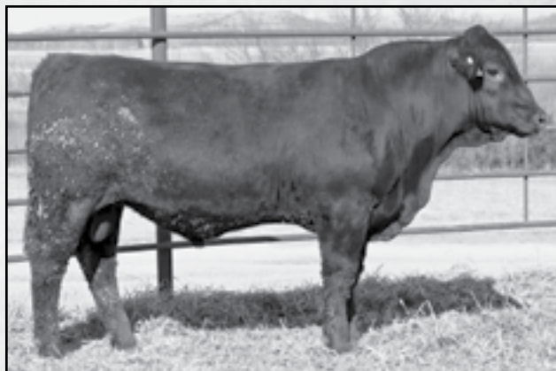
KRH KRH COLOSSAL ARSENAL Sells as lot 75.

Heifer bull that ranks in the top 25% for calving ease and the top 25% for low birthweight and the top 30% for marbling. Dam has a 123 ratio on calves weaned.