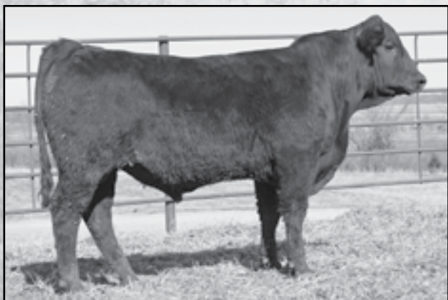
BNG CORNERSTONE 737 Sells as lot 20.