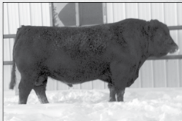
RWG TRACTION 7412 Sire of lot 48

Futurity Eligible. Here is a very stylish young female sired by MDR Crude Dude out of a very impressive Sandhills dam. She is a performance heifer that ranks in the top 10% for weaning and the top 15% for yearling. Sells open and ready to breed.