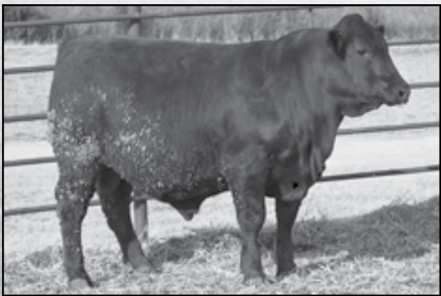
TTTT CADENCE Sells as lot 11.

VIEW VIDEOS OF SALE OFFERING ONLINE AT WWW.MMS.BZ