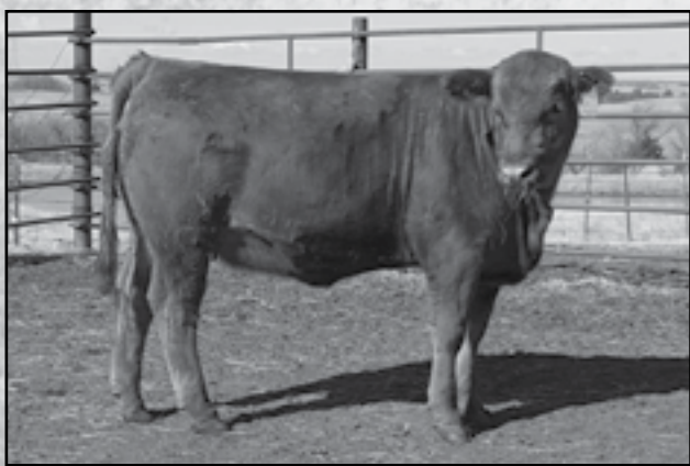
LARM 00C1 Sells as lot 54.