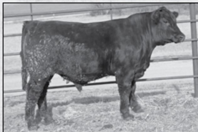
RUPP DARKHORSE 518C Sells as lot 26.

Top 10% for REA and top 35% for marbling. Posted a 1219 yearling weight and a 16.9 adj ribeye.