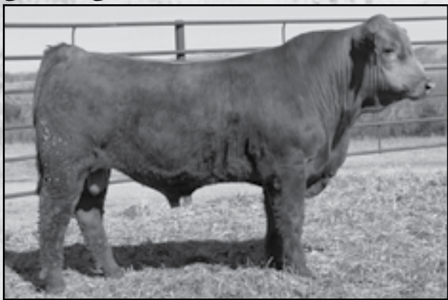
LARM MOONSHINE Sells as lot 9.