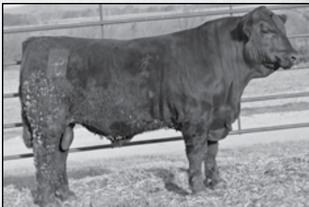
MDR OKLAHOMA EXCLUSIVE 5157C ET Sells as lot 7.

Genomic enhanced EPDs. Oklahoma Exclusive is an ET son sired by Carolina Exclusive out of the donor, R & L Miss Bandolier, the great 6807 daughter that has produced a great one here in lot 7. Top 25% for marbling and calving ease and the top 30% for low birthweight. This Carolina Exclusive son is very impressive with his overall mass, thickness and athletic look.