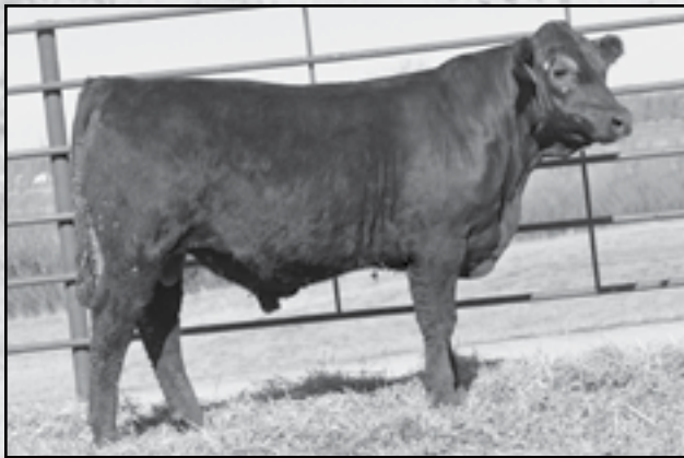
TLRR HEARTBREAKER Sells as lot 25.