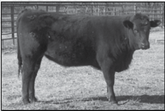
TLRR ARETHA Sells as lot 52.