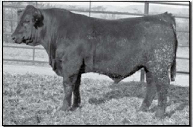
FFFM RANDLE Sells as lot 30.

50% Gelbvieh commercial bull. Low birth of 78 pounds