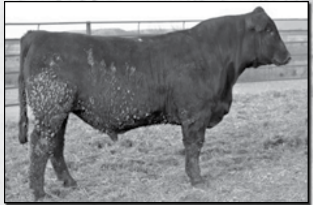
FFFM DUNBAR Sells as lot 29.

50% Gelbvieh commercial bull. Low birth of 75 pounds