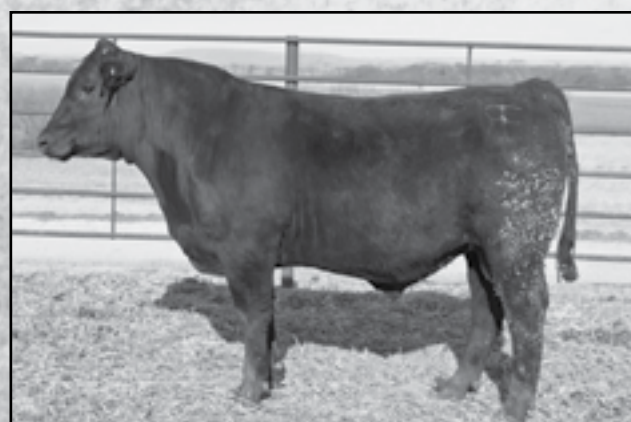
FFFM PETERSON Sells as lot 28.

50% Gelbvieh commercial bull Low birthweight of 68 pounds