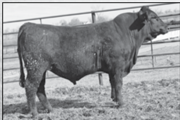
FFFM LITTLE JOE Sells as lot 27.

50% Gelbvieh commercial bull. Low birth of 75 pounds