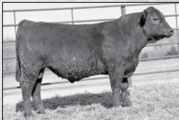
GAMB CAPTAIN Sells as lot 75.

Top 25% for marbling. Ribeye area ratio of 105. Dam has weaned 6 calves for a nursing ratio of 104.