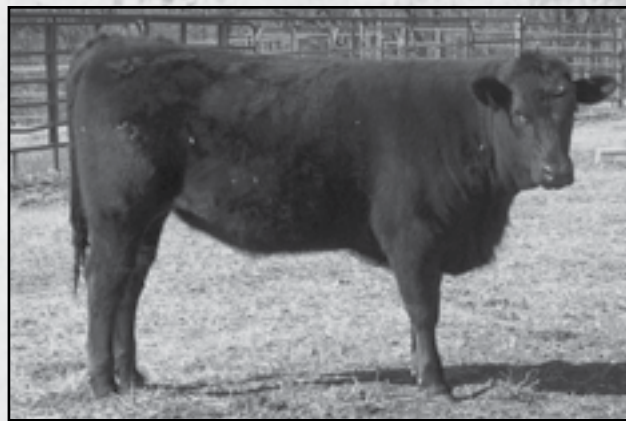
TLRR BARBARA ANN Sells as lot 55.

Futurity Eligible. This purebred futurity heifer is out of the breed leading AI sire Govenor 3N and her dam is a maternal sister to AI sire, Independence. Barbara Ann is well balanced, square hipped and stands on sound feet and moves with a nice easy stride. This young heifer has a lot of potential and would make a nice show heifer and with her pedigree and EPD's, she will be a very powerful addition to any herd. She will make an excellent junior project and is ready to go. Sells open and ready to breed.