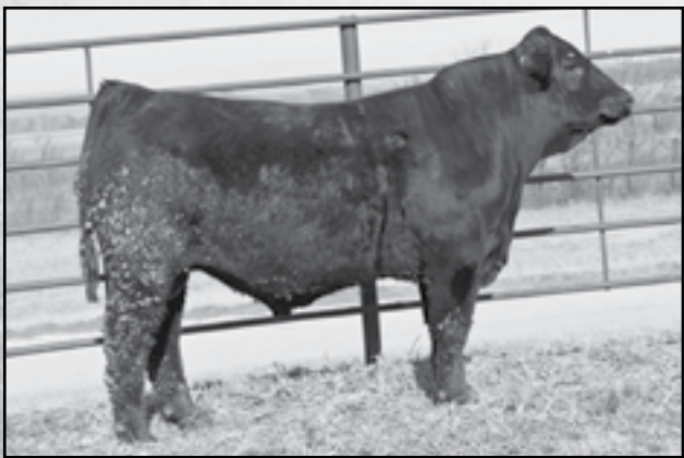
GALG X-FACTOR 20C4 Sells as lot 3.