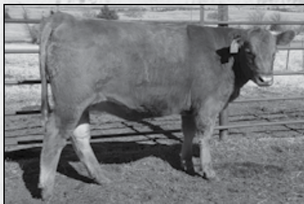
LARM ABIGAIL Sells as lot 46

Futurity Eligible. This young open heifer is very attractive with excellent depth of body and thickness. Loads of potential for show and then a super brood cow prospect. Her dam has weaned 3 calves for a weaning ratio of 103. Sells open and ready to breed.