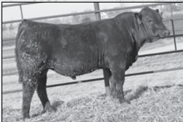
TTTT SWEET CLOVER Sells as lot 5.

Low birth bull at 70 pounds. Weaning ratio of 115 and a Ribeye ratio of 102. Ranks in the top 10% for calving ease. Sired by our calving ease sire Sugar Daddy out of a popular Good Fortune sired dam.