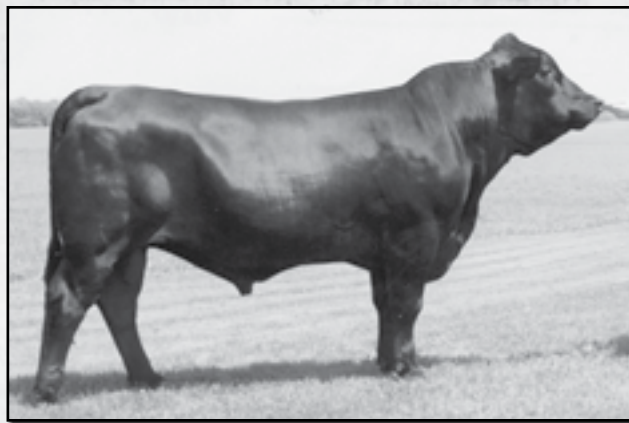
JBOB CAROLINA FORTUNE 2564JET Sire of lot 34

Homozygous Black Homozygous Polled. Performance bred cow that also has strong carcass values. Ranks in the top 3% for WW, top 10% for YW and CW, top 15% for REA and top 30% for MB. Lot 33A HB HP PB Heifer BD: 2-21-16 BW: 71 Sire: JKGf B22 (1289180)