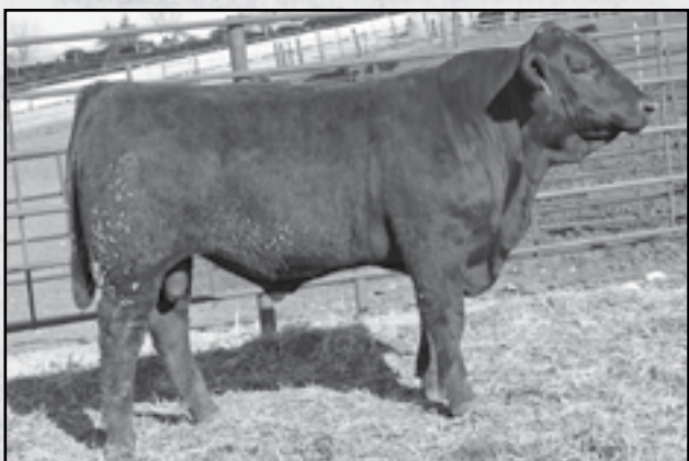
TLRR EL CAPITAN Sells as lot 18.

Genomic enhanced EPDs. Take a look at this low birth/high performance bull. Weaning ratio of 111, yearling ratio of 108 and REA ratio of 105. Ranks in the top 1% for REA and YG, top 10% for YW, top 15% for FPI, top 20% for CE, top 25% for WW and TM.