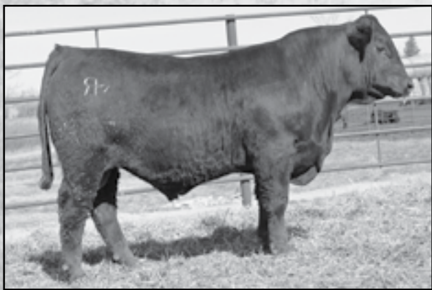
RUPP CRUDE 528C Sells as lot 4.