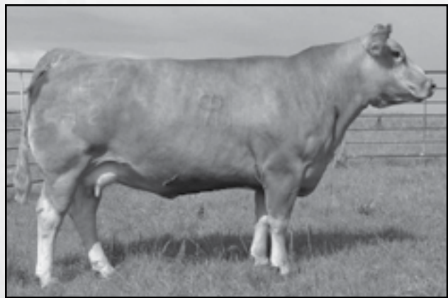
DCSF POST ROCK WILMA 147H ET Maternal grandam of lot 36

Here is a double black, double polled Carolina Fortune daughter with top 25% or better EPDs for WW, YW, MK, TM. Her pedigree also includes: Sherman Tank, JRI Heavy Equipment and Mytty In Focus. She should be a great addition to someone's herd. Pastured exposed to QC Final Answer(AMAN 17389827) 12/10/15 - 2/15/16. Lot 34A DB DP 75% BA Heifer BD: 11-25-15 BW: 74 Sire: RHRT Trendy George(1225681).