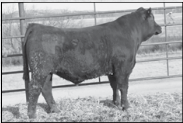
TTTT COWBOY LEGEND Sells as lot 2.