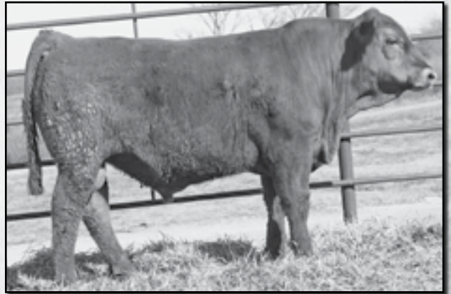
GAMB CONWAY Sells as lot 23.

Genomic enhanced EPDs. Carcass and performance combined in a very complete red package. This bull ranks in the top 2% for marbling and the top 10% for REA and FPI. He had a yearling weight of 1226 with a yearling ratio of 105.