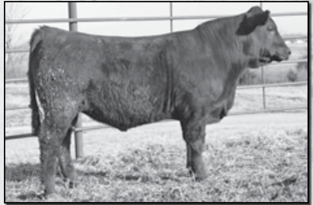
TTTT SPECIAL BLEND Sells as lot 25.

Genomic enhanced EPDs. Homozygous Black Homozygous Polled heifer bull. Ranks in the top 2% for CE and top 20% for low birthweight. REA ratio of 103 and an IMF ratio of 101. Sired by our calving ease sire Sugar Daddy.