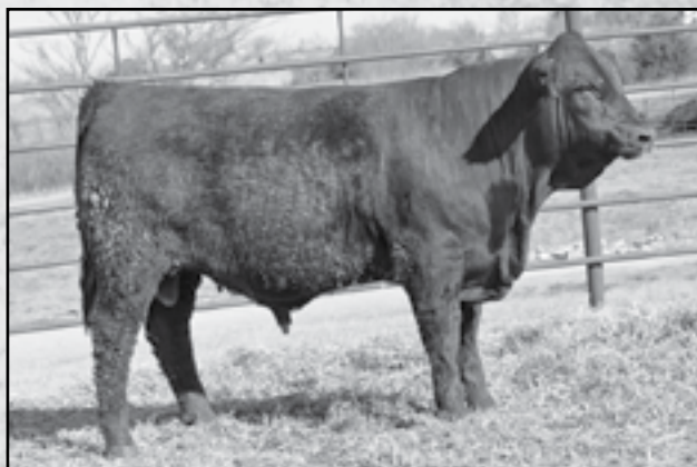
BNG CENTURION 305 Sells as lot 8.

Calving ease, low birth bull sired by JRI Super Duty 9Y53. Ultrasound IMF ratio of 113. Ranks in the top 5% for CE, top 20% for BW and Milk. Heifer Bull