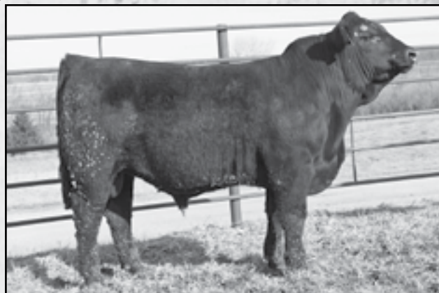
BNG CHALLENGER 731 Sells as lot 75.

Performance bull that will add pounds to your calves at weaning and yearling. Weaning ratio of 109, yearling ratio of 120 and ribeye ratio of 109. Ranks in top 4% for CE and top 15% for YW.