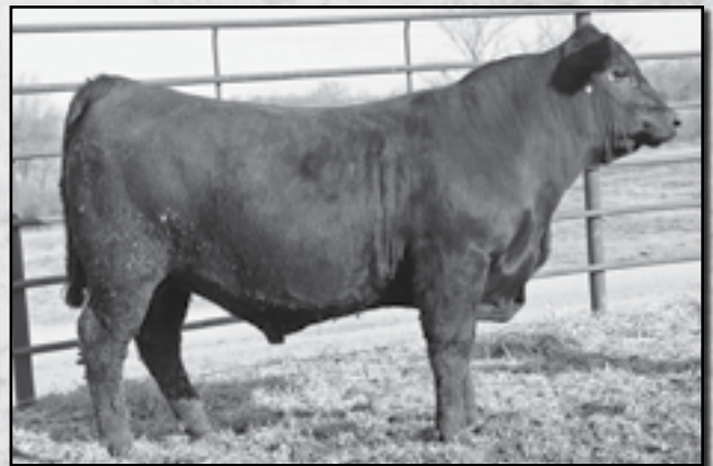
HSM ANNABELLE'S BOY Sells as lot 24.

Genomic enhanced EPDs. A very strong percentage Gelbvieh bull that puts it all together. Quality, calving ease, performance and carcass in a complete package. He is the number 1 ribeye bull in the sale with 18.45 adj REA. He ranks in top 1% for MB and FPI, top 15% for CE and WW, top 20% for BW, CW and REA. He posted a weaning ratio of 109 and a yearling ratio of 110.