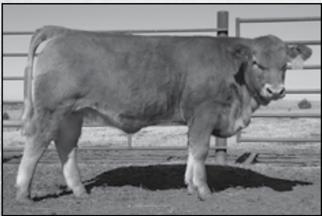
LARM 10C9 Sells as lot 53.