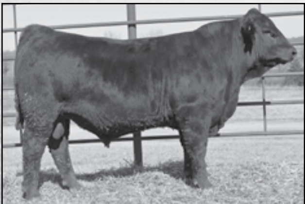
RUPP WITTEN 513C Sells as lot 19.