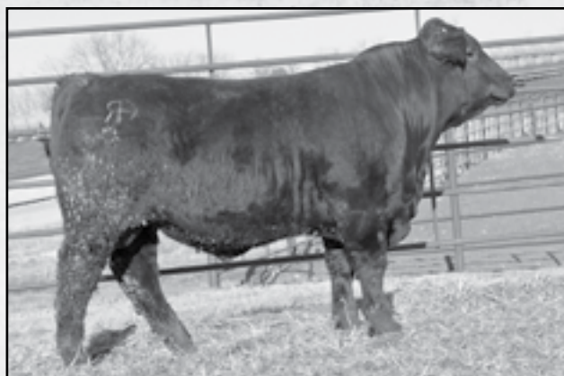
RUPP SOFTY 520C Sells as lot 75.

Low birth bull with a 76 pound birthweight and top 25% for calving ease. Weaning ratio of 102 and yearling ratio of 103. Take note of the 1304 adjusted yearling weight.