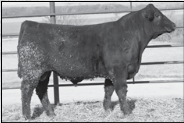
GAMB CADILLAC Sells as lot 17.