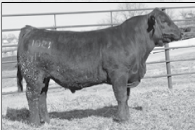
TTTT ANCHORS AWAY ET Sells as lot 6.

Genomic enhanced EPDs. Here is a homozygous black homozygous polled son ET son of the great Hottdamn donor. Top 20% for CE and MB. Outstanding pedigree and quality combination in this herd sire prospect.