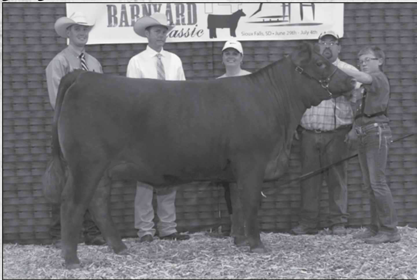
WORR RED JESSICA 201A Donor dam of lot 31 embryos.