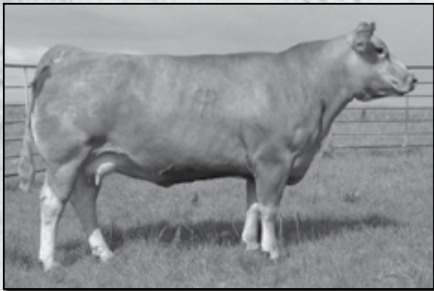
DCSF POST ROCK WILMA 147H ET Maternal grandam of lot 51.