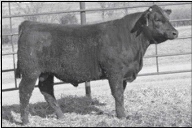
TTTT LOOKOUT SUGAR Sells as lot 1.