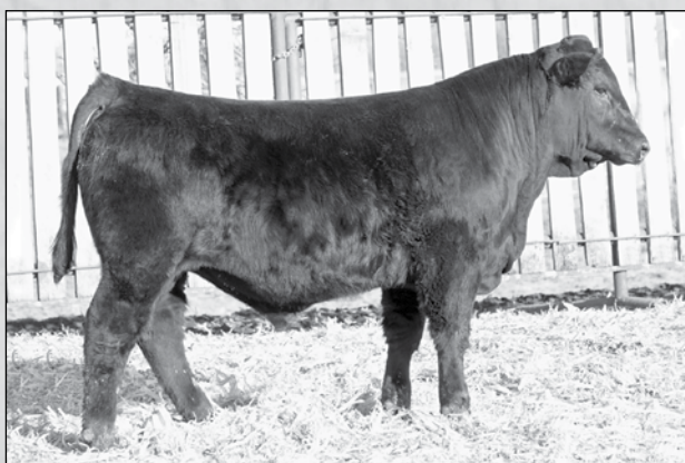
LRSF Long Haul C27 ET • Sells as Lot 32.