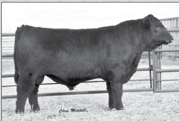
ZIMM Thunder C045 • Sells as Lot 24.