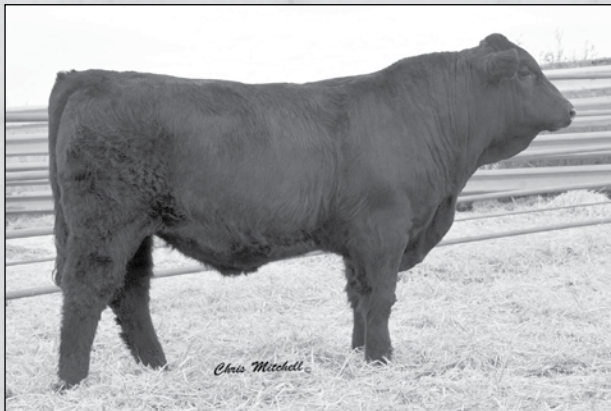
ZIMM Raven C205 • Sells as Lot 23.