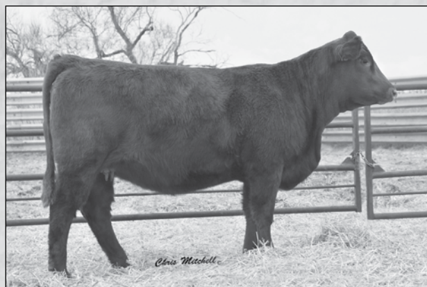
DDGR 182B • Sells as Lot 10.

This high performance, cherry red purebred has a Granite 200P2 dam whose lifetime nursing ratio is 112! She should do a great job with her Connealy Right Answer bull calf that is due on March 8.