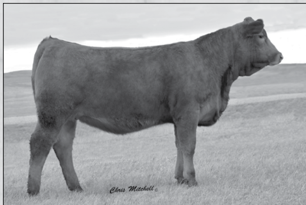
DCHD Golden Buckle Gelv 180C • Sells as Lot 15.