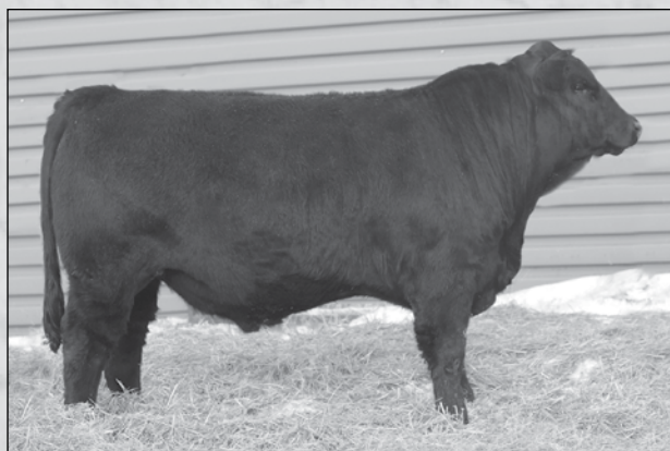
DAHL DAHL C2 • Sells as Lot 30.