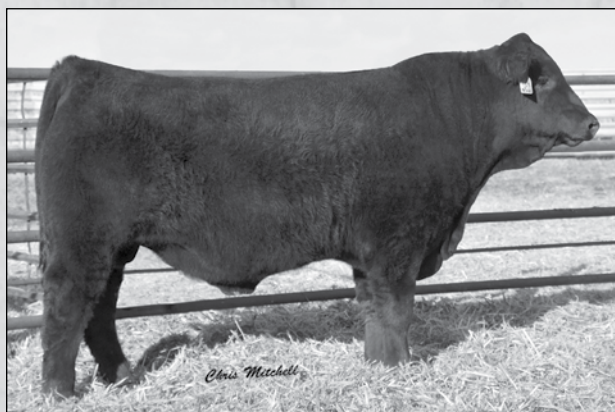
WOHL Caliber C36 • Sells as Lot 39.

Wide bodied, moderate frame, docile with balancer appeal in a Purebred. Sire had 15 inch ribeye and high IMF. Dam is sired by PB futurity champion Big Dog. He should sire calves that fit the market place. Retaining 1/3 semen interest.