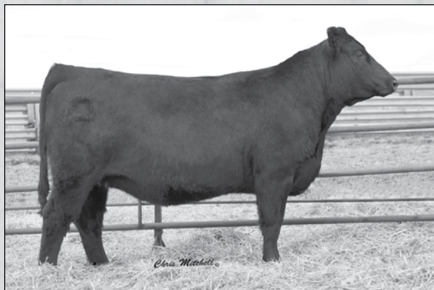
DCH Hille B160 • Sells as Lot 7.