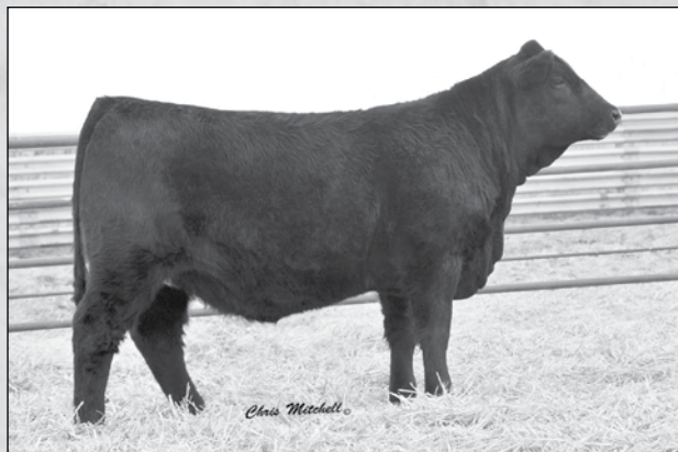
DCH Hille Cali C170 • Sells as Lot 13.