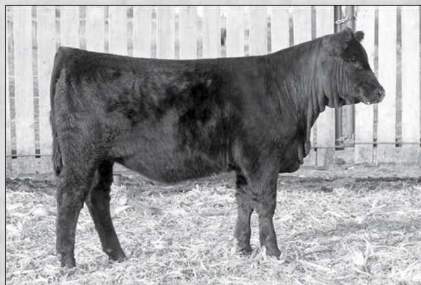
LRSF Rylee C55 ET • Sells as Lot 12.

Here is a full sister to our bull consignment and she is every bit as good as her brother. She's long fronted, smooth shouldered, deep sided and has terrific muscle expression. She may be one of the best heifers we have let off the place; and she doesn't get this title just based on her phenotype. Her mother is hands down one of the most eye appealing and productive cows we've ever owned. Rylee C55 ET should become a centerpiece in her new owner's herd.