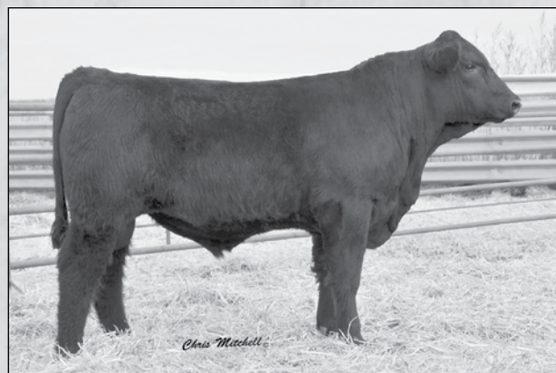
ZIMM Chip C209 • Sells as Lot 27.

The Wohl Otto X7 sire delivered another consistent calf crop and combined with SAV Final Answer generated this quality bull that is in the top 5% for TM, top 10 % for WW, & CW, and Top 15% for YW.