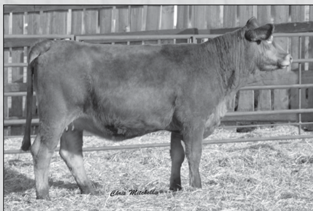
CMK Sunshine • Sells as Lot 8.