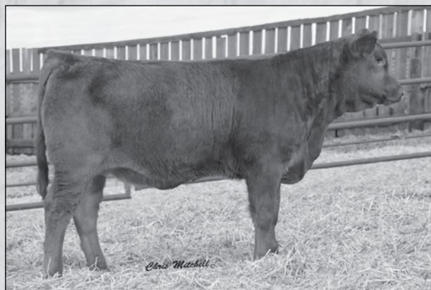
SGAR Miss Schock 506 • Sells as Lot 19.

This super red heifer puts it all together – capacity, style and length that will make her a top producing female in anyone's herd! She comes from a moderate framed Astro female and has been a stand out since birth.