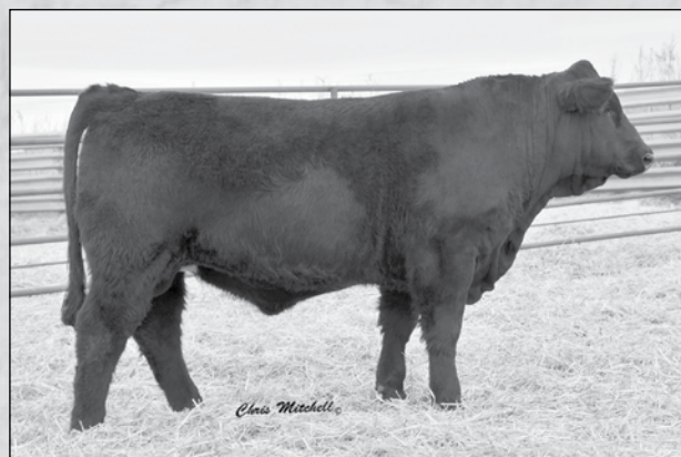
ZIMM Slate C178 • Sells as Lot 26.

Thick, wide topped with extra muscle. Dam is an outstanding SAV 8180 Traveler 004 daughter that has a perfect udder which she has passed down to her two daughters that we have retained.