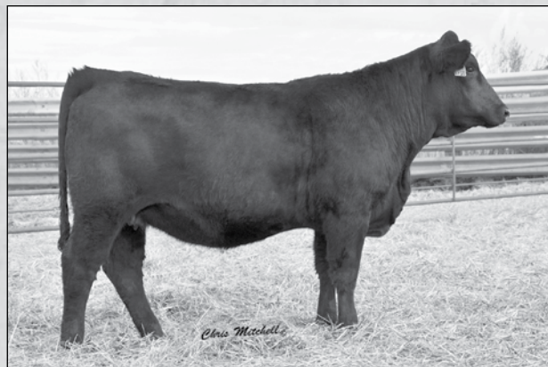
DCH Hille B248 • Sells as Lot 9.

B248 always catches your eye in the pasture. A stylish and well balanced female backed with a solid set of EPD's. Pure Power, Kodiak, and Atlas put a solid foundation under her pedigree. I'm excited for her calf out of the Leverage bull that was only offered for semen sales at the 2015 National Gelbvieh Sale in Denver. Ultrasound confirmed she is AI bred to CCRO CAROLINA LEVERAGE 3214A(1281559) with a heifer calf due Mar 2.