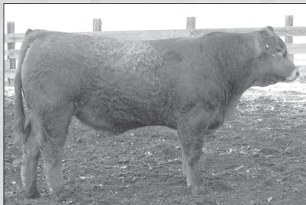
FGC C38 • Sells as Lot 41.

Performance bull that weaned at 808 with a weaning ratio of 124. C38 is a son of a D Bar D bull we purchased to use here in our program. Excellent performance cattle with strong maternal, moderate calving and high yield grade.