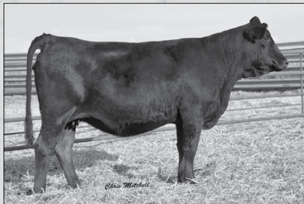
CMK Belterra • Sells as Lot 3.

AI bred on 5-4 to SAV Mustang 9134 with reg 16397246. PE to CMK B57 from 5-20 to 8-15-15.