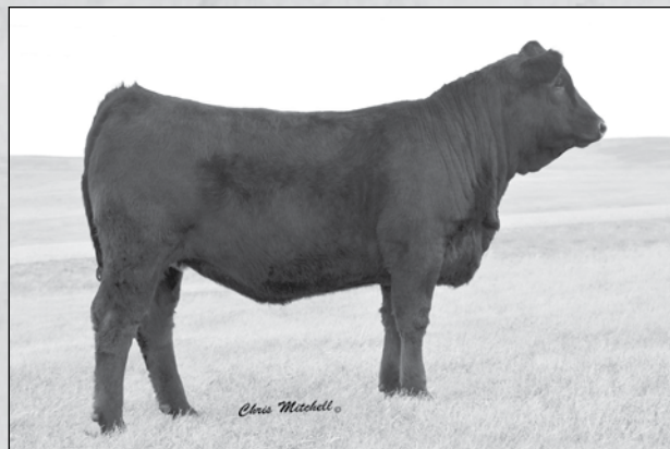
DCHD Golden Buckle Gelv 109C • Sells as Lot 17.

We are consigning DCHD 109C out of the top of our replacement pen. DCHD 109C is destined to be as powerful of producer as her mother, especially being sired by BDOC 205X who consistently adds depth and pounds to his offspring. 109C also has a maternal brother working as a junior herd sire for us. A complete package, buy with confidence that you will have a great, power cow in this heifer. DCHD 109C will be a tremendous addition to any herd. Sells open and ready to breed this spring.