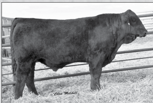
WOHL Winter C3 • Sells as Lot 40.

Power Bull. Extra length, growth and consistent cow family. C3 is in the top 3% for WW, YW, TM, YG and CW. Dam is full sister to Wohl X7 Otto bull which sired both the high selling PB and Balancer bulls in the 2014 sale.