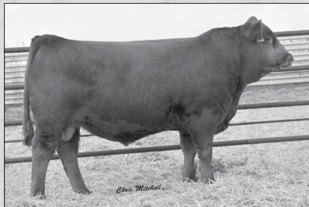
WOHL Pepper Impact C92 • Sells as Lot 35.

Deep bodied, dark red non-diluter and docile. Combines calving ease, muscle with a tremendous amount of capacity. Slight scurs on this well built PB.