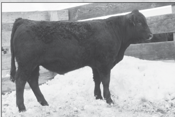
CJLL Collin • Sells as Lot 31.