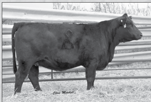
DDGR 17B • Sells as Lot 4.

This purebred Sam daughter has a super EPD profile including being in the top 1% of the breed for marbling and FPI! Our 2015 consignment was a Sam daughter that topped the sale last year. Shania's DLW Alumni daughter due on March 8 will have excellent EPD's as well and a great future.