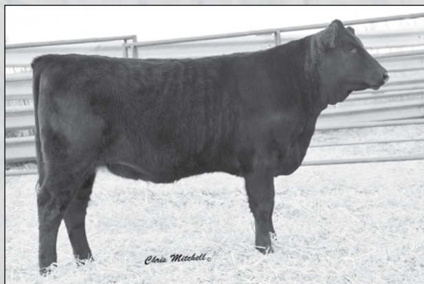
SGAR 507 • Sells as Lot 16.