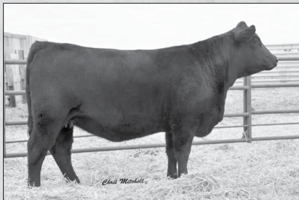
DDGR DDGR Sydnee 27B • Sells as Lot 5.

B59 combines a great cow family with great foundation Gelbvieh genetics for many generations in the pedigree. An excellent bred heifer that is the top red bred heifer in our program this year. The Red B59 is AI bred on 5-4 to Brown Coronado Z7266 (RAA1550543). PE to CMK B57 from 5-20 to 8-15-15.