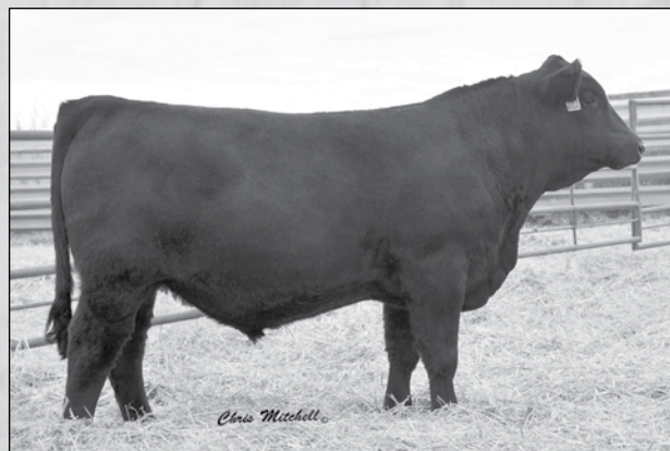
WOHL Impact C55 • Sells as Lot 36.

Stylish, deep ribbed, heifer bull. This smooth shouldered bull with calving ease on the dam and sire sides. Teats and udder quality reflected deep into his prominent prefixed pedigree.