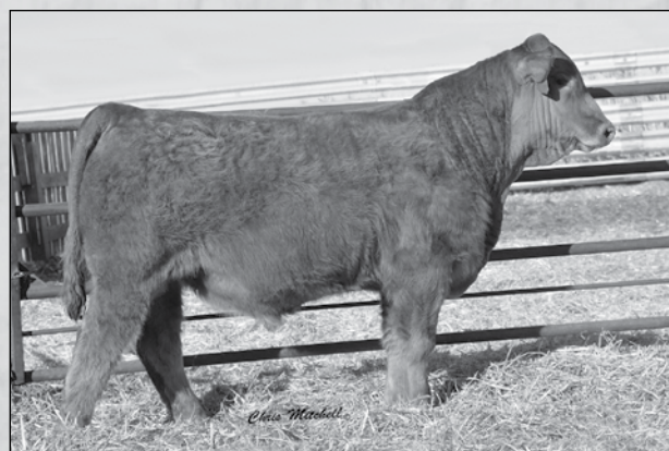
GFGR C502 • Sells as Lot 28.

A son of the carcass sire RID R Collateral. Collateral sons continue to produce high quality genetics that are very strong in maternal and carcass values for the Gelbvieh breed. C502 ranks in the top 20% for marbling.