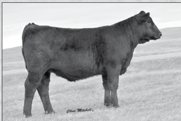
DCHD Golden Buckle Gelv 289C • Sells as Lot 14.