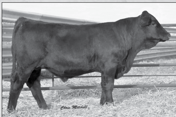
CMK C11 • Sells as Lot 29.