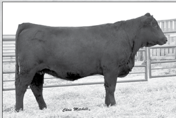
DCH Hille B118 • Sells as Lot 1.

A standout since she was a calf! Moderate birthweight and weaning weight ratio of 111. Performance plus with an excellent set of EPD's. She is in the top 1% of WW, YW, TM, and CW!!! Ultrasound confirmed she is AI bred to DCH Hille Wow W287(1120705), a breed trait leader in CE, BW, and CEM. Due Feb 27th with bull calf.