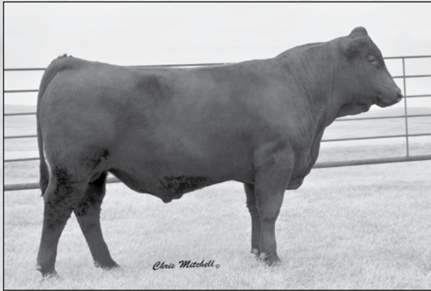
BDKR Foxy's Best • Sells as Lot 21.