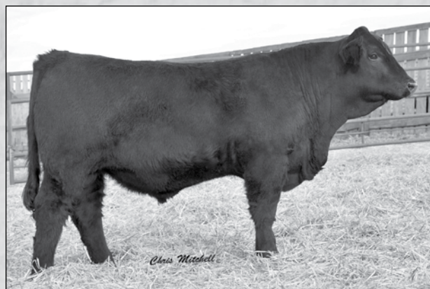
BDMP C99 • Sells as Lot 34.

Performance...Performance...Performance. Adjusted weaning weight of 926 with a weaning ratio of 111. Ranks in the top 3% for total maternal and yield grade, top 5% for milk, top 10% for yearling and top 15% for weaning, carcass weight and ribeye area.