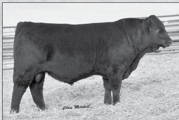
WOHL Winter C62 • Sells as Lot 42.

A bull to build a herd with. 20% of the females in our herd are from this cow family, having reliable low birthweights while excelling in growth. Sired by a bred leading carcass bull. Top 25% or better CED BW WW YW TM YG REA FPI