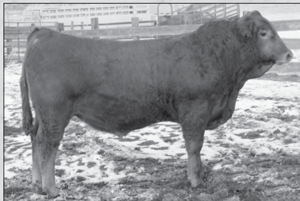
FGC C72 • Sells as Lot 43.

906 pound weaning weight with a weaning ratio of 125. Ranks in the top 4% for weaning and the top 1% for yield grade. A bull that will add pounds at weaning and produce outstanding replacement females.