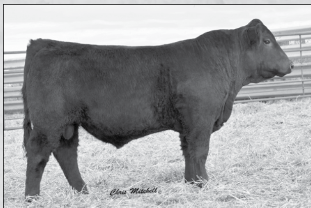
BDMP C102 • Sells as Lot 37.

Adjusted weaning weight of 859 with a 103 ratio. Ranks top 2% for total maternal, top 3% for yield grade, top 10% for weaning, yearling, milk and carcass weight.