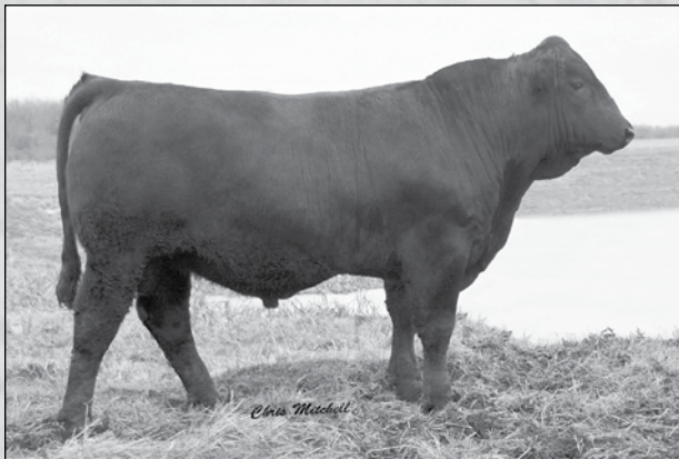
DGSC 8C • Sells as Lot 22.