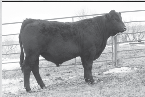
CJLL Cooper • Sells as Lot 33.

Here is the top choice of our bulls sired by a son of JBOB 4665M. C1522 weaned with 861 adjusted weaning weight and a ratio of 114. The cow family stems from a Top Brass/Polled Gizmo daughter we purchased from Post Rock Cattle Co that gives you strong growth, eye appeal and maternal traits