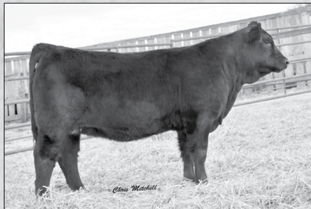
SGAR 535C • Sells as Lot 18.

She comes out of a moderate 4 yr old cow that is doing a great job. 535 is a deep bodied, long sided heifer. Her clean stylish front, and small smooth polled head adds to her eye appeal. I believe this female will compliment any herd she is put in but on sale day let your eyes be the judge. This heifer speaks for herself