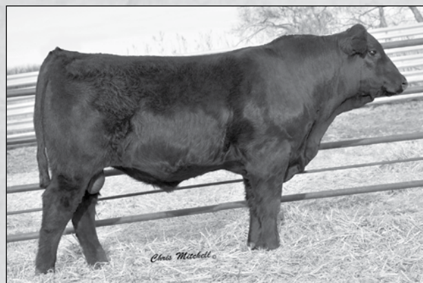
ZIMM Sid C343 • Sells as Lot 25.

Out of a first calf heifer that has depth of body, extra length & very docile. Homo Black and Homo Polled. With Wohl Everett Y24 and Sitz Upward 307R in his pedigree he should make some outstanding calves.