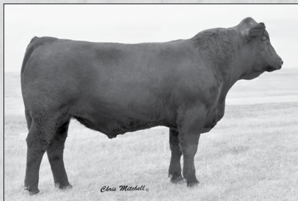
BDKR Buffy's Bear • Sells as Lot 20.

A performance bred fall age bull that is backed by cow power with grandams that ranked number 1 and number 3 in their contemporary group of 62 head. He ranks in the top top 1% for WW and TM, top 2% for YW and REA.