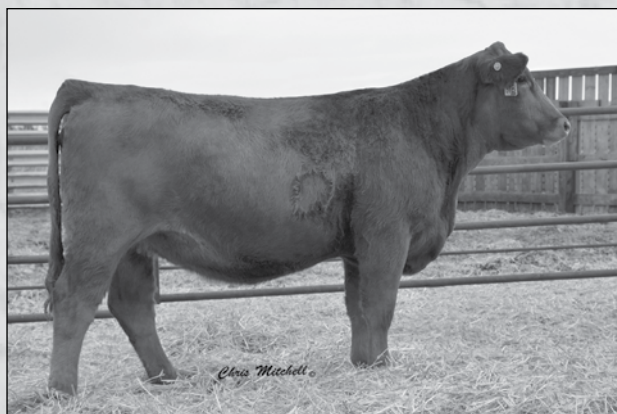
DDGR 31B • Sells as Lot 6.