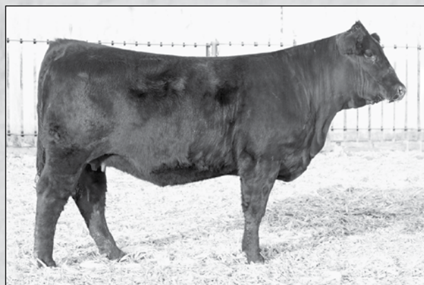
LRSF Snazzy B26 ET • Sells as Lot 2.

Snazzy B26 ET is a direct daughter of our highly productive Snazzy 114L cow. There are 12 females in our herd calving this spring that trace back to the 114L cow. We place a lot of emphasis on breeding highly productive cows and that's exactly what the Snazzy line of cows has been for us. Snazzy B26 ET will continue the line of terrific Snazzy cows for her new owner. She has tremendous muscle expression, great bone and is setting down a very desirable udder. She sells safe to Connealy Courage (AMAN17302304), carrying a bull calf due 2/23/2016.