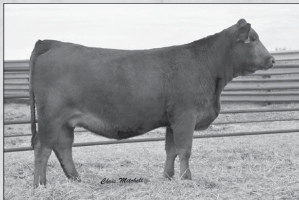
DCH Hille B317 • Sells as Lot 11.

A powerful female! She is a thick made heifer with extreme depth and muscling, but still keeps her feminine look with a smooth head, neck and shoulders. She is an absolute dream to look at! Ultrasound confirmed she is AI bred to DCH Hille Red Dirt Road B166(1295671), high selling red bull in our 2015 bull sale, with a heifer calf due Mar 9. As always Chimney Butte guarantees service sire and fetal sex on all Golden Rule offerings.