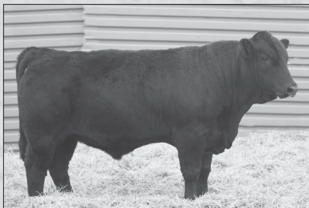
DAHL DAHL C3 • Sells as Lot 38.

DAHL C3 comes from one of our best cow families. His dam DAHL 102A did an amazing job raising here first calf! DAHL C3 has an 81 lb birth weight with an impressive 823 lb weaning weight. CMR Ruger 38z sired steers all grading CAB with one grading prime, the mothers of these steers were all purebred gelbvieh heifers. DAHL C3 is top 2% for milk and 30% marbling and top 10% for birth weight.