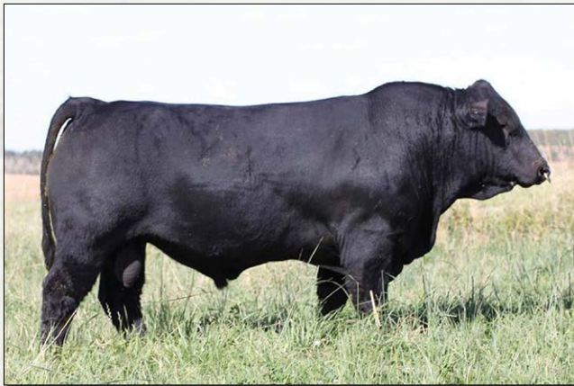
RWG Intense 2501 || Sire of Lots 30-32.