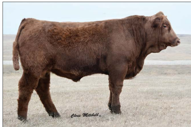
DCHD Golden Buckle Gelv 266C || Sells as Lot 36.

A dark red bull out of a dynamic Tremor daughter who has done a great job with all her calves. This calf has caught eyes all summer and is typical of the 81NY calves, exhibiting the same square made hip and correct structure.