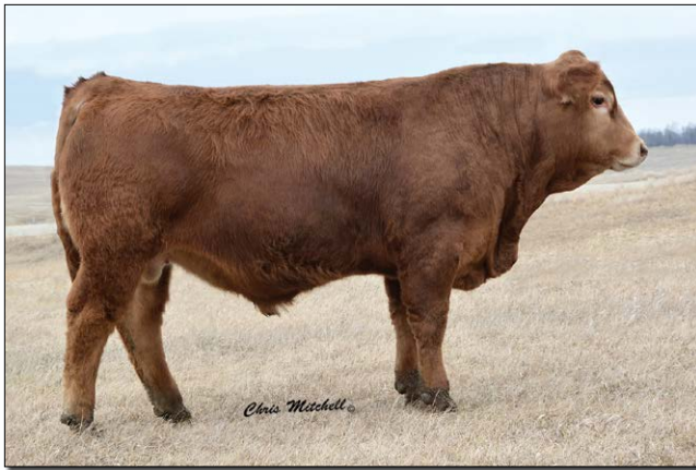
DCHD Cheyenne's Guy 049C || Sells as Lot 18.