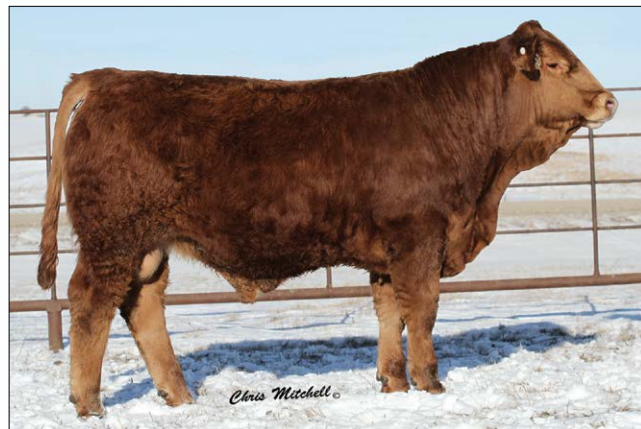
DCHD Golden Buckle Gelv 726Z || Sire of Lots 35, 47, 48.

This young BDOC 205X daughter did a great job on her first calf. She is a thick made heifer with lots of width from behind. Dam ratio of 105 on weaning. This heifer has calving ease, maternal and growth all in one package.