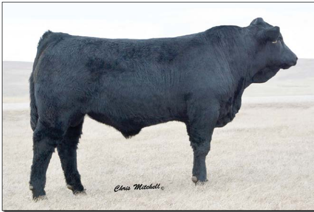
DCHD Golden Buckle Gelv 070C || Sells as Lot 30.