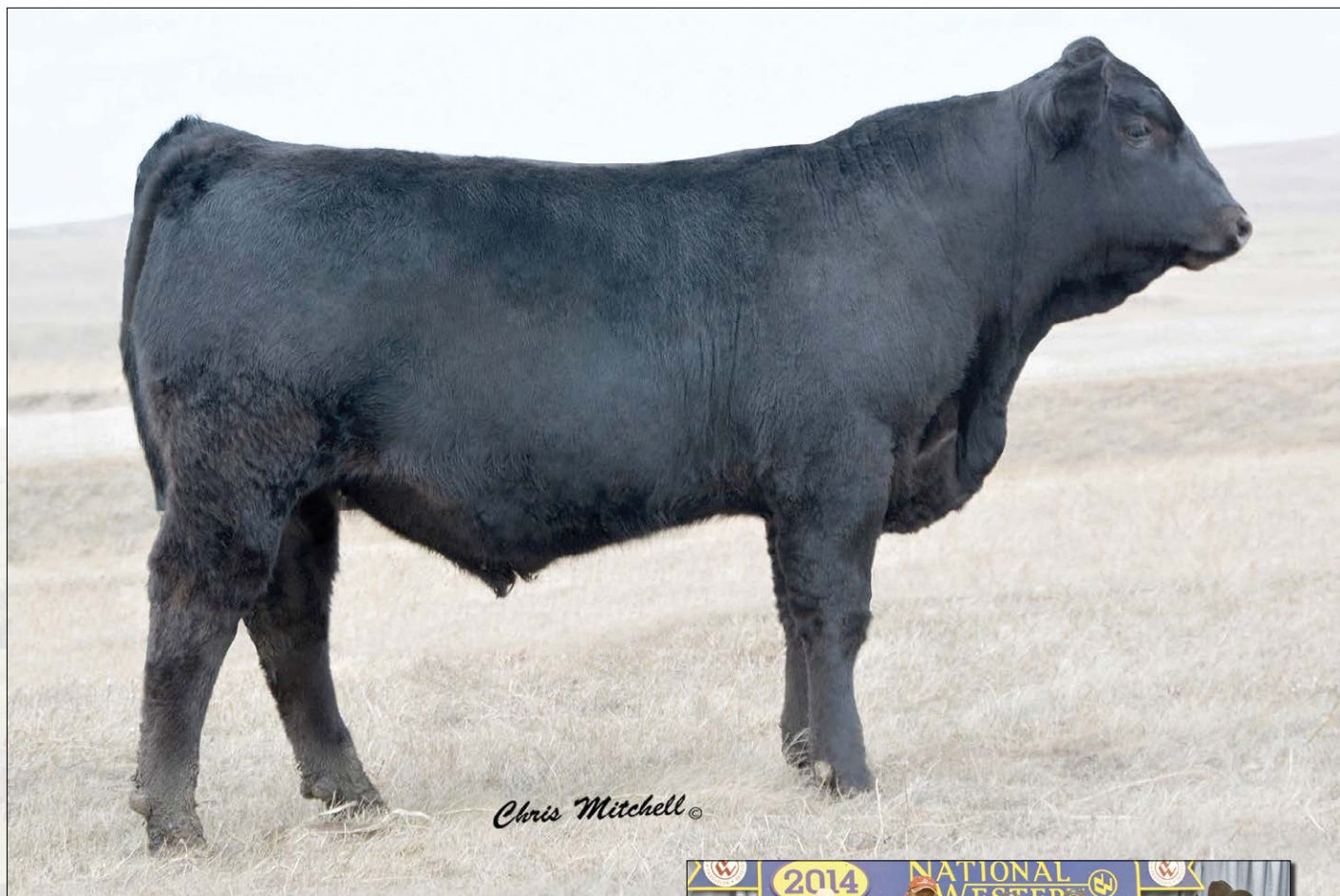
DCHD Golden Buckle Gelv 171C ET || Sells as Lot 23.