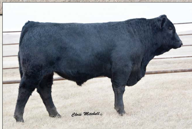
DCHD Golden Buckle Gelv 081C || Sells as Lot 29.