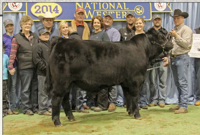
DLW Alumni 7513A ET || Sire of Lots 23, 24.