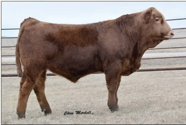
DCHD Golden Buckle Gelv 001C || Sells as Lot 19.

Smaller framed, thick topped, very stout made Windman bull who will add pounds to his calves.