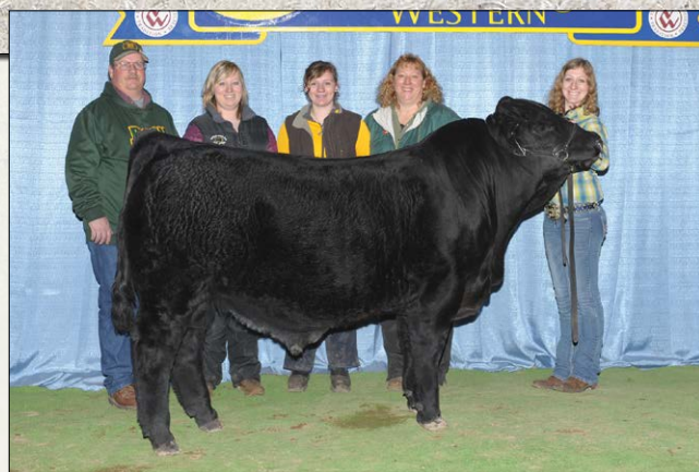
DCHD GBG Crown Royal 117C || Sells as Lot 1.