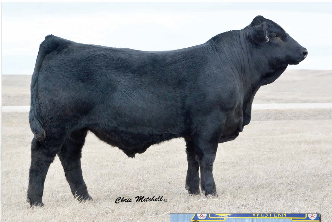
DCHD GBG Crown Royal 117C || Sells as Lot 1.