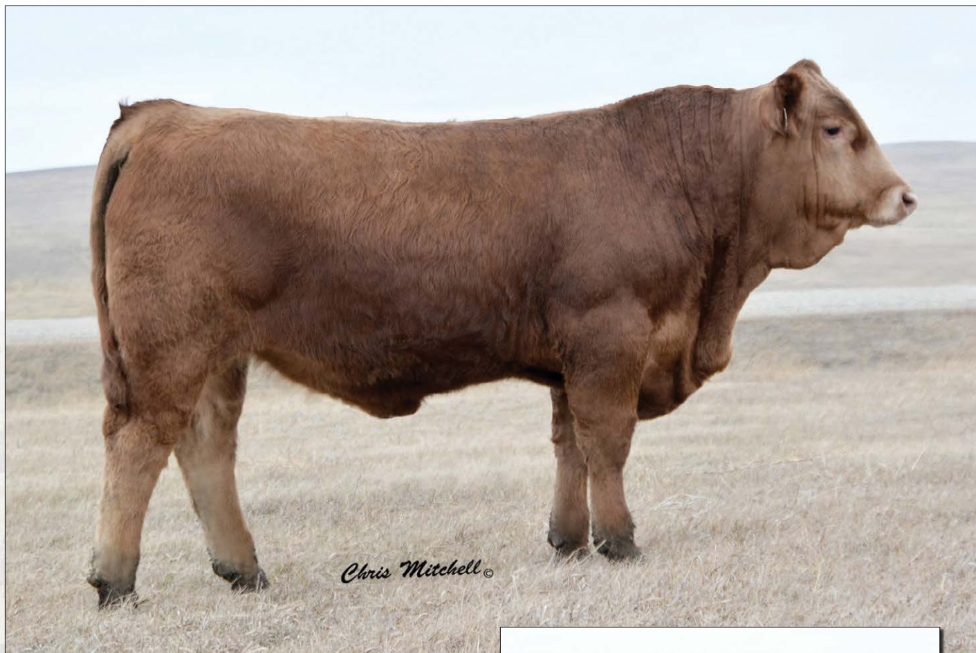
DCHD Golden Buckle Gelv 165C || Sells as Lot 28.