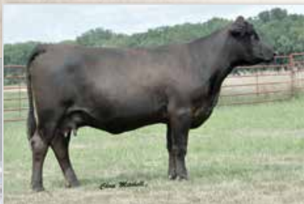
DLW MS X514 4610B • SELLS AS LOT 47.