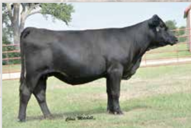
DLW TPG MS MATRON 4631B ET • SELLS AS LOT 8.