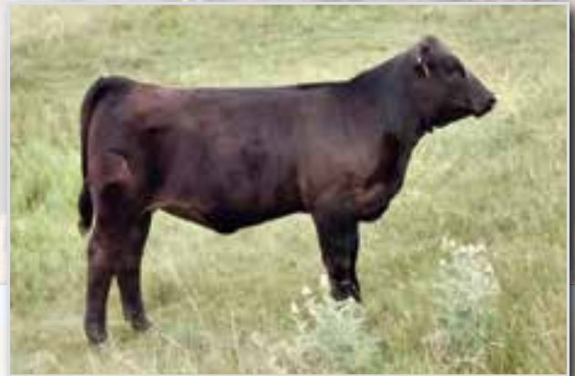
BMCE MAC WHITNEY 698D • SELLS AS LOT 49.

This heifer is an eye catcher. I think she can go anywhere and excel. She is the front pasture kind that could easily make some heads turn in the show ring. Sells open.