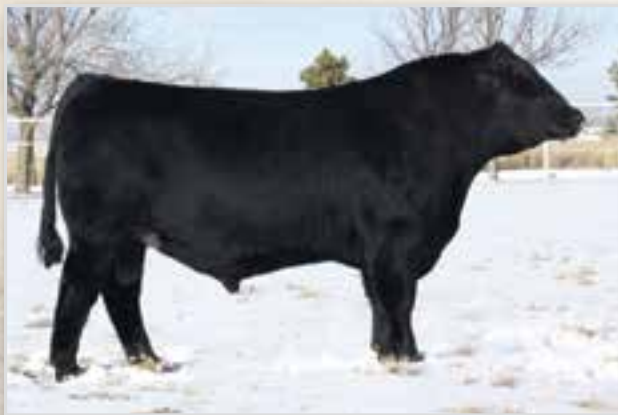
VRT LAZY TV WATCHMAN W021 • SIRE OF LOTS 44-46.