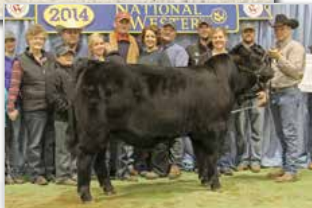
DLW ALUMNI • 2014 BREEDER'S CHOICE GELBVIEH BULL FUTURITY CHAMPION.