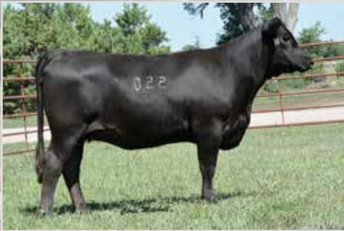
DLW TPG MS DESTINY 550C ET • SELLS AS LOT 2.