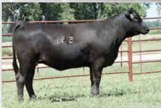
DLW MS JACKPOT ET • SELLS AS LOT 7.

Homo black and homo polled purebred heifer calf that has the look and cow power to be an excellent donor once her show career is complete. Sells open.