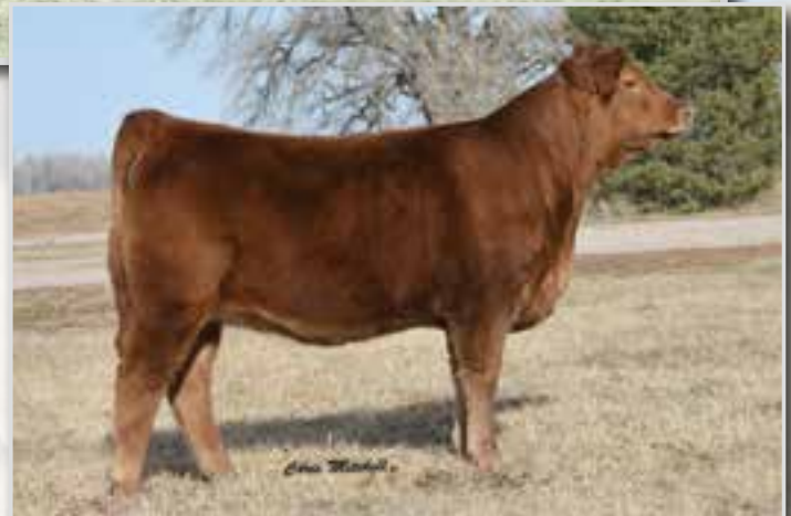
DLW 4505B • DAUGHTER OF LOT 6. RESERVE GRAND CHAMPION BALANCER FEMALE AT 2015 JUNIOR NATIONALS.