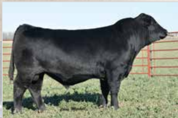
DLW TPG JACKPOT 7551B • FULL SISTERS SELL AS LOTS 7-10.