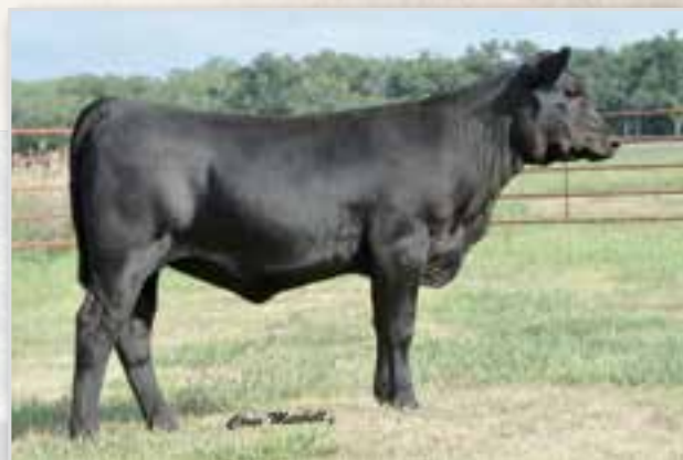
DLW MS POWER TOOL 604D ET • SELLS AS LOT 57.

High volume, angular female that is sure to be found. Top 10% CE, top 10% growth, top 1% carcass in a show heifer. Most didn't think that was possible but here she is in person, don't miss this one. Sells open.