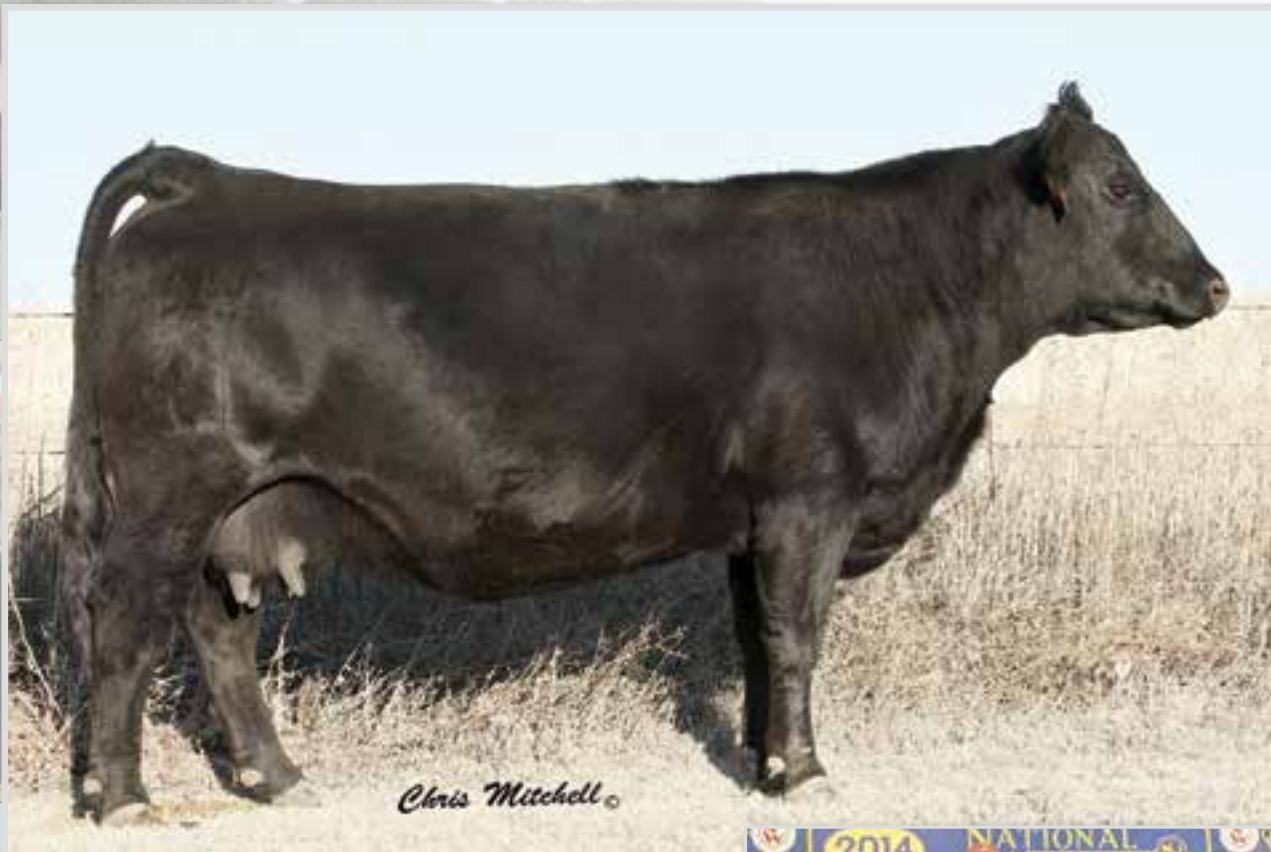
DLW MS MATRON 802U • DAM OF LOTS 7-13.