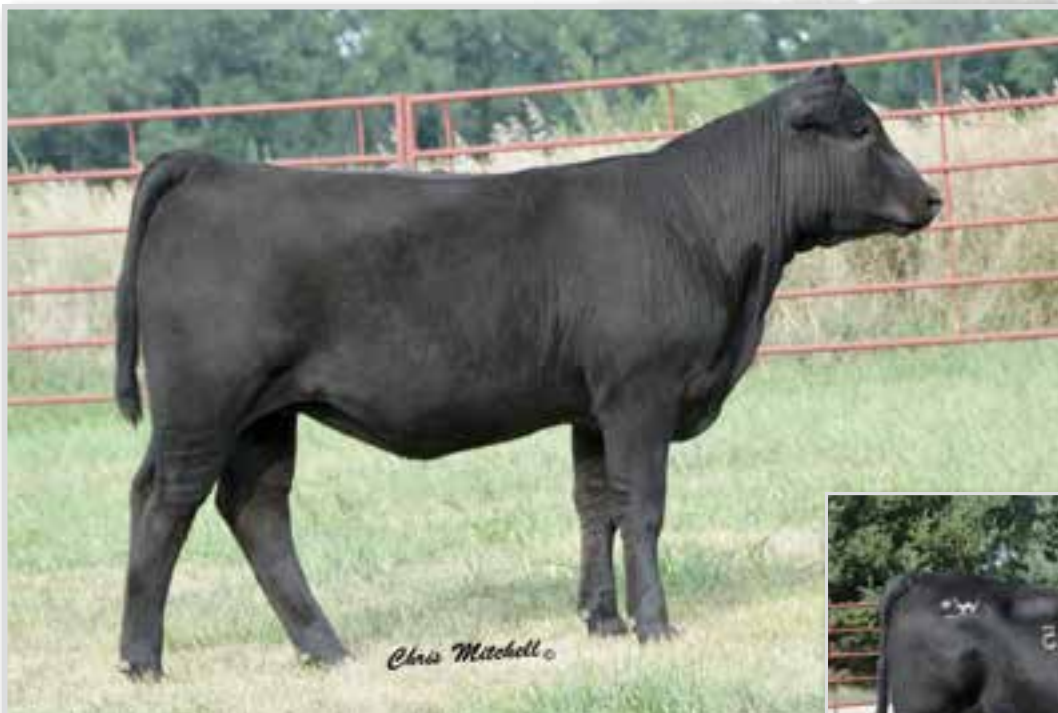
DLW MS AVALANCHE 600D • SELLS AS LOT 41.