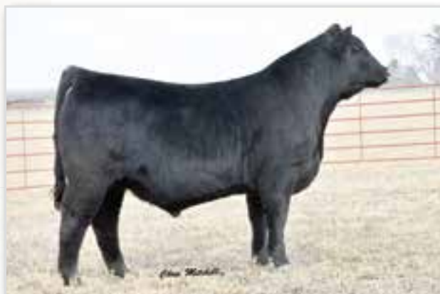
DLW SANDTRAP 928C • 2016 LEAD BULL IN NATIONAL GRAND CHAMPION PEN OF THREE. SISTER SELLS AS LOT 12.