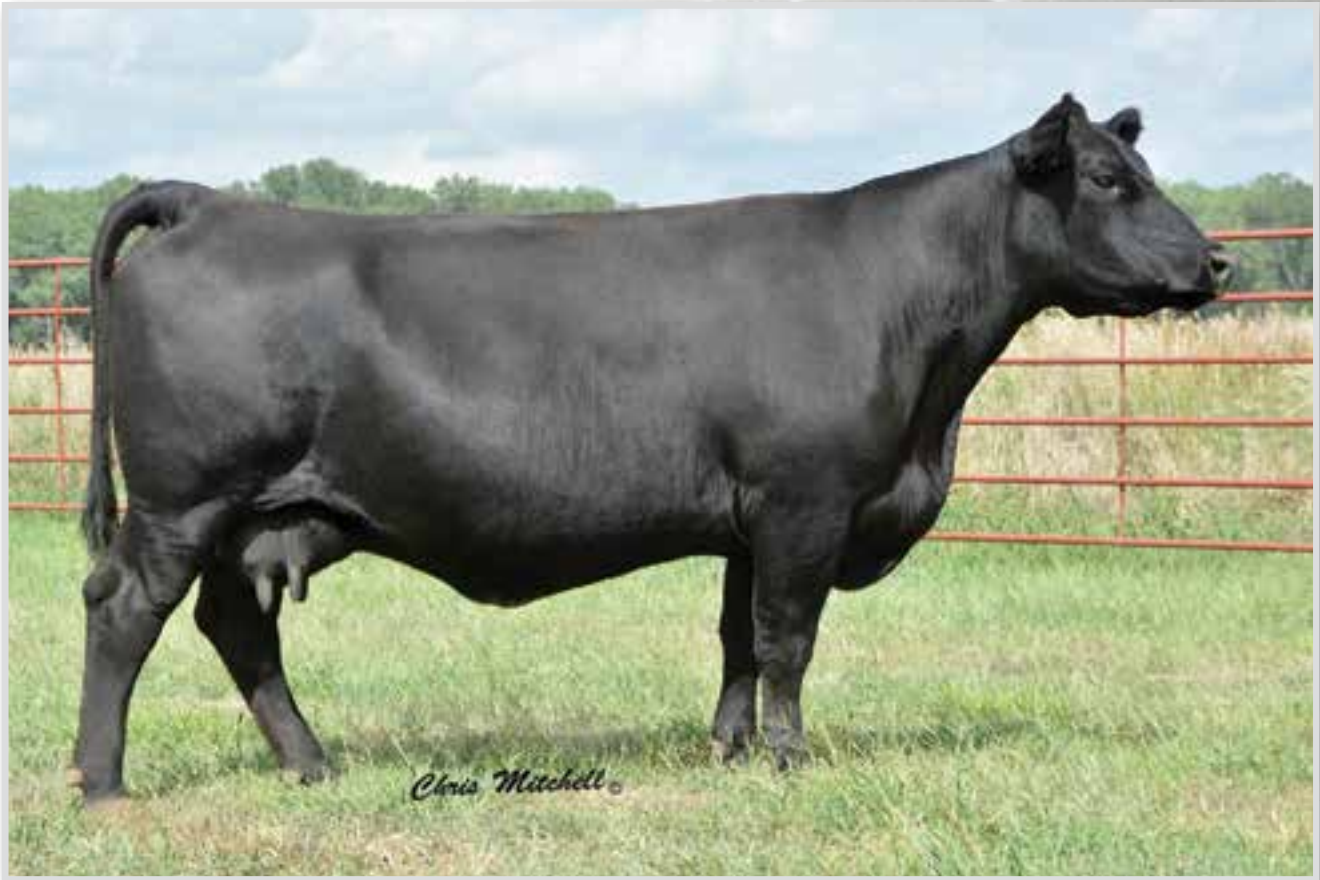
DLW MS GOOD NIGHT 021X • FLUSH SELLS AS LOT 14.