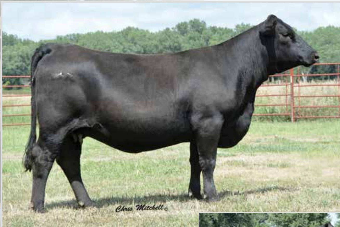
DLW TPG MS MATRON 4630B • SELLS AS LOT 12.