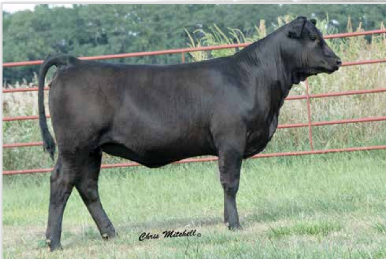
DLW MS TRACTION 605D ET • SELLS AS LOT 55.