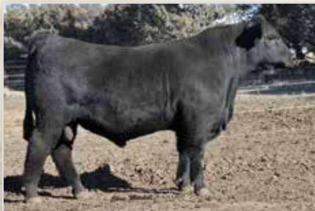
DLW WHITE SAND 0318A • SIRE OF LOTS 38-40.

One of the few fall heifer prospects to get your hands on. That is no typo she is an own daughter of the great 198L donor that is the dam of Wide Tracks and Sandman. Did you also notice this is a homo polled purebred female. Future donor cow. Sells open