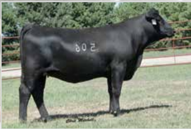
DLW TPG MS BELLE 506C ET • SELLS AS LOT 23.