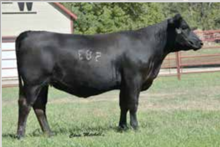
DLW MS POWER ET • SELLS AS LOT 3.