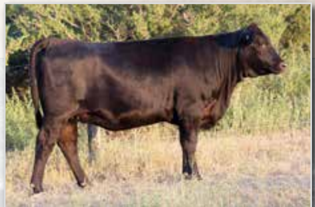
BMCE MAC PRAIRIE LADY 579C • SELLS AS LOT 51.

579C is a smooth shouldered, maternal looking female. She is out of a very good, deep ribbed, easy fleshing cow. AI sire Connealy Comrade 1385 (AAA 17031465) on 4/24/16. Pasture exposed 5/10 - 7/15 to MAC Cash Reserve 236B (AAA 18034919).