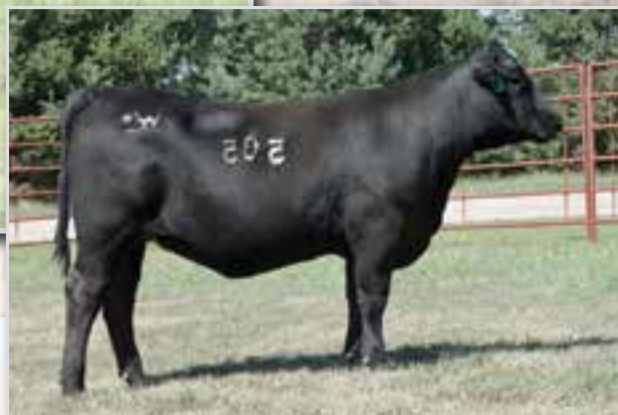
DLW MS AVALANCHE 505C • SELLS AS LOT 42.