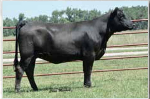
DLW MS ALUMNI • SELLS AS LOT 48.

One of the few Alumni daughters selling. Out of a tremendous Basin Angus cow that always pays her way. Pedigree and performance deluxe. Sells safe to AI breeding. Bred to Highly Focused due Jan 23, 2017