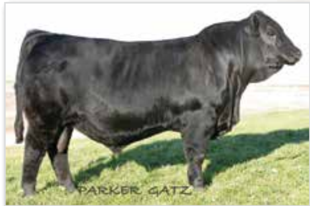
DLW EDISON 6718X • SIRE OF LOT 33.

One of the first Highly Focused daughters to sell. Low birth, high marbling female ready for any mating. Top 1% MB, top 10% CE and top 20% BW. Sells safe to AI breeding. Bred to CTR Good Night 715T, due Jan 20, 2017.