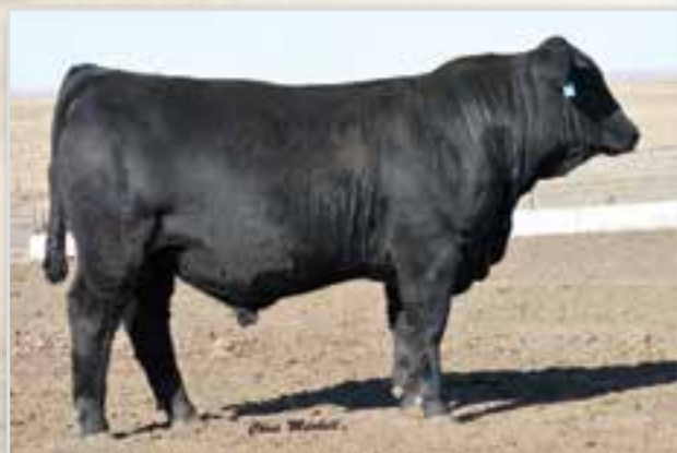
DLW NEW FRONTIER • 2014 WARNER BEEF GENETICS HIGH SELLING BULL.