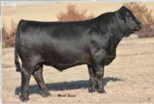
CTR WIDE TRACK 3706A ET • MATERNAL BROTHER TO LOTS 35, 36.