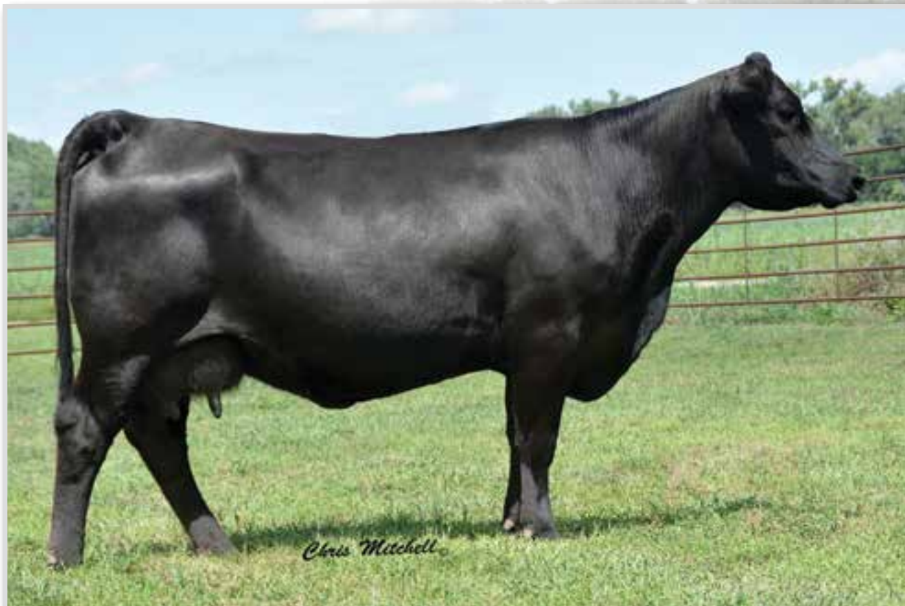
DLW MS VALUE ADDED ET • DAM OF LOTS 19-21.