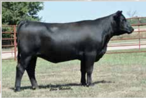
DLW MS WATCHMAN • SELLS AS LOT 44.