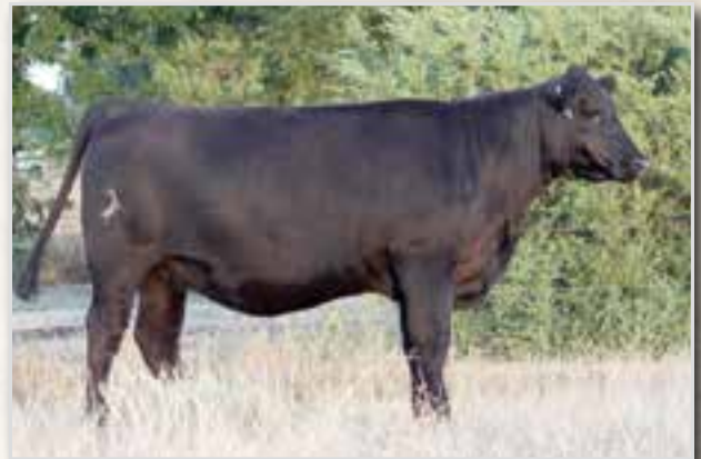
BMCE MAC MISS UPGRADE 511C • SELLS AS LOT 50.

511C is a complete female who was noticeable in the pasture from a young age. Her dam always has done a good job and looks the part all year long. Don't miss her carcass EPD's. Service sires are Balancer- DLW Edison 019B (AMGV 1289518) 5/30-7-17, and Angus- MAC Cash Reserve 268C (AAA 18378648). 5/10 - 5/30.