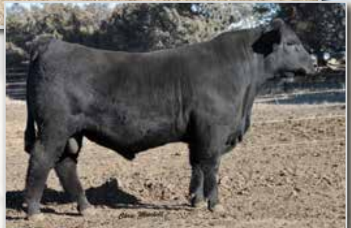
DLW WHITE SAND 0318A • DAM SELLS AS LOT 1.