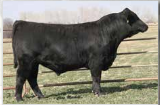
DCSF POST ROCK HIGHLY FOCUSED • SIRE OF LOTS 29-32.

Lot 29A HB DP 38% BA heifer BD: 8/7/2016 BW: 71 Sire: Basin Payweight 1682