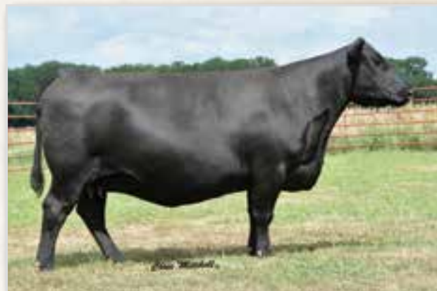
MAPLECREST RITA K0131 • DAM OF LOT 43.

Super fancy heifer calf out of the Avalanche sire owned with Cedar Top Ranch. Here is a March born female that will run with the competition in the show ring and excel as a cow prospect. Sells open.