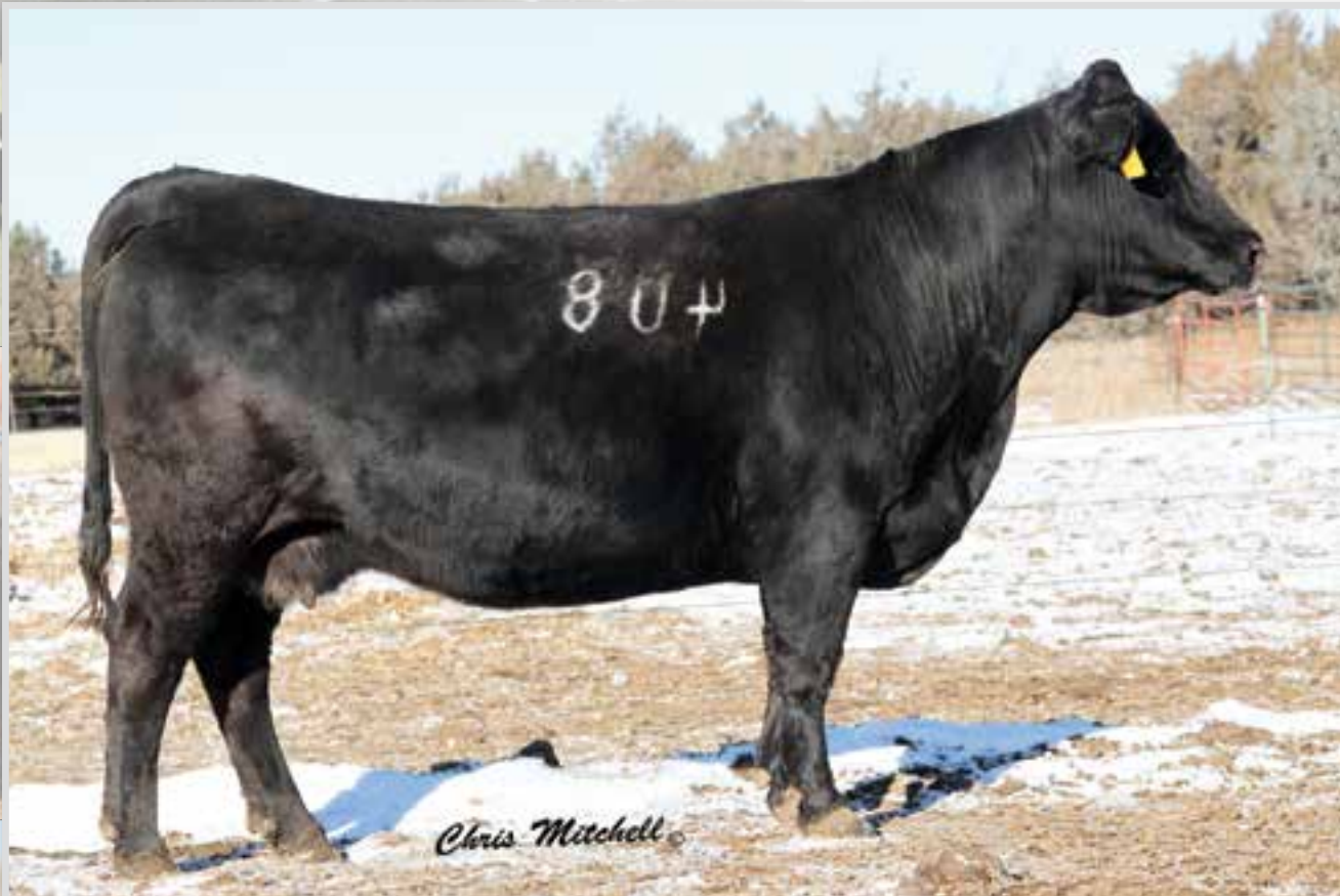
DLW MS KINGPIN 408P • FAMILY FOUNDATION FEMALE OF LOTS 15-22.