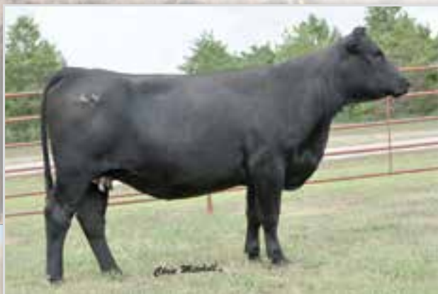
DLW MS WATCHMAN 4600B • SELLS AS LOT 45.