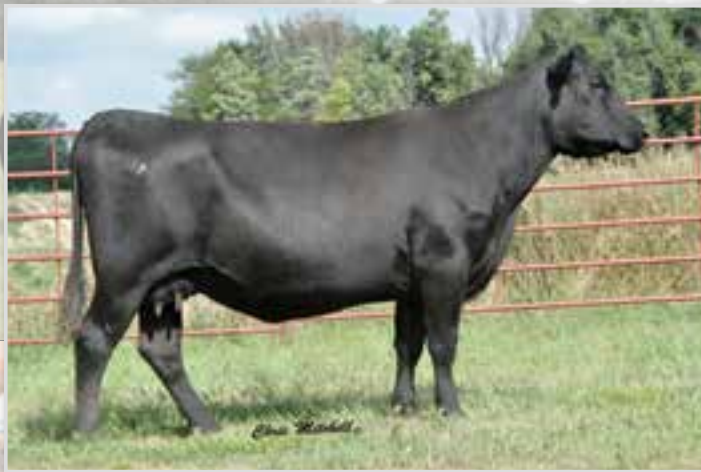
THOMAS MISS LIBERTY 2163 • SELLS AS LOT 58.