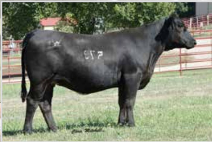
DLW MS POWER • SELLS AS LOT 52.