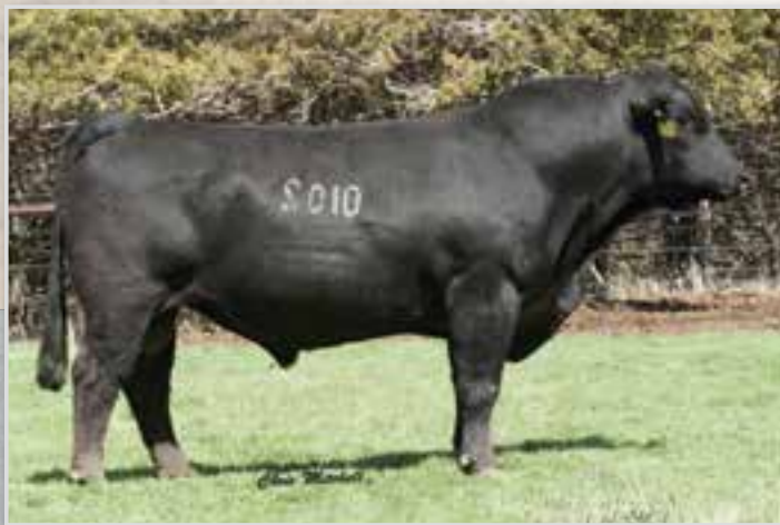
DCH HILLE X102 • SIRE OF LOT 54.

The only registered red bred heifer in the sale but a solid participant. Double bred Gravity will offer plenty of rib shape and fleshing ability. Sells bred to DLW Edison 234B due late March.