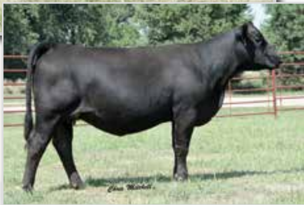
DLW TPG MS MATRON 4632B ET • SELLS AS LOT 13.