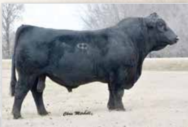
DCSF POST ROCK ASTRONAUT 157A • SIRE OF LOT 11.

Purebred daughter of the great 802U cow. Exceptional data, Superior cow family, Homo Black, Homo Polled, Purebred. Donor Potential. Sells safe to AI breeding. Bred DCSF Highly Focused due Jan 18, 2017.