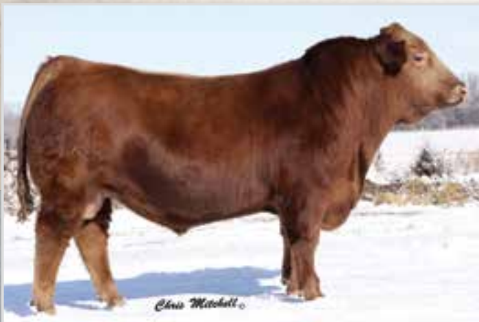
DLW RED POWER 583U • SIRE OF LOT 3.