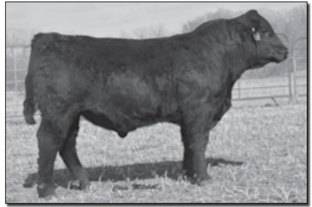
DMS STUCKYS KANZA • Sells as Lot 77.