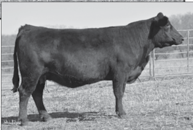
DCSF POST ROCK RHONDA 110W2 • Sells as Lot 123.