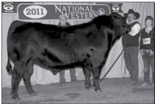
DCSF POST ROCK STAR POWER ET • Sire of Lots 166 and 167.