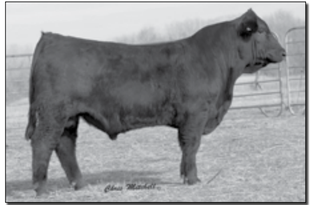
DCSF POST ROCK COLLATERAL2ET • Sire of Lots 171 and 172.

AI 11/29/14 to Sandpoint Butkus (AN16829413)