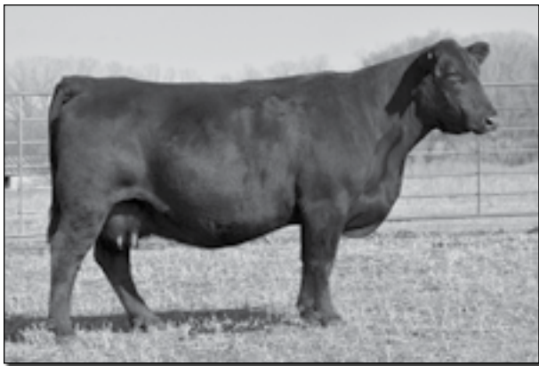
DCSF POSTROCK BLAQCKCAP 164W8 • Sells as Lot 146.