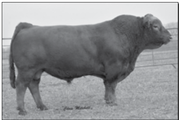
BEA PASSION 001X ET • Sire of Lots 176-178.