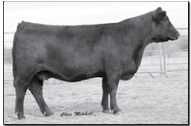
DCSF POST ROCK ARATA 80R2 - Dam of Lot 133.

Star daughter out of the 80R2 donor that's been one heck of a producer with almost unbelievable ratios of 101 BW and 114 WW. Check out her son by Shark who sells if you need proof of producing ability. She's the kind it hurts to sell, and she only sells because her age group time has come. Lot 133A Black Polled PB Bull calf BD:10/27/14 BW: 80 TT: 368B2 Sire: Silver 279Y1 (Shark)(1219935) PE 12/20/14 to 3/19/15 to Future Investment X037 (1172364)