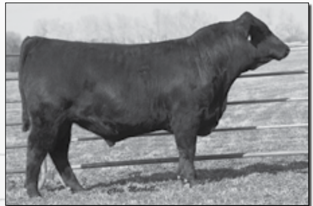
DCSF POST ROCK HIGHLY FOCUSED • Sire of Lots 84 and 85.