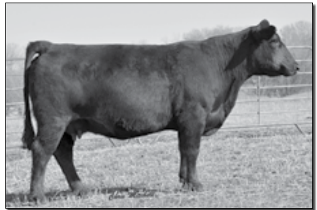
DCSF POST ROCK DIAMOND 25W2 • Sells as Lot 141.

PE 5/3/14 to 6/25/14 to Captain 042X (1167121) Due 3/1/15