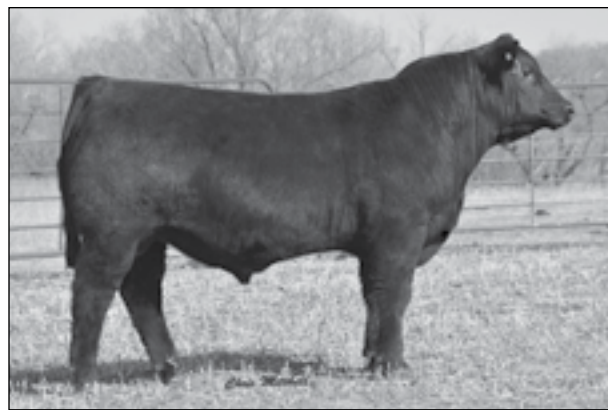
DCSF POST ROCK 231B8 ET • Sells as Lot 103.