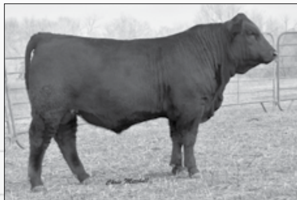
DCSF POST ROCK CAPTAIN 415A1 • Sells as Lot 26.