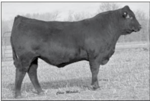
DCSF POST ROCK SHARK 120B2 • Sells as Lot 12.