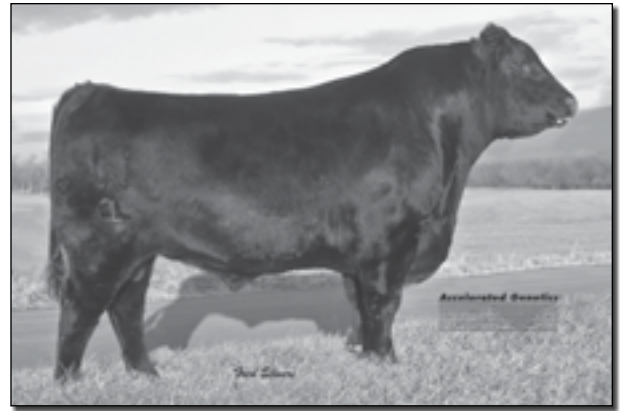
POSS TOTAL IMPACT 745 • Sire of Lot 82.