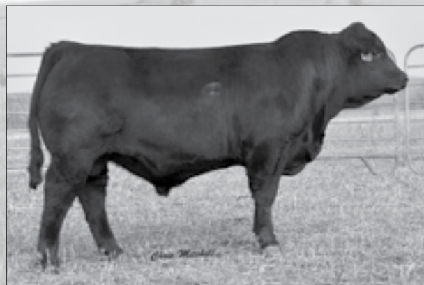
DCSF POST ROCK CAPTAIN 398A2 • Sells as Lot 27.