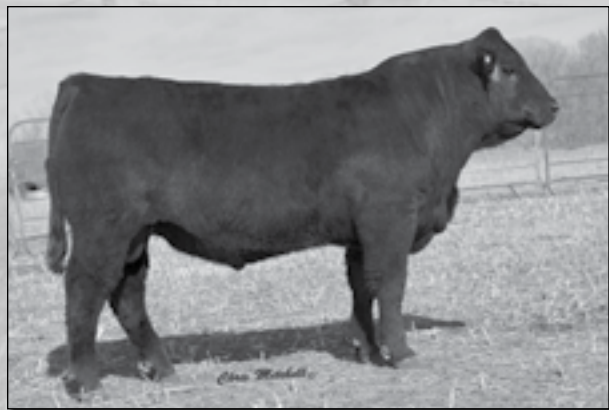
DCSF POST ROCK BLK BAL 43B8 • Sells as Lot 102.