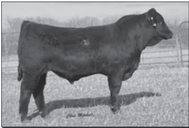
DCSF POST ROCK INVESTMENT 133B2 • Sells as Lot 10.