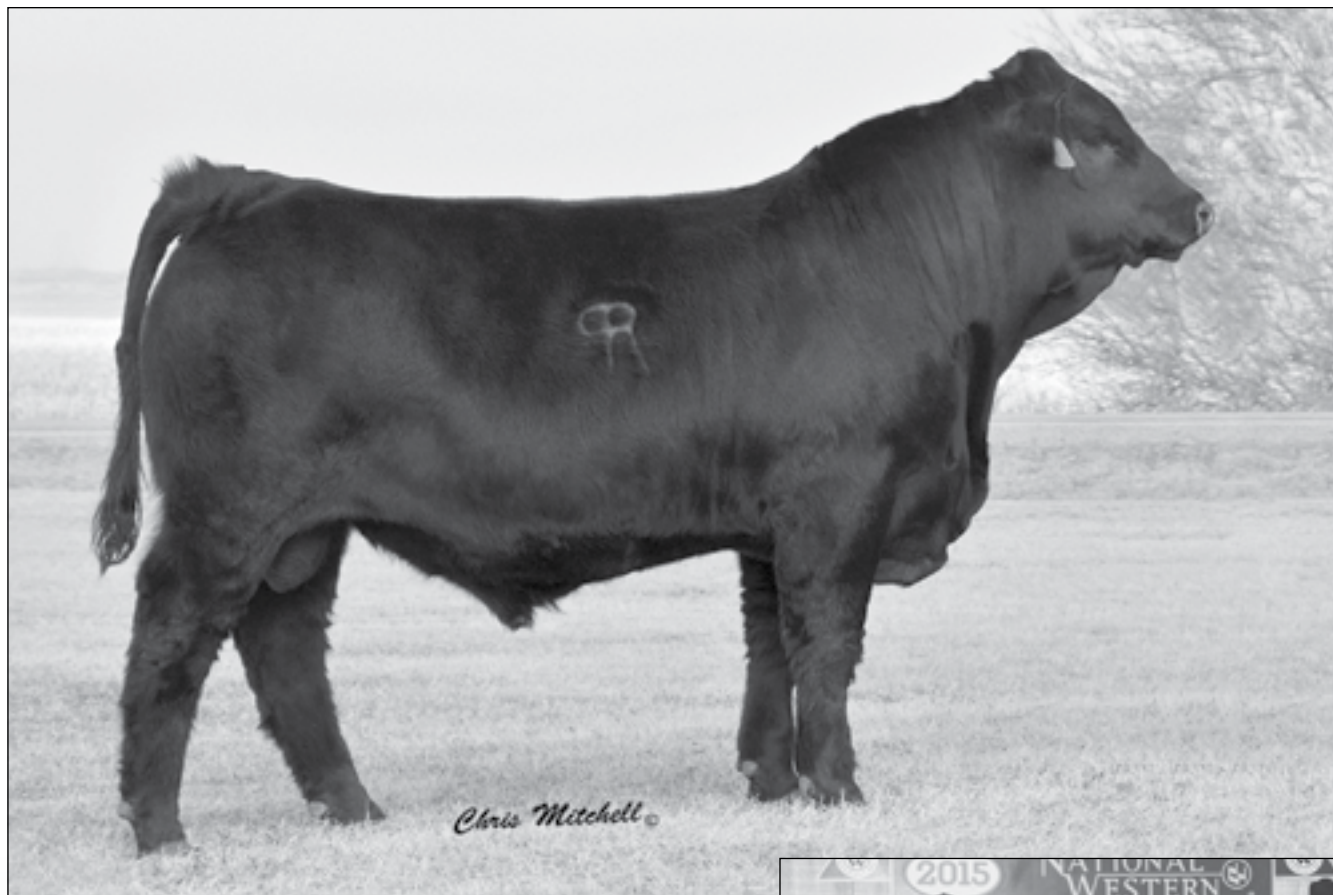
DCSF POST ROCK SUPER TRACK 76B1 ET • Sells as Lot 3.