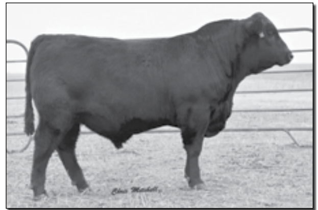
DCSF POST ROCK BLK BAL 370A8 • Sells as Lot 55.