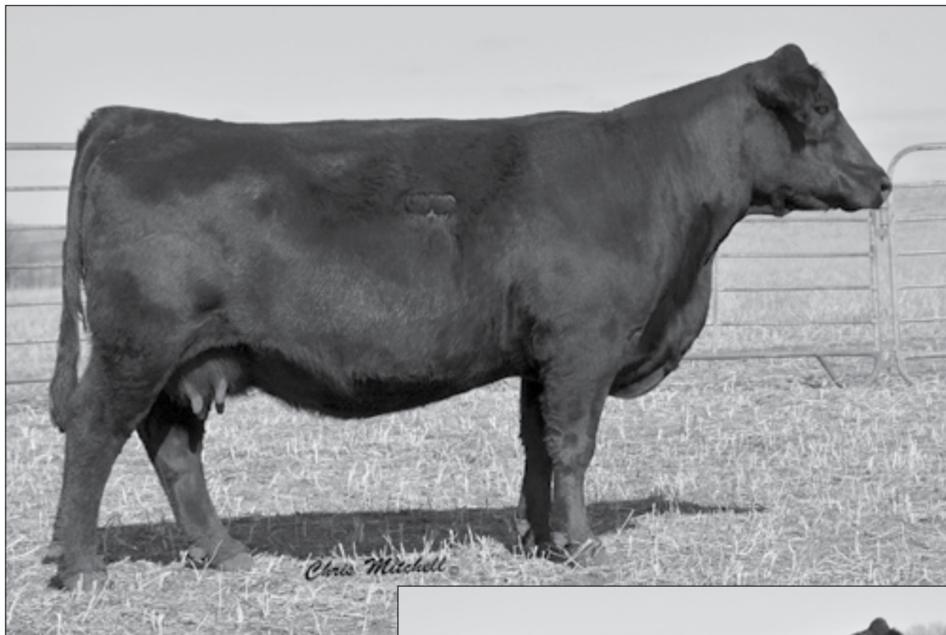
DCSF POST ROCK ROUTINE 158W2 • Sells as Lot 122.