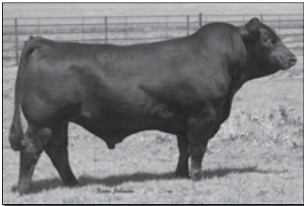
JKGF FUTURE INVESTMENT X037 • Sire of Lots 128 and 129.