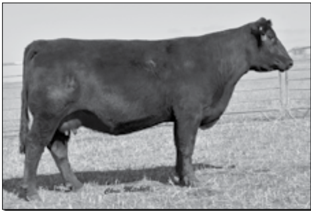
DCSF POST ROCK TWILA 248U2 ET • Sells as Lot 127.