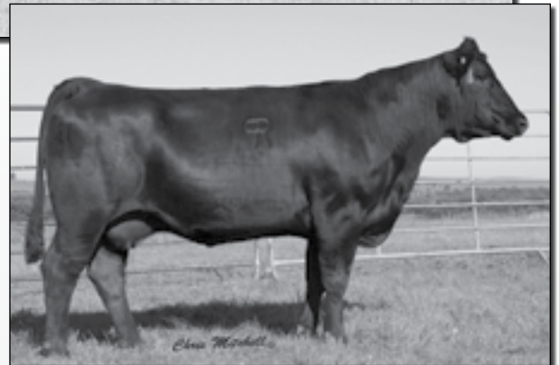
DCSF POST ROCK TWILA 223M2 • Dam of Lot 2.