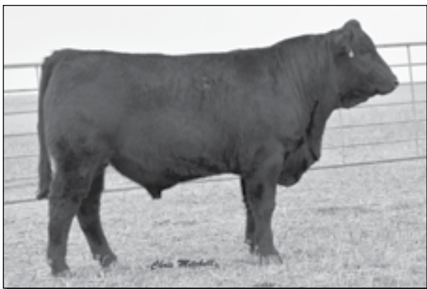
DCSF POST ROCK BLK BAL 381A8 • Sells as Lot 62.