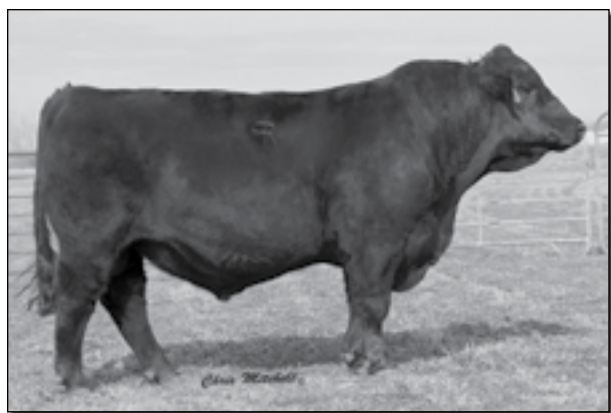
GBNR BAR NONE CAPTAIN 42XET • Sire of Lot 23, 26 and 27.