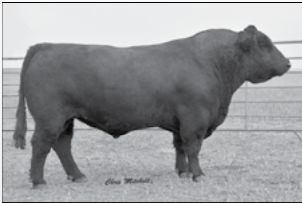
CTR CTR MOMMA MAKER 0056X • Sire of Lots 89-91.