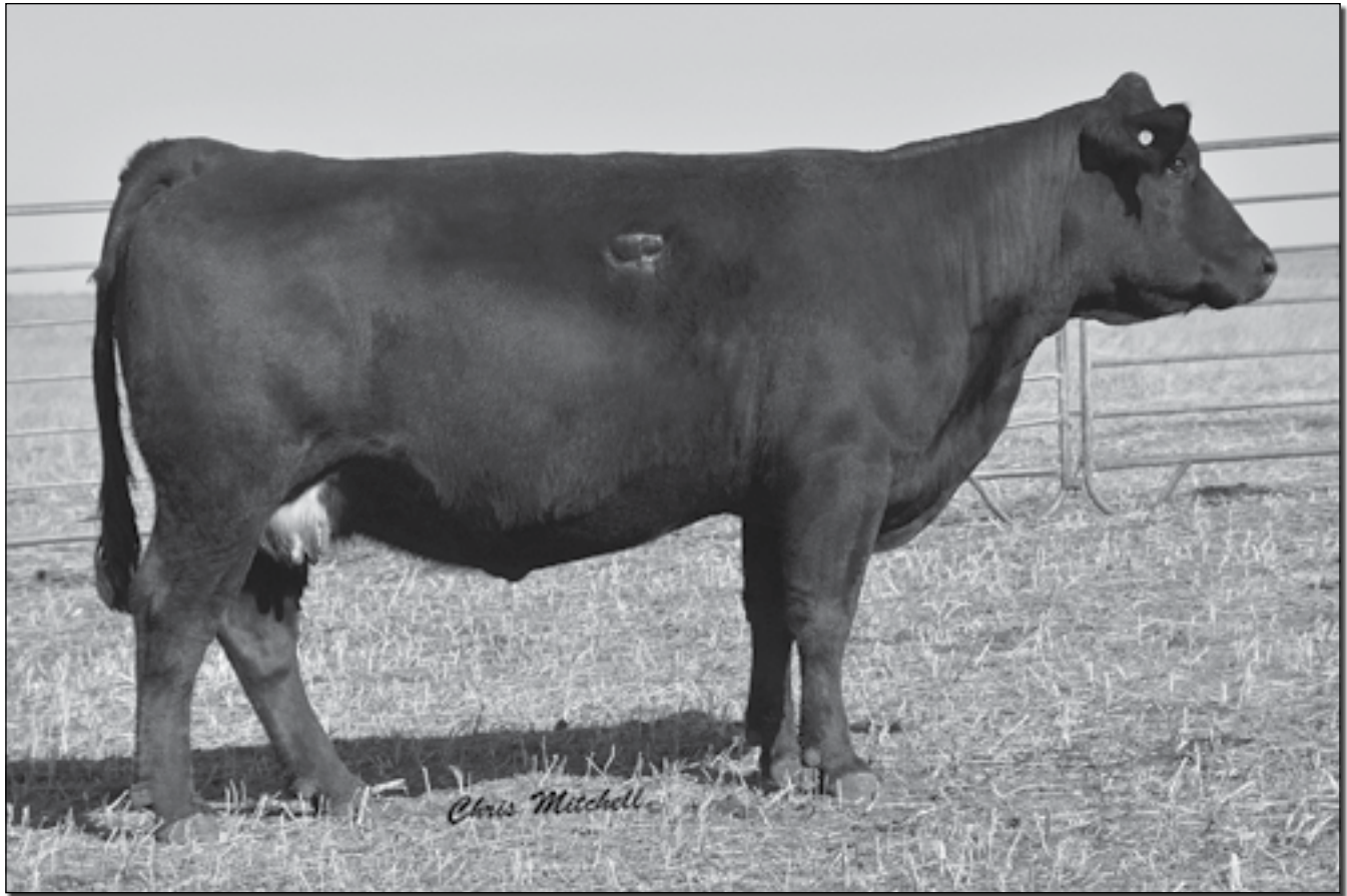
KACA POPST ROCK WILMA 129W1 • Sells as Lot 150.