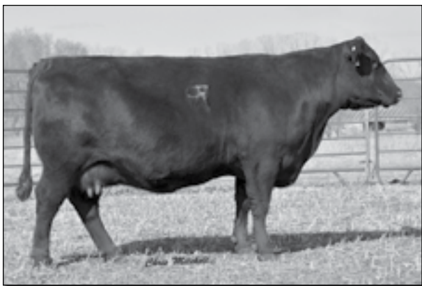
DCSF POST ROCK BLKBIRD 76W8 • Sells as Lot 147.

PE 12/20/14 to 3/19/14 to Future Investment (1172364)