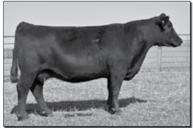
DCSF POST ROCK GRETA 271U2 • Sells as Lot 140.

PE 5/3/14 to 8/3/14 to Future Investment X037 (1172364) Due 3/15/15