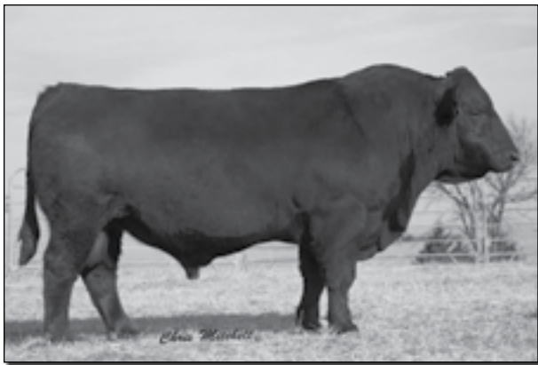
JRI GREAT WESTERN 254N68 ET • Sire of Lots 110, 120 and 121.