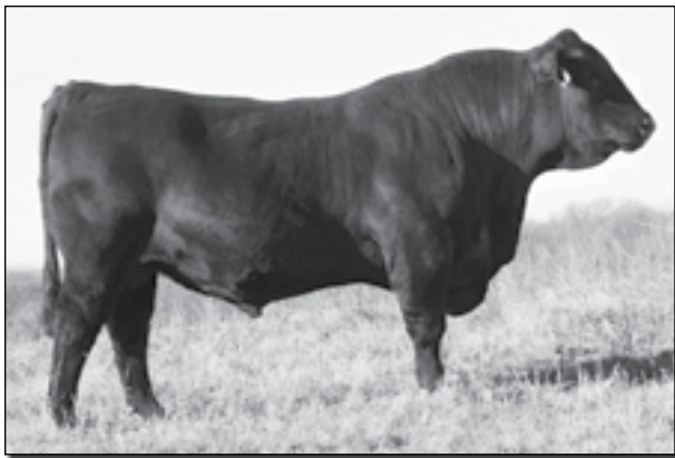
DMS STUCKYS TRUSTEE • Sire of Lots 96-98, 100 and 101.