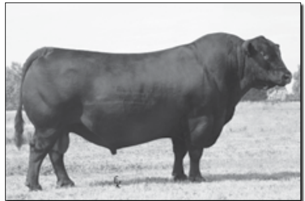
S A V FINAL ANSWER 0035 • Sire of Lot 83.