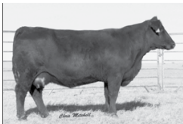
DCSF POST ROCK WILMA 262P1 ET • Dam of Lot 25.