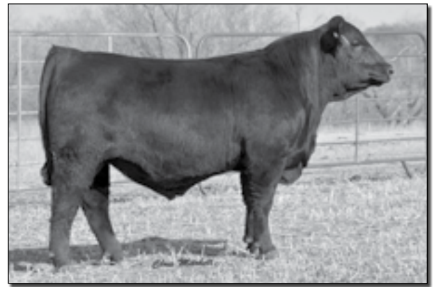
DCSF POST ROCK BLK BAL 40B8 • Sells as Lot 66.