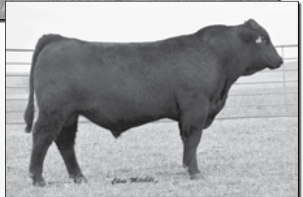
TOG TWIN OAK PIONEER 380A ET • Sells as Lot 45.