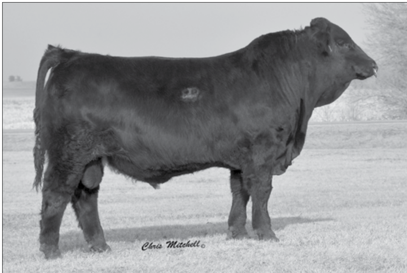
DCSF POST ROCK LAND SHARK 146B1 • Sells as Lot 6.