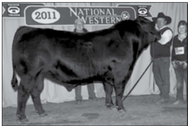
DCSF POST ROCK STAR POWER ET • Sire of Lots 37-40.