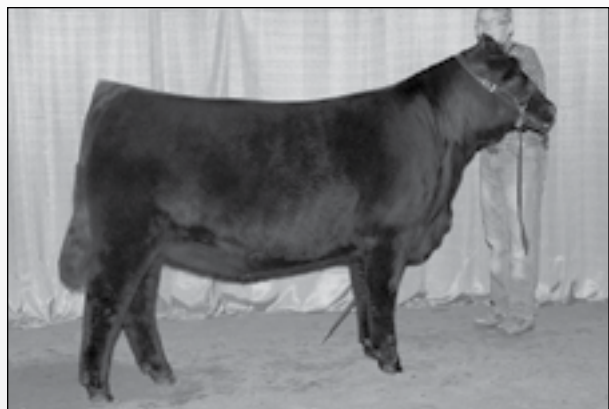
BDCG 401A2 • Full ET sister to Lots 53 and 54, 106.