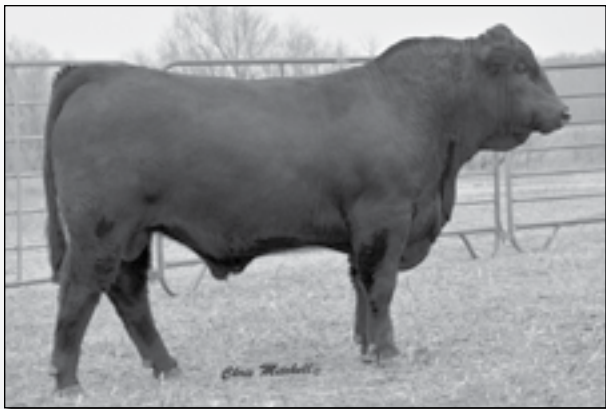
DCSF POST ROCK SHARK 320A2 • Sells as Lot 30.