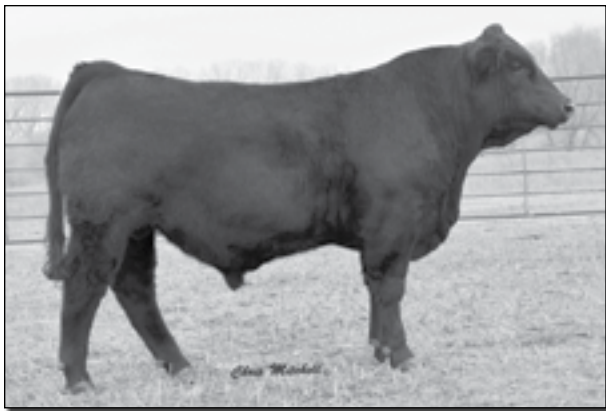
DCSF POST ROCK SHARK 419A2 • Sells as Lot 29.