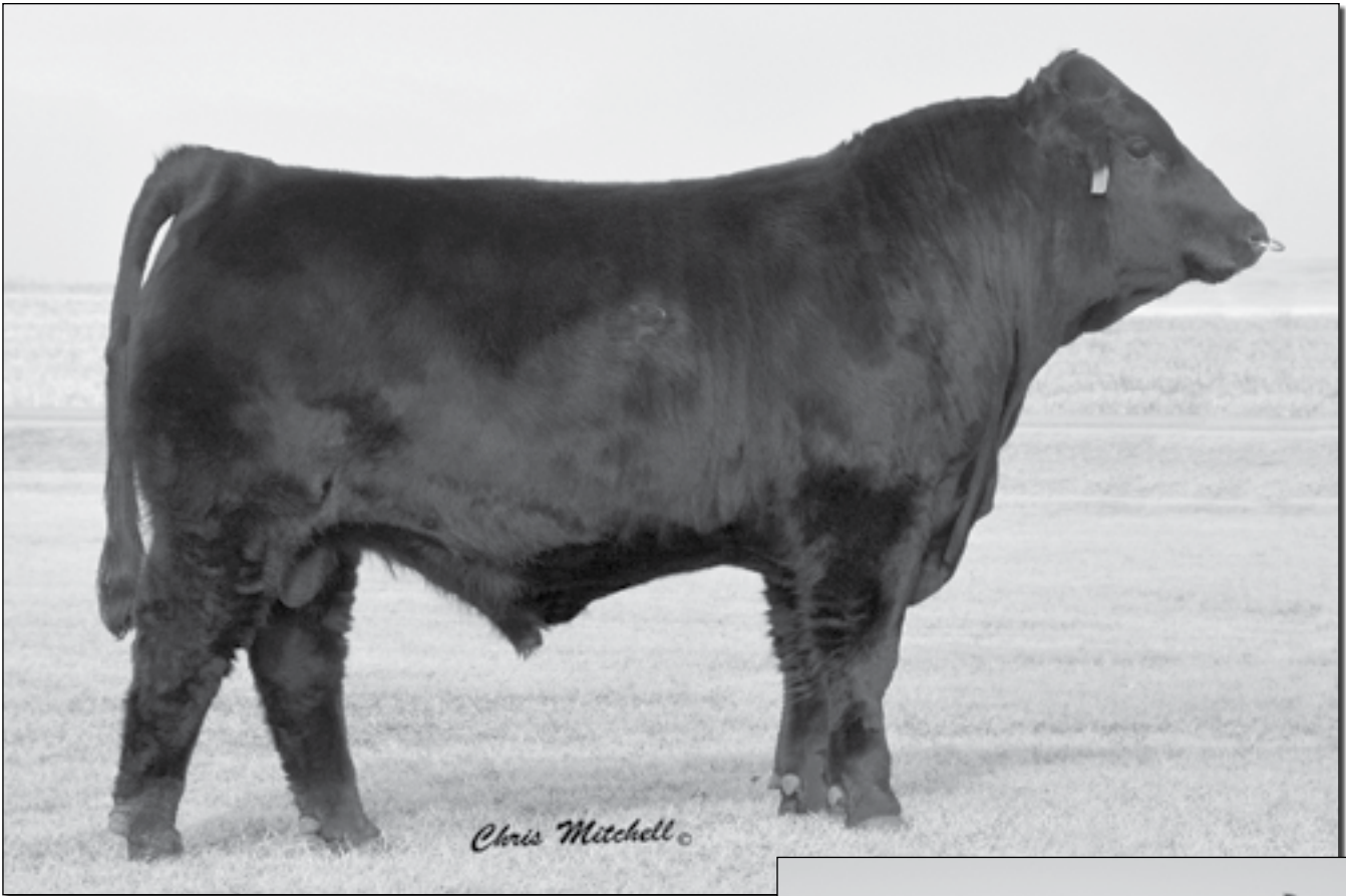
DCSF POST ROCK FACTOR 96B8 • Sells as Lot 2.