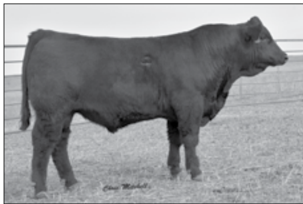
DCSF POST ROCK SHARK 311A2 • Sells as Lot 33.