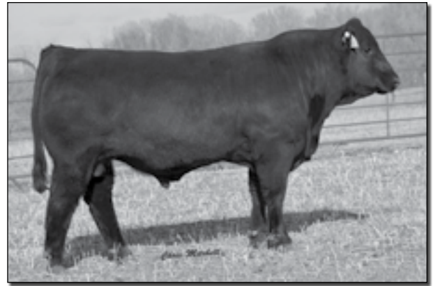
DCSF POST ROCK PRODUCER 58B2 • Sells as Lot 14.