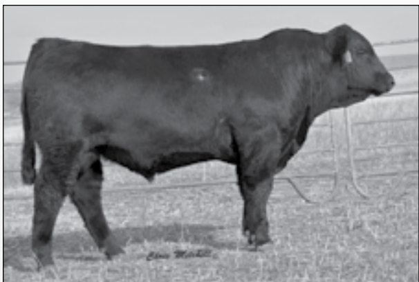
DCSF POST ROCK BLK BAL 409A1 • Sells as Lot 75.