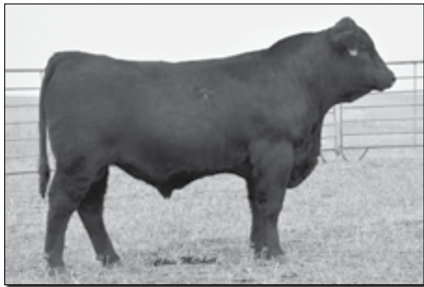
DCSF POST ROCK BLK BAL 349A8 • Sells as Lot 57.