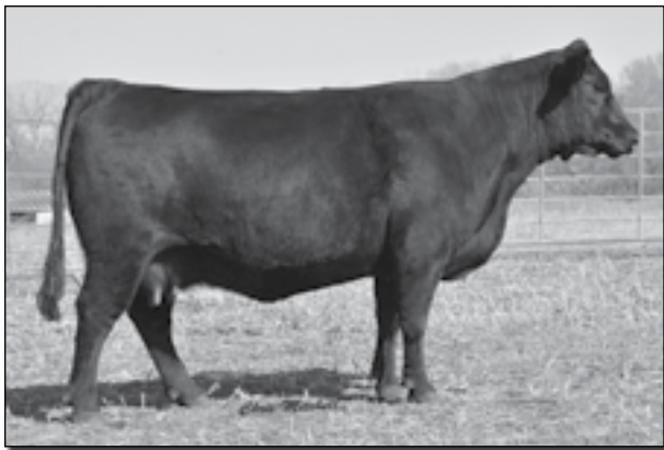
DCSF POST ROCK BLACKCAP 219U8 • Sells as Lot 154.