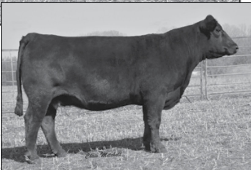
DCSF POST ROCK BLK BAL 15W1 • Sells as Lot 121.