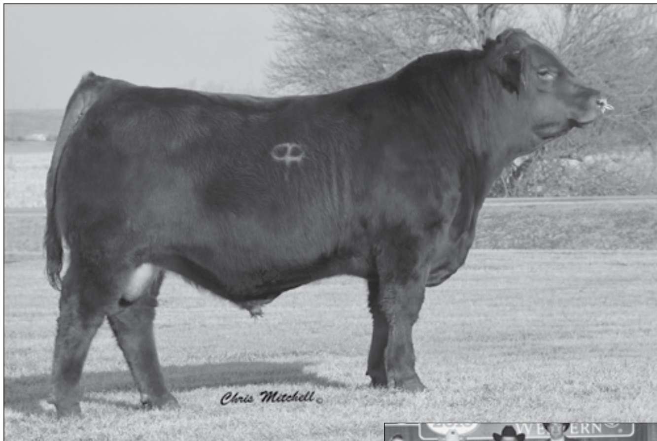
DCSF POST ROCK POWER BUILT 37B8 • Sells as Lot 1.