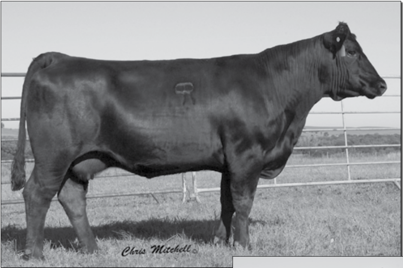
DCSF POST ROCK TWILA 223M2 • Dam of Lots 124-126.