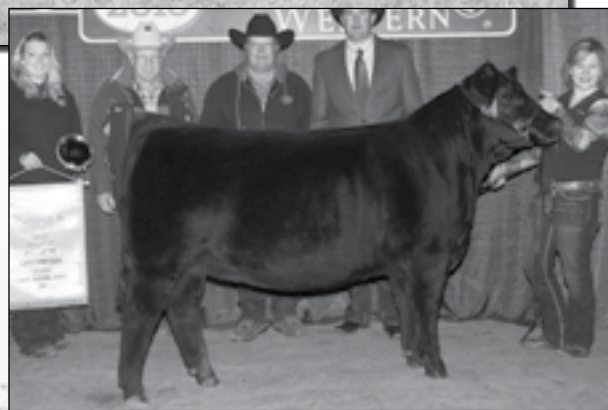
DCSF POST ROCK WILMA 294Z8 ET • Full ET sister to the dam of Lot 1.