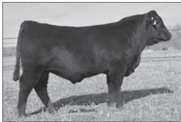
BDCG DC 405B • Sells as Lot 92.