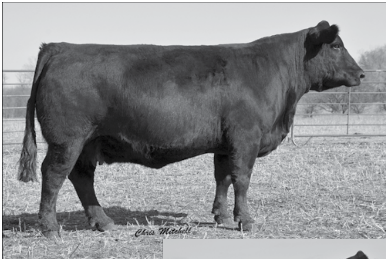
DCSF POST ROCK ELBA 93W1 • Sells as Lot 120.