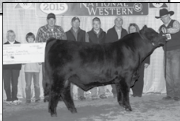
BDCG BUSINESSMAN 401 • Maternal brother of Lots 3-5. 2015 Breeder's Choice Bull Futurity Champion.