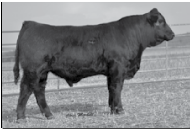
DCSF POST ROCK SHARK 418A1 • Sells as Lot 28.