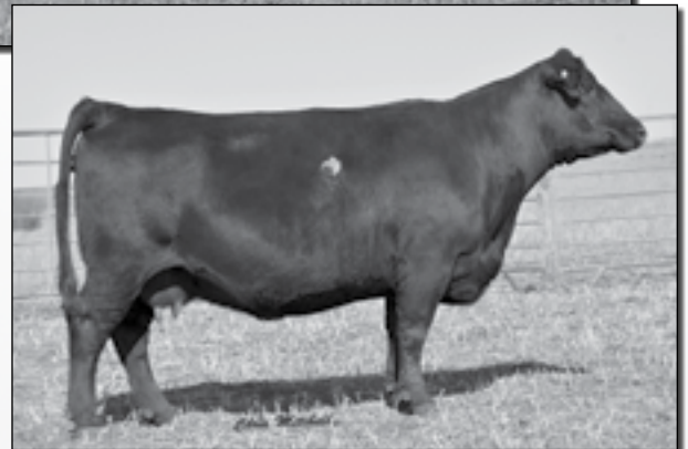
DCSF POST ROCK TWILA 261U2 ET • Sells as Lot 125.

PE 5/3/14 to 8/3/14 to Future Investment X037 (1172364) Due 2/15/15