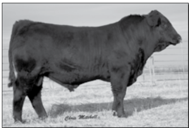
DCSF POST ROCK MASS APPEAL ET • Sire of Lots 168-170.