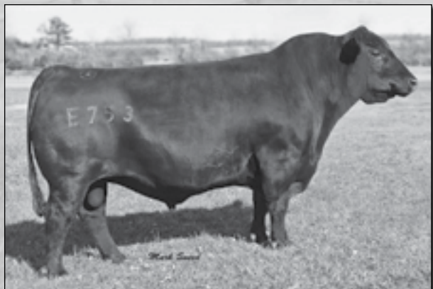
LONE STAR ADVANTAGE E753 • Sire of Lots 80 and 81.