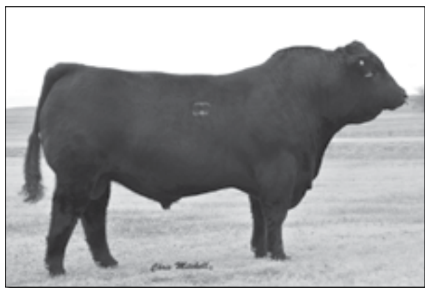
DCSF POST ROCK SILVER 273Y1 ET • Sire of Lots 28-34, 36.