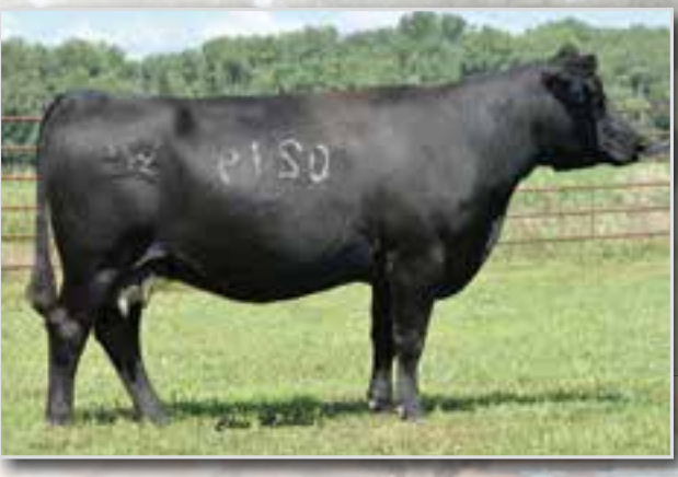
DLW MS GOOD NIGHT 0219X 0F309 • SELLS AS LOT 37.