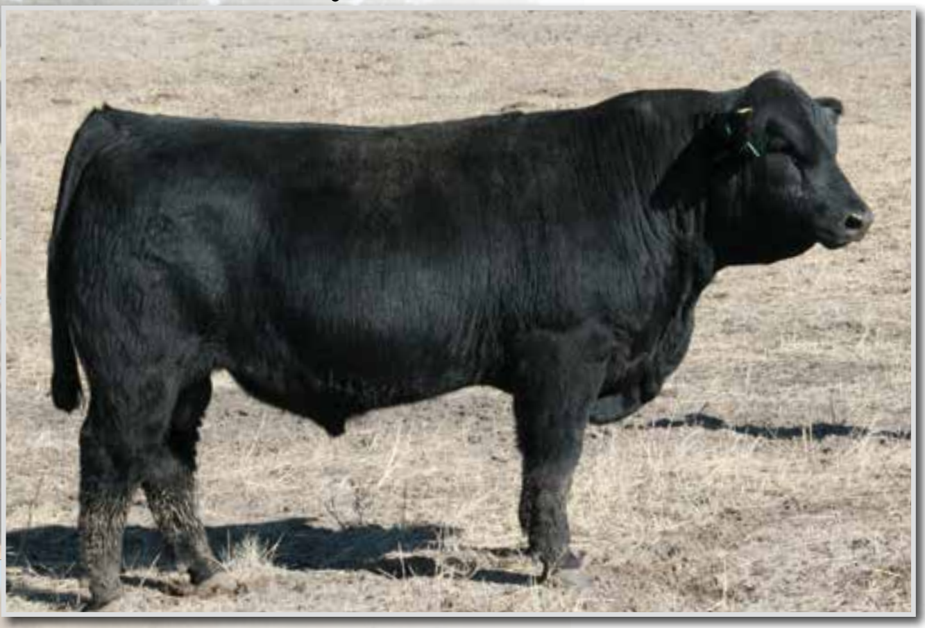
CTR GOOD NIGHT 715T • DAM SELLS AS LOT 4.