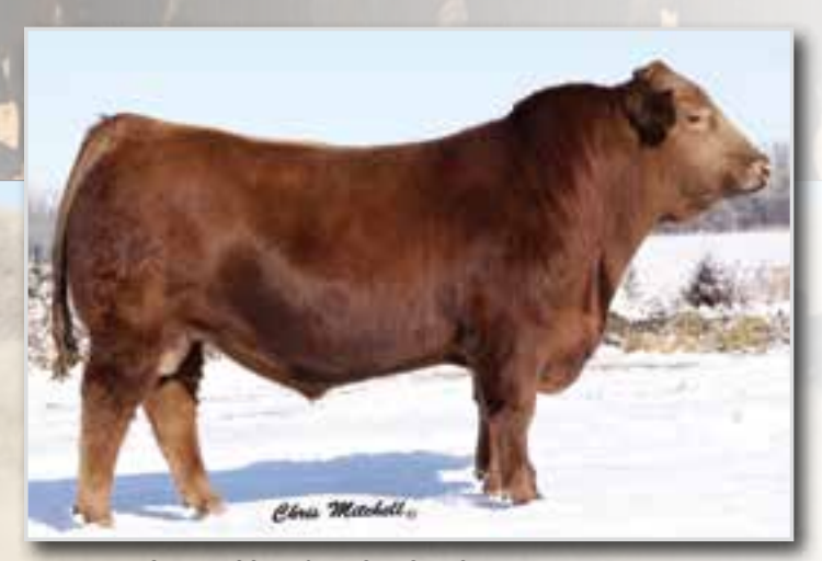
DLW RED POWER 583U • SIRE OF LOT 63.