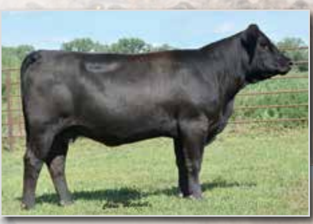
DLW MS GUNS 2514Z ET • SELLS AS LOT 11.