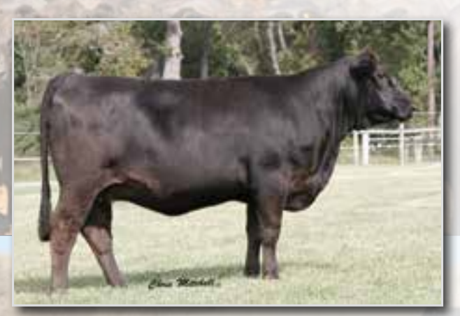
TJB LADY GRANITE 165Y-ET • DAM OF LOT 43.