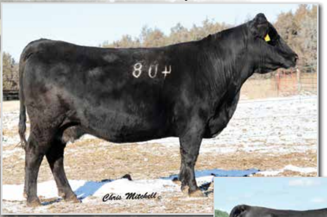
DLW MS KINGPIN 408P • DAM OF LOTS 8-12.

408P is one of the leading genetic packages ever produced in our program here at Warner Beef Genetics. Her progeny are found deep in our cowherd that continue to produce some of the top bulls for our spring bull sale every spring. We have decided to offer five daughters selling as lots 8-12, and one grandaughter, lot 13.