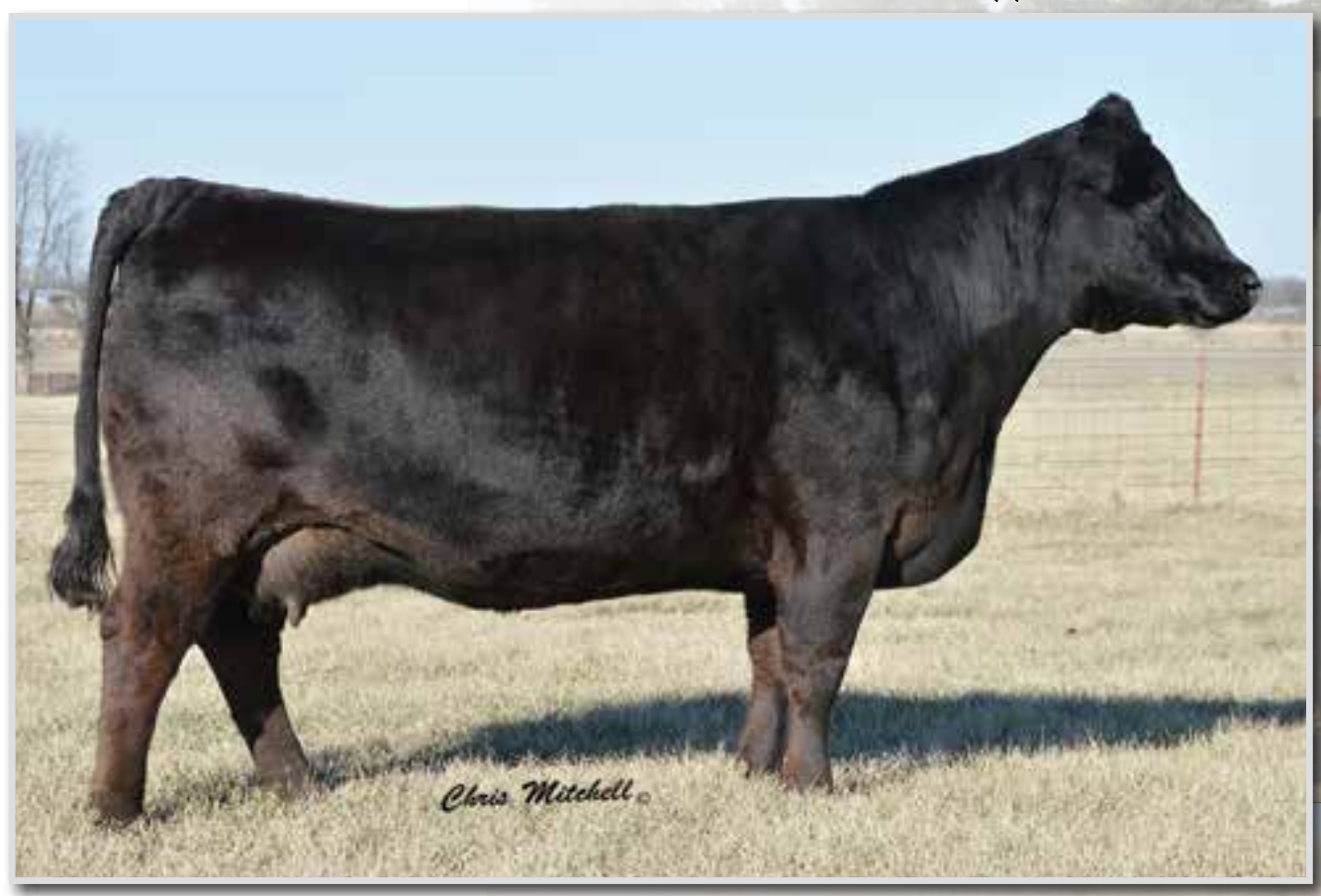
VER LEE ANN 963U • DAM OF LOT 27.