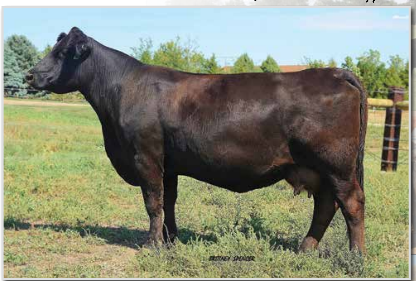
BEA 7200T • FLUSH OPPORTUNITY SELLS AS LOT 1.