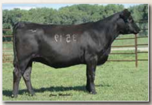
DLW MS X514 3519A • SELLS AS LOT 39.