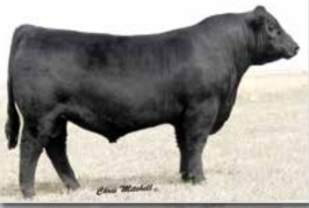
CONNEALY CONFIDENCE 0100 • SIRE OF LOT 46.