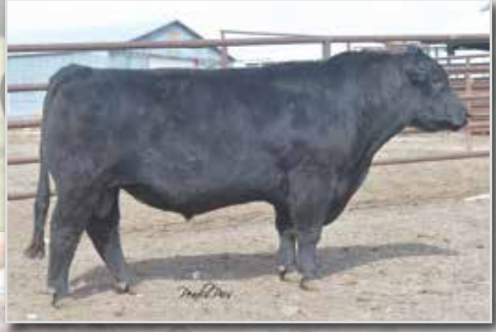
BAR S GO DADDY 0281 • SIRE OF LOTS 51 AND 52.