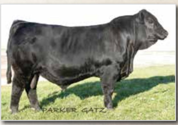
DLW EDISON 6718X • SIRE OF LOT 48.