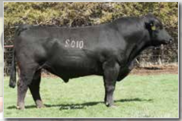
DCH HILLE X102 • SIRE OF LOT 42.