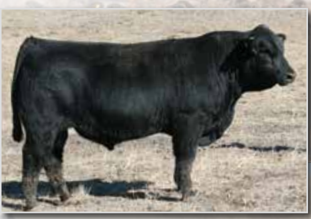
CTR GOOD NIGHT 715T • SIRE OF LOTS 37 AND 38.