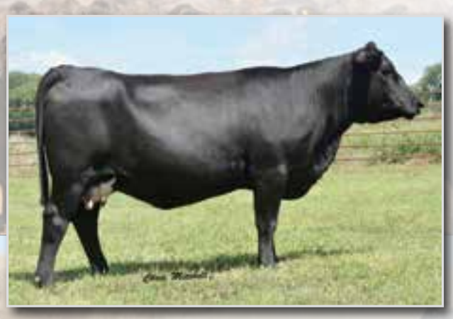
DLW TPG MS EDISON 3533A ET • SELLS AS LOT 23.