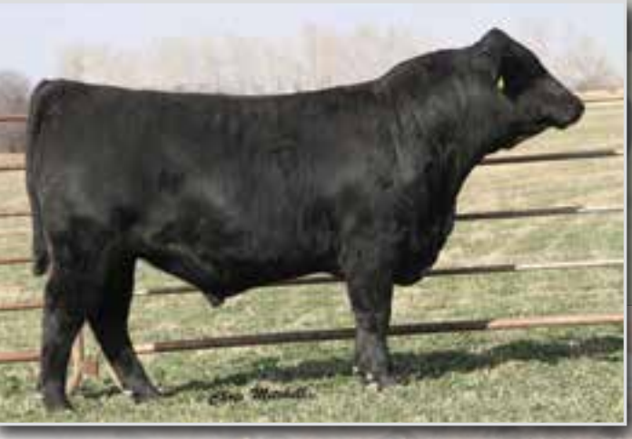
DCSF POST ROCK HIGHLY FOCUSED 308Y8 • SIRE OF LOT 55.