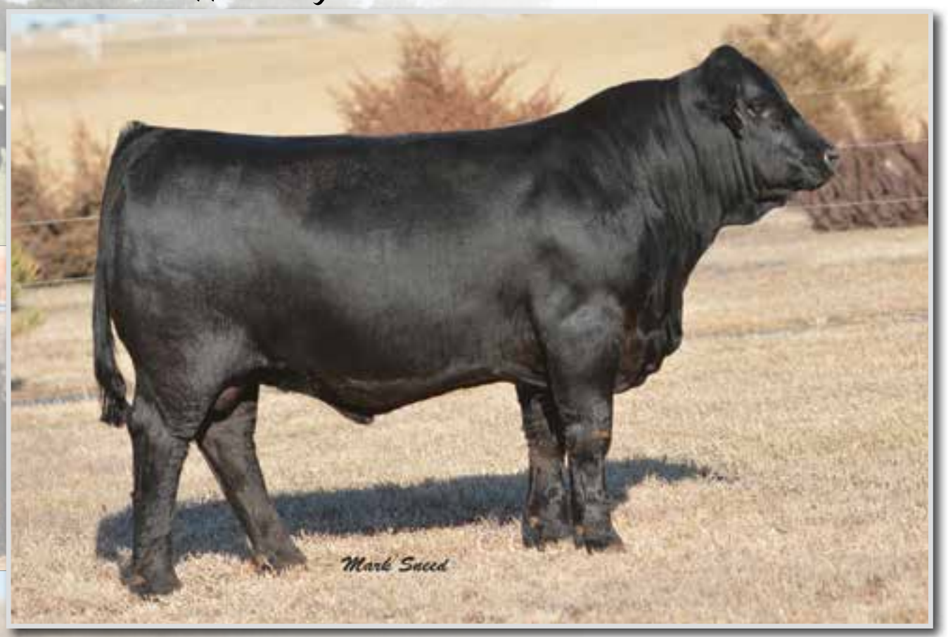
CTR WIDE TRACK 3706A ET • SON OF LOT 2 DONOR DAM.