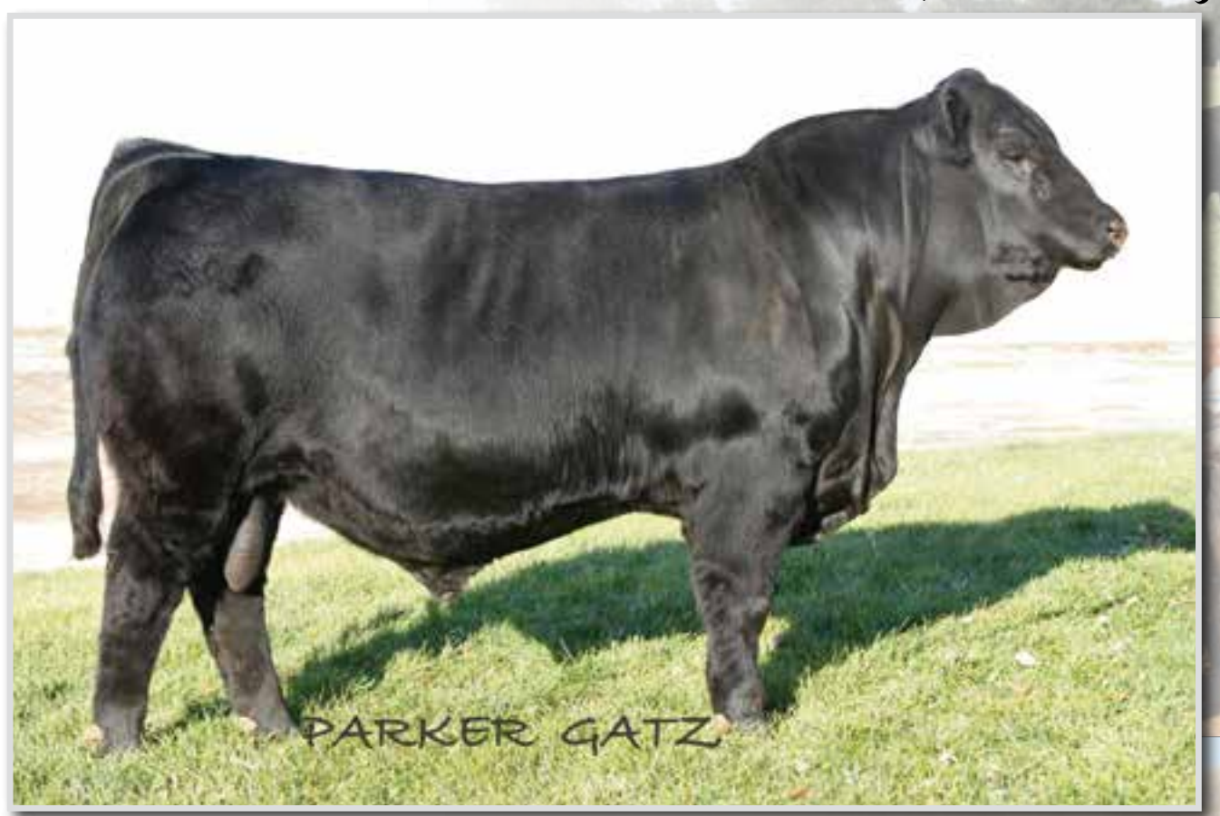
DLW EDISON 6718X • SEMEN PACKAGES SELL AS LOT 3.