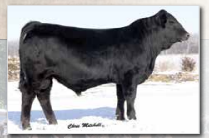
DLW WARDON 24W OF 408 • SIRE OF LOT 36.

Lot 36A DB DP 75% Balancer Heifer BD: 8/20/2015 BW: 71 Sire: DLW Pension 5115Z