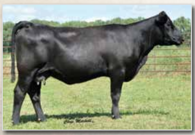
DLW TPG MS TANK 3538A ET • SELLS AS LOT 25.