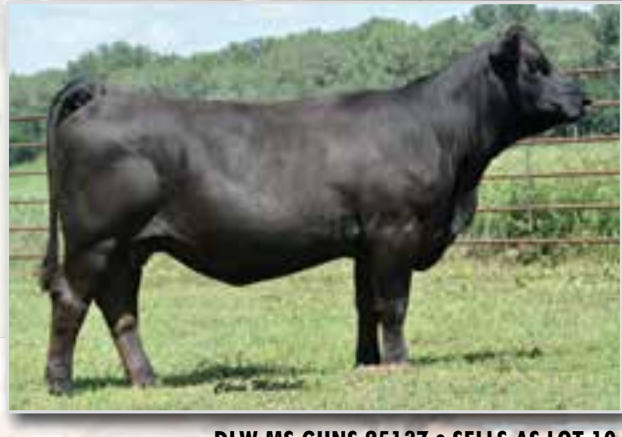
DLW MS GUNS 2513Z • SELLS AS LOT 10.