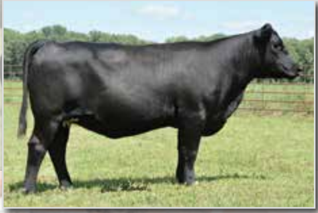
DLW TPG MS EDISON 3540A ET • SELLS AS LOT 22.