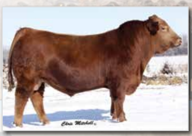
DLW RED POWER 583U • SIRE OF LOT 47.