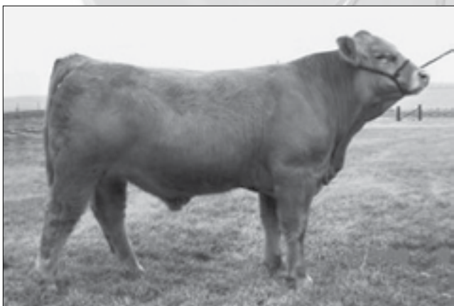
ABCS 009Y • Sells as Lot 3.