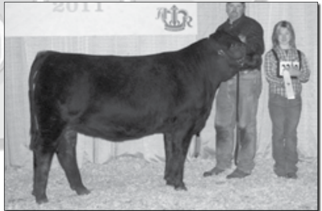
RLKL X23 • Sells as Lot 26.

Tinleigh was a Division winner at the 2011 Iowa State Fair the only time we have had her out. Her dam, Chevonne 5161R is a previous Grand Champion Female at the NAILE in Louisville and the Iowa State Fair. Chevonne is also a Dam of Merit. Super cow family that should create an outstanding production female in 051X. AI'd on 9-11-11 to HYEK Black Impact (844875). PE 12-20-11 to 2-01-12 to TNTF Dark Horse 061W (1140801). Safe to AI and due 6-24-12.