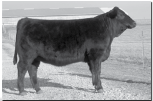
HRNK 1974Y • Sells as Lot 31.

Futurity Heifer. If you are looking to add capacity and easy maintenance to your herd, this female is for you. She is thick, deep, and easy fleshing. She ranks in the top 15% for calving ease and the top 10% for birth weight. She is ready for any program looking to add volume to next year's calves. Sells open.