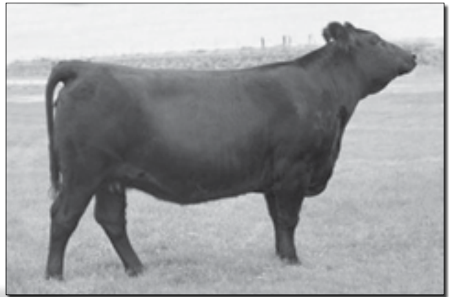
ABCS 002X • Sells as Lot 14.

This is a solid brood cow that will have a Western Hauler calf at side on sale day. She comes from the carcass specialist ISU Imaging and ABCS 313S, a cow that's been making super balancers for us. This deep sided heifer has a lot to offer with her excellent maternal traits, and her above breed average carcass epds and Igenity scores. Add this money maker to you arsenal at the Iowa Beef Expo. Due to Calve to Western Hauler on 2-4-12.