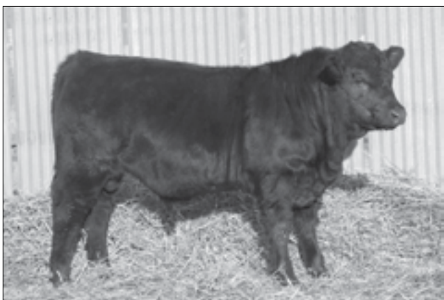
JTB 94Y • Sells as Lot 4.