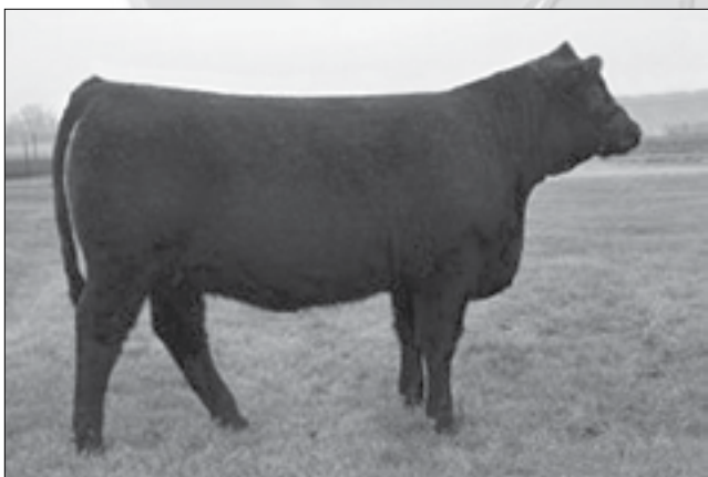
ABCS 001Y • Sells as Lot 29.

I can't say enough good things about this young female out of one of our donors "2030P"! Mass, power and thickness are just some of the many terms folks have used to describe her. I'm excited to see what this heifer has in store for her new owner! After being competitive in the show ring she will carry on the long tradition of the "Lady Granite" cow family making great mamma cows. Her sire "Masterpiece" is also making his mark producing some of the best females in our herd as well as the TJB Gelbvieh program. Don't miss a great opportunity to invest in a female who is sure to compete in the show ring as well as move right into your donor pen! AI'd on 12/11/11 to Sinclair Net Present Value (AAA14311951).