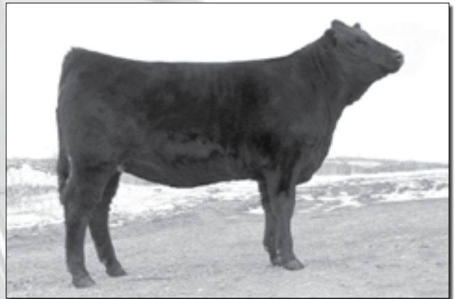
JEB 4X • Sells as Lot 25.

This is the first female out of th Alyiah cow family to be offered for sale. We are offering 0861X from our top cow family on the place. Iowa Beef Expo demands the best of the best, Here She Is! Her dam is the top young female on the ranch and her maternal grand dam is a Dam of Merit. Excellent EPDs and a high volume female. AI'd on 5-28-11 to MYTTY In Focus (AAA13880818). PE 6-10-11 to 9-10-11 to TNTF Dark Horse 061W (AMGV1140801). Safe to AI and due 3-11-12.