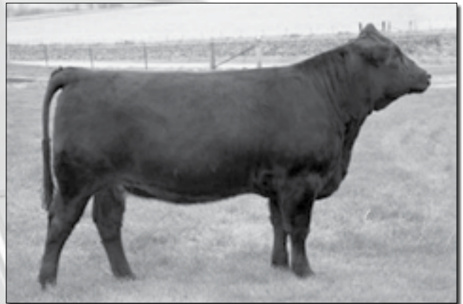
ABCS 010X • Sells as Lot 15.

If you're looking for a purebred bred female in this sale Lucille is one you need to check out. She has excellent performance epds, and attractive profile, and is an absolute doll to work with. PB females are hard to come by, and even harder to find are ones that are the ideal maternal package like this one. Lucille comes from one of our strongest cows lines. Add her to your herd so she can do the same for you. Pasture Exposed to ABCS 027X from 5-1-11 to 6-1-11.