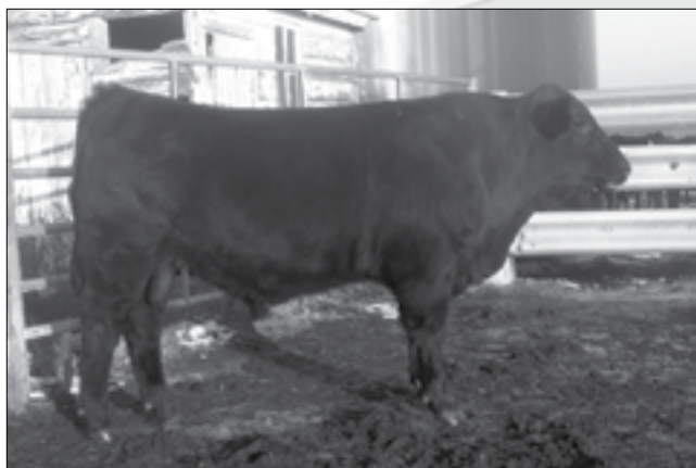
EPGG 316Y • Sells as Lot 12.

Mr Youngblood a moderate framed, very smooth made bull in an attractive package. His dam, 217L Prairie May is a very good purebred production female in our program. We have sold sons and daughters of 217L through the years in the Gelbvieh Gold Sale. 33y is a calving ease bull that we feel supports his pedigree will give you growth and maternal values along with the calving ease.