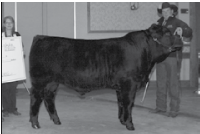
DVE 13U • Sire of Lot 1.