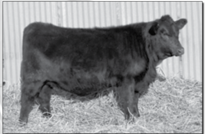
JTB 901Y • Sells as Lot 33.

Futurity Heifer. A heifer that is bred for calving ease and low birth. She is a high volume female that has a predictable future as a brood cow. Excellent cow family going back to Black Impact and Cherokee Canyon. Sells open.