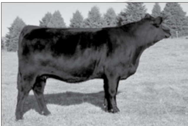
CIBS 0827X • Sells as Lot 19.

Our first SEMG Vision 6S female to be offered at auction. We do not think you will be disappointed. A very powerful, moderate bred heifer that is dark in her color. Her dam is from the famed Arata cow family at Post Rock Cattle Co and Dawson Creek Gelbvieh. Mated to RAW Mississippi Gambler 24B resulting on a purebred calf. AI to RAW Mississippi Gambler 24B on 5/22/2011 safe to AI and due 3/5/2012