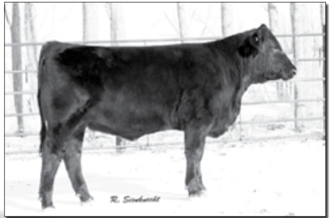
SINK 107Y2 • Sells as Lot 41.

Futurity Heifer. Here is an open heifer that has comes from the top of our 2011 heifer calf crop. A sister also sells as lot 20 in this Gelbvieh Gold Sale. 107Y2 ranks in the top 1% for weaning, yearling and feedlot merit. She has all the credentials that we look for in our program to make the cow herd. It is very hard to let go of this heifer and her sister, however if we are going to sell, we are going to sell from the top. Sells open.