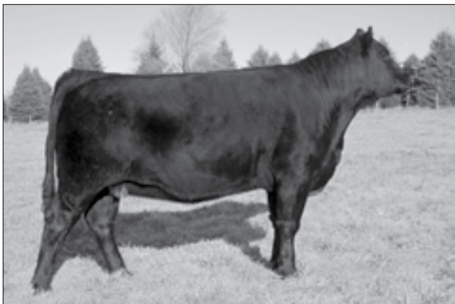
CIBS 0806X • Sells as Lot 18.