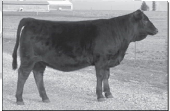
HRNK 1823Y • Sells as Lot 35.

Futurity Heifer. What a pedigree combination, MYTTY In Focus as the sire out of a Black Impact dam. Here is a young heifer that will make a great junior project, however the true value may come as a brood cow. Look for an outstanding production record for 901Y in the future. Calving ease, production and carcass genetics all combined in this pedigree. Sells open