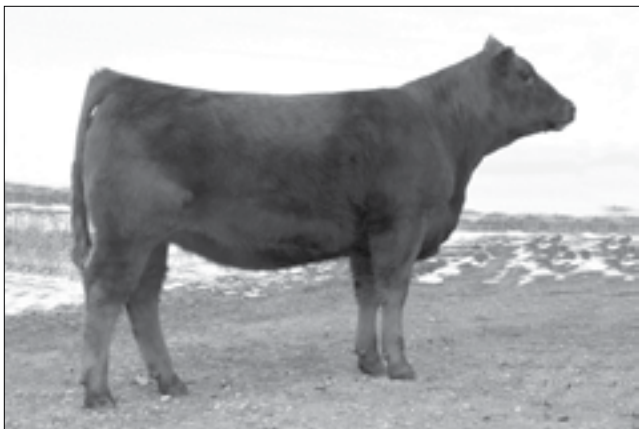
MTB 25X • Sells as Lot 27.