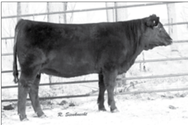
KCCG 92Y • Sells as Lot 37.