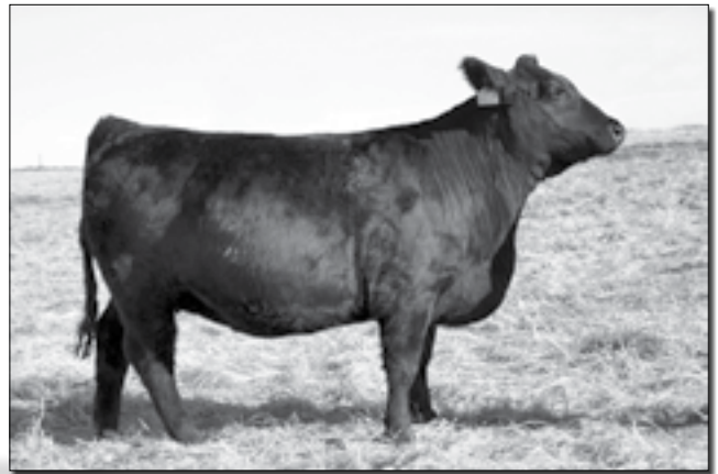
SVVG X052 • Sells as Lot 22.

Glory is a black, double polled daughter of the Angus growth sire, Grid Topper out of SVV Delight who at 14 years of age weaned off one of my heaviest heifer calves in 2011. Glory is a heifer with great spring of rib and length of body. She is a heifer that covers all of the bases when it comes to her EPD profile. AI'd on 6-6-2011 to Tau Kruggerand and due 3-21-2012.