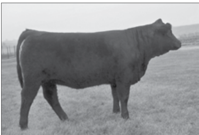
ABCS 012Y • Sells as Lot 30.

Futurity Heifer. Here is a Homozygous Black double polled Balancer heifer the really grabs your attention. The style and depth of this heifer are second to none in our open heifer pen this year. This is a heifer that we really feel has a chance to turn some heads in the show ring if given the opportunity. You will also notice she has a very balanced set of epds and her Igenity carcass profile is phenomenal. Don't miss this outstanding heifer on sale day. Sells open.