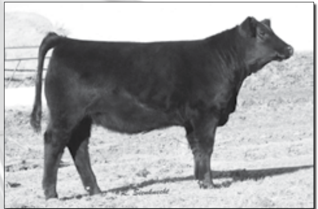
DTKF 211Y • Sells as Lot 44.

Futurity Heifer. Tametra is a Double Black Double polled long bodied easy moving female with alot of upside. She is sired by 4WA Turismo who also sired my donation heifer last year. Her dam is an Extra Exposure with an almost perfect udder that is a very easy keeping female. Sells open.