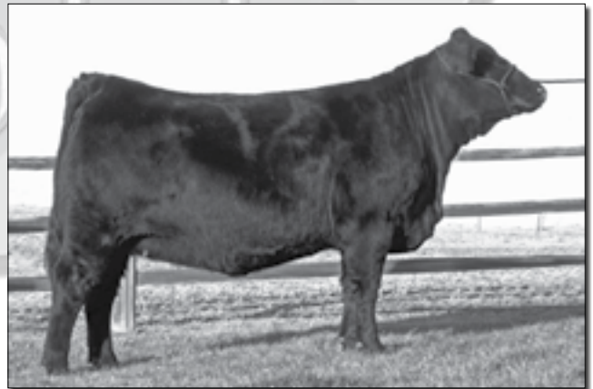
FMH 0596X • Sells as Lot 16.

Be sure to take a look at 0596X. Here is one of the top females to be sold from our program. She is out of a full sister to Black Impact and sired by one of the top female producing sires in the cattle industry, MYTTY In Focus. Will have a calf at side sale day sired by FMH 3231x, a son of Hot Fudge and Detonator dam.