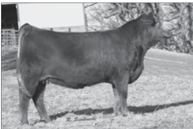
SINK 39X • Sells as Lot 21.