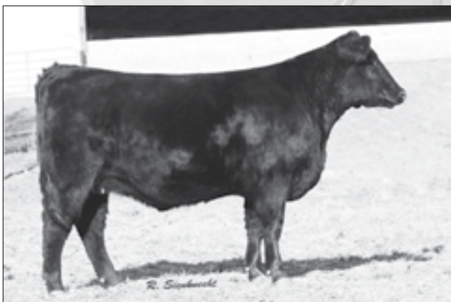
SINK 107X2 • Sells as Lot 20.