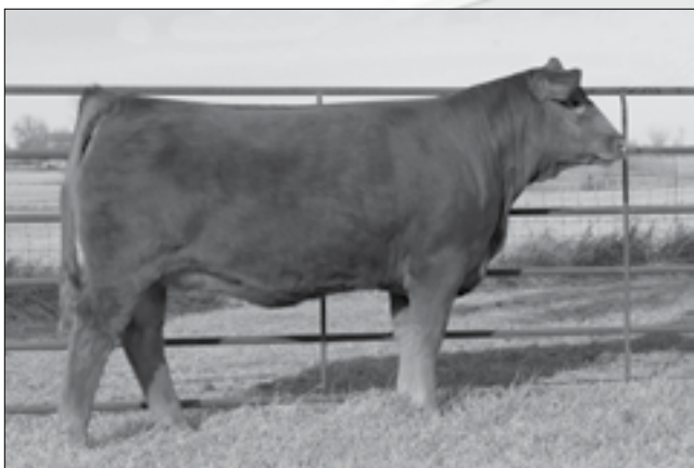
JGPG 057X • Sells as Lot 28.

Deep bodied and thick with tremendous capacity – she will be an attractive Senior Heifer next summer! She's carrying an exceptional set of EPD's with WW, YW, REA & CV in the top 10% of the Balancers. Her mother, grandmother and great grandmother (who lived to 17 years of age!) all have beautiful udders and do a terrific job of raising a calf every year. I would expect 25X to be the same way! She is bred to 'Winthrop' for a late September baby – he is a Homo Polled Red PB Gelbvieh sire with excellent calving ease. AI'd on 12/20/11 to BWF Brandywine Winthrop 957W (AMGV1131563). Safe to AI and due 10-03-12.