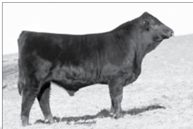
DTKF 114Y • Sells as Lot 5.

A homo polled bull with balanced EPD's and a pedigree that is full of AI sires and donor dams from top to bottom. This structurally correct square hipped bull is loaded with the genetics that can make improvements in your herd and your bottom line.