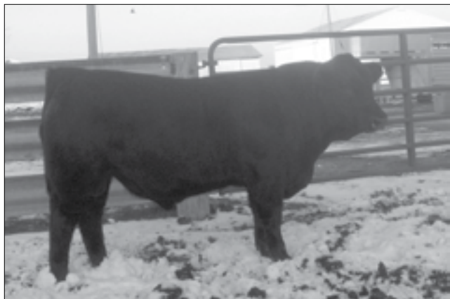
CPGG 33Y • Sells as Lot 10.