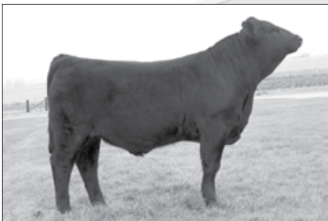
ABCS 010Y • Sells as Lot 2.