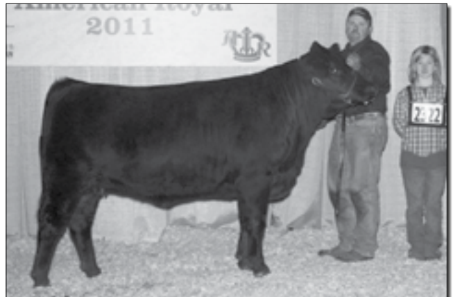
RLKL X108 • Sells as Lot 17.

Here is one of my top picks in the herd this year. She is sire by CK Crazy Horse 138P and on the maternal side there is Flying H Exclusive and PD Resource. She has plenty of size and length to make a top production female in any program. Take a look at EPDs as she ranks in the top 5% in performance and ranks high in maternal and carcass EPDs. She is bred to RLKL Mr T a bull that I raised out of the Rhonda cow family that came from Post Rock in Kansas. Al'd on 5-18-11 to RLKL Mr T. Safe and due 3-01-12.