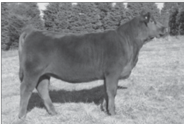
CIBS 1938Y • Sells as Lot 38.

Futurity Heifer. Sired by CIRS Decade, the 2010 Breeders Choice Bull Futurity Champion. The Decade offspring are being talked about throughout the breed and excelling in many programs. Outstanding brood cow potential in Y 92. Sells open