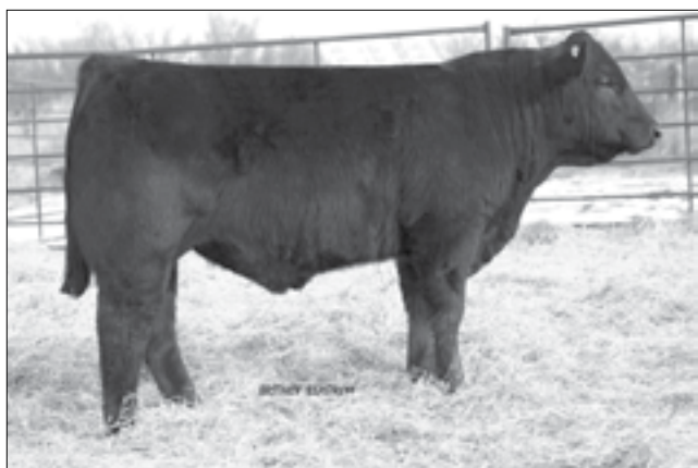
BARB Cy 808U ET • Sire of several of the Lot 13 Heifer Pick.

Mr Yellowjacket is a herd sire prospect that is very impressive. He is out of a very good Skyler daughter, Ruby Red. She is one of the best production females we have on the place. Her 2010 bull calf was sold at the 2011 Iowa Beef Expo. Yellowjacket is a big, deep-sided bull with a big hip and rear quarter. Be sure to notice his yearling weight of 1420 pounds.