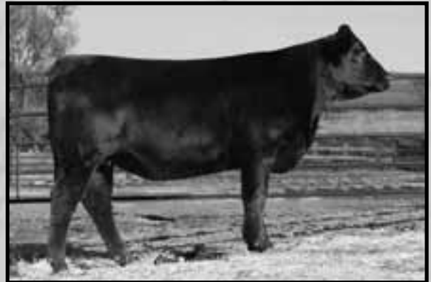
DCH X145 • Sells as Lot 44.

CHIMNEY BUTTE RANCH When Chris comes to screen he gets to review all of our bred heifers. This is one that is really hard to sell. The maternal side of the pedigree is rock solid including dams of merit and dams of distinction. Add Pure Power for additional maternal strength and good looks, this is quite a package. Ultra sound indicates she is due 4/2/12 to DCH X115, natural service. X115 is a Tye son that we held back for our own use. In the 2011 Golden rule sale, 20 consignments, including the donation heifer carried the DCH prefix. Year after year we bring the "good ones" to this sale.