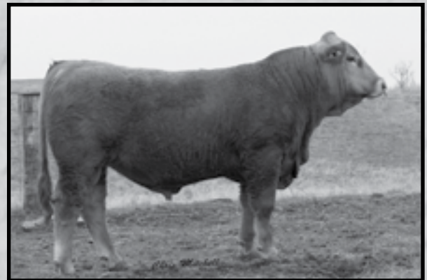
DGDC 27X • Sells as Lot 2.

27X is out of a daughter of our top producing donor, Miss Classy 210M. This cow never misses. Her daughters in production are phenomenal. Take a look at all our consignments, as they are all from the Classy 210M family. You can expect performance, eye appeal and maternal production throughout this pedigree. 27X is also sired by the National Champion Bull, Collateral.