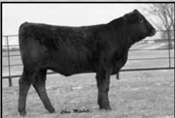
DCHD 261Y • Sells as Lot 55.