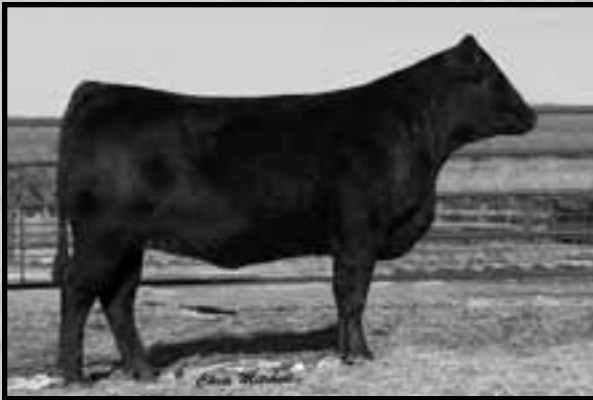
DCH X112 • Sells as Lot 39.

This low birthweight Granite 200P2 daughter has a lot of eye appeal, width and depth. A great genetic package bred to the homo black, homo polled Carolina Fortune son ZJC Hoss for a heifer calf due March 3