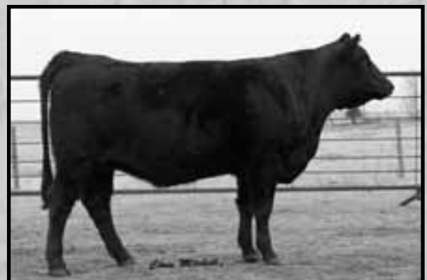
JMDS X4 • Sells as Lot 37.