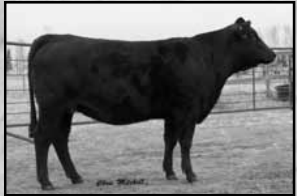
JMDS X58 • Sells as Lot 43.

A little smaller frame female but sure not to lose the performance. Her sire Frost Line was no disappointment to our herd bull line up, by bringing us this fine female to bringing us our last year's lead off bull in our spring bull sale! AI Bred to DCH Hille S128 (990052), ultra sounded due with a heifer calf on 2/27/2012.