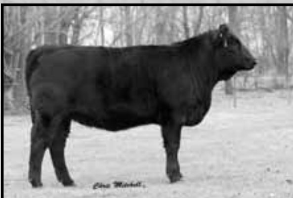
KLJA 104Y • Sells as Lot 49.