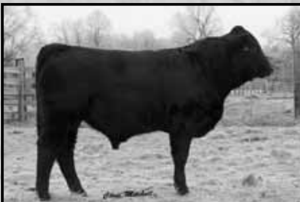
RLFG 321Y • Sells as Lot 22.