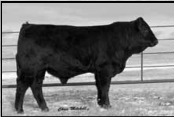
DCHD 067Y • Sells as Lot 31.