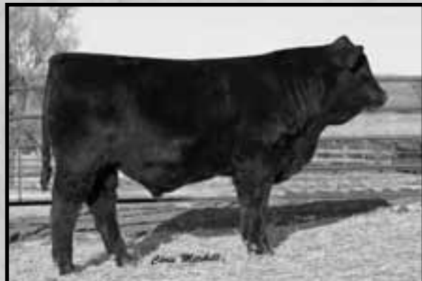
DAHL 38Y • Sells as Lot 18.

28y is a full brother to our high selling entry in the 2011 Golden Rule Sale. He is double black, thick and loaded with performance. This will be the last natural sired set of DAHL 22s sons available. The Offspring of 22S have been outstanding, don't miss the opportunity to own one of the half brothers we are selling in the Golden Rule Sale.