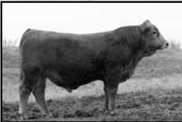
RCKG 1Y • Sells as Lot 7.

Purebred Bull 01/30/2011 BW: 94 Red RCKG 1Y WW: 838 Double Polled 1189397