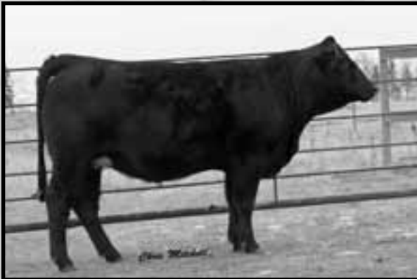
JMDS X24 • Sells as Lot 40.

Outcross genetics in a beautiful, stylish, well balanced female. Her sire is a flush mate to the Tremor bull that has produced several of the high selling bulls at recent Golden rule sales. Ultra sound indicates a bull calf to DCH X109, due 3/22/12. X109 is co owned with Martin Gelbvieh and was one of the top selling bulls in our 2011 sale. As always we stand behind the ultrasound data and guarantee the sex when indicated, and the sire.