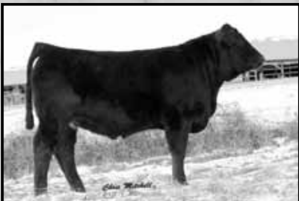
KKC 96Y • Sells as Lot 56.