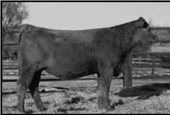
DDGR 157X • Sells as Lot 46.