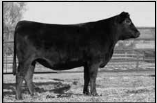
DCH X200 • Sells as Lot 45.

CHIMNEY BUTTE RANCH This beauty comes from a Pure power son we used in our program. A beauty she is, and her maternal pedigree has Image, Tank, and Electric Black as cornerstones. She is probably homo black. DNA profiles for all our consignments will be available sale day. Ultrasound says she is carrying an A-I bull calf, due 2/22/12 sired by the X109 Majesty son. Could be the top end bull for the 2013 sale. In the 2011 Golden Rule sale the 5 high selling bulls were sired by Chimney Butte bred and raised bulls.