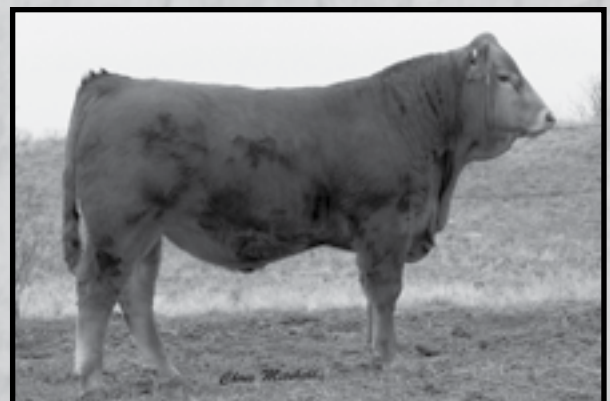
DGSC 6Y • Sells as Lot 4.

A full brother in blood to lot 2. His dam is a full sister to the dam of lot 2, out of Miss Classy 210M. Sire by the National Champion bull, Collateral. This son of Classy is very impressive in muscle expression and volume. Take a look at all our consignments, as they all stem from the Classy 210M family. You can expect performance, eye appeal and maternal production throughout this pedigree.