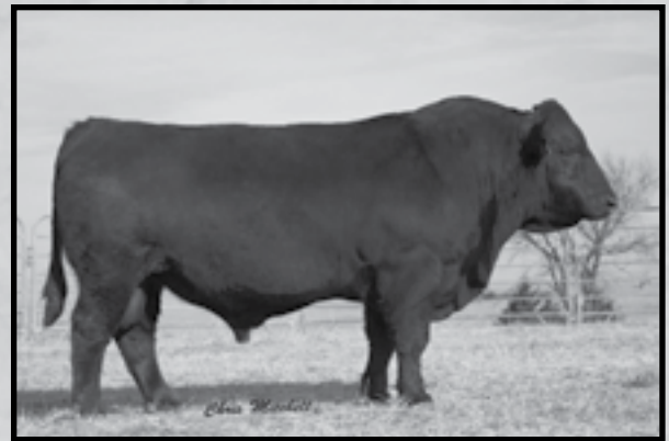
JRI Great Western 254N68 • Sire of Lot 1.

Sired by Great Western out of the Wilma cow family from the Post Rock program in Kansas. This fall aged bull is a low birth bull with a 75 pound birth weight and posted a yearling weight of 1199. This maternal cow family, Wilma 147H, is one of the top production cow families in the breed. This bull will work in both the purebred and commercial sectors of the Gelbvieh breed.