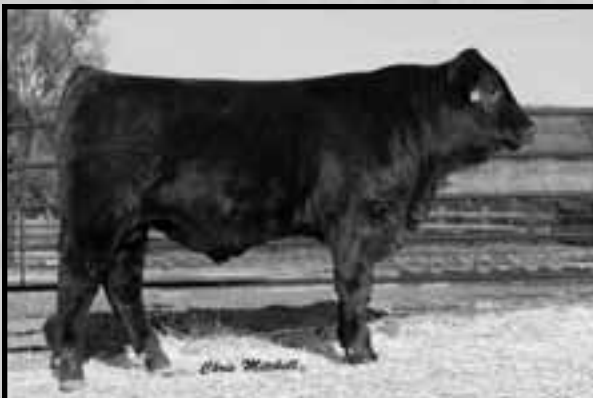
WOHL Y80 • Sells as Lot 21.