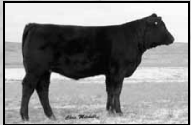
DCHD 075Y • Sells as Lot 52.

This is one of the few first heifer calves out of Cheyenne's CDOC 101 bull we raised. With her impressive EPDs, tremendous length and thickness in a stylish package she will become a great cow. A great junior prospect who is already halter broke. Sells open.