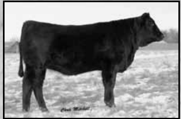
KKC 23Y • Sells as Lot 51.

23Y is a feminine female with extra length and volume. Her mother KKC Ms Power 118N is our of our top producers, with a full brother to 23Y selling for $5500 in our 2010 production sale. Build a cow family around this great female. Sells open.