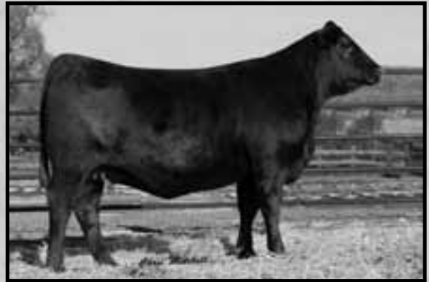
DDGR 31X • Sells as Lot 42.

Brood cow deluxe with super depth and femininity. She has the genetics to be a great one with In Focus, Black Impact and Visa in her pedigree. Due March 3 with a heifer calf by the ZJC Hoss bull to add the carcass traits of the Carolina Fortune line.