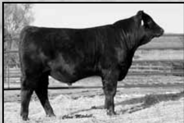
WOHL Y24 • Sells as Lot 19.

38y is another great son of DAHL 22s. 38y will not disappoint as he is deep, thick and is has always one of our heaviest bulls across the scale. He is an excellent performance bull with maternal strength built throughout the pedigree.