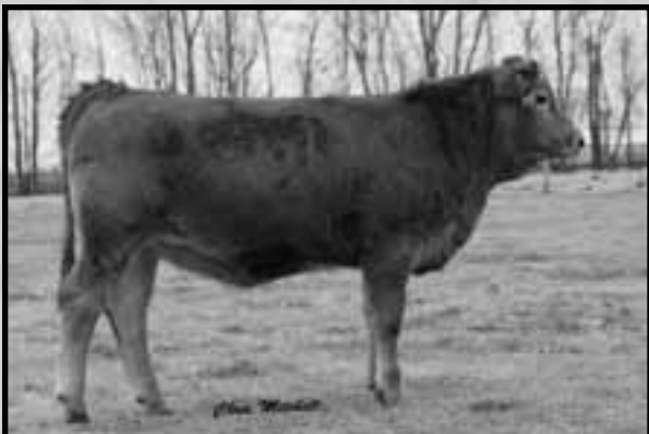
KLJA 109Y • Sells as Lot 54.