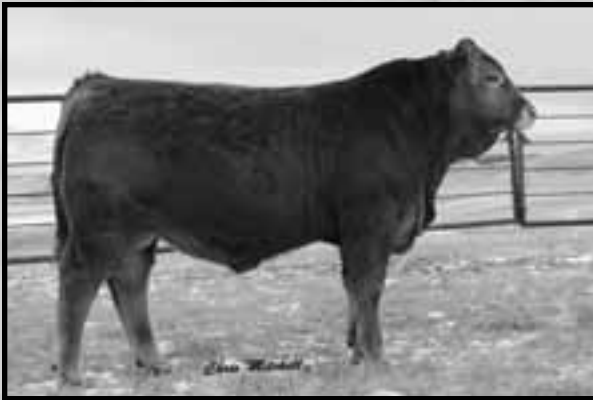
DCHD 615Y • Sells as Lot 29.