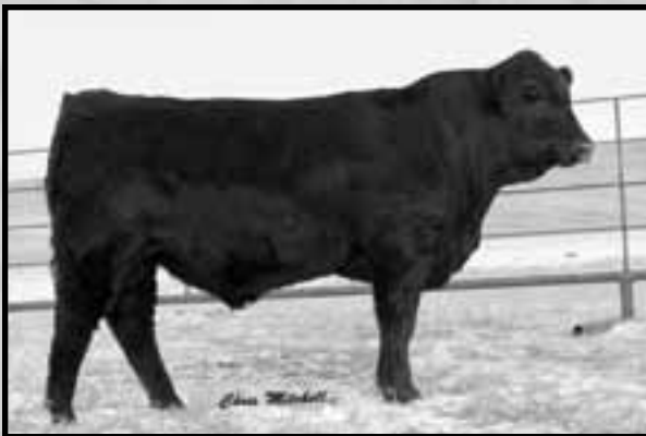
MKT Y110 • Sells as Lot 5.

75% Gelbvieh Bull 01/20/2011 BW: 75 Black MKT Y110 WW: 710 Double Polled 1198299