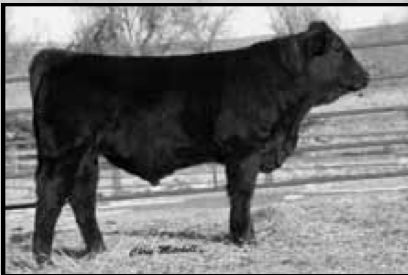
PHG Y50 • Sells as Lot 32.