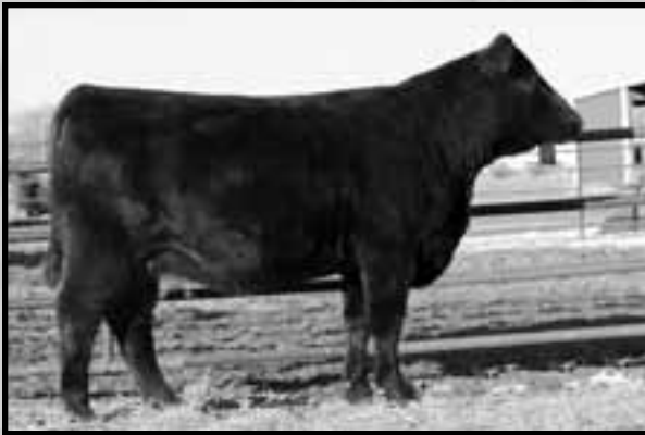
DDGR 3X • Sells as Lot 38.