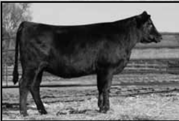
DCH X254 • Sells as Lot 47.