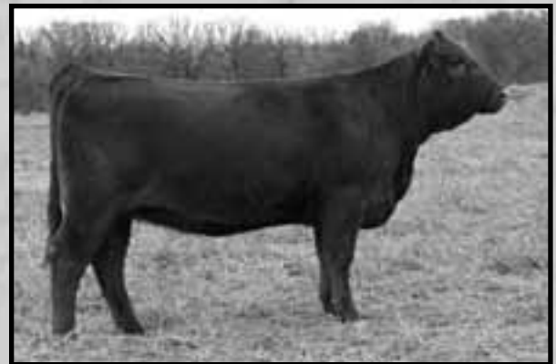
CRAN X004 • Sells as Lot 36.

Angel is a Balancer bred heifer sired by Net Worth that comes from a very productive cow family. She is a performance/maternal bred female that will excel in any program. She ranks in the top 15% for feedlot merit and the top 17% for yearling weight. Sells bred to RTC Atlas for a spring calf.