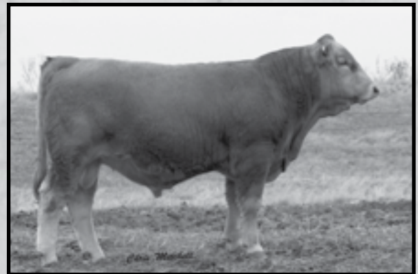
DGSC 5Y • Sells as Lot 3.

Here is a son of our top producing donor, Miss Classy 210M. Sire by the National Champion bull, Collateral. This son of Classy is very impressive in muscle expression and volume. Take a look at all our consignments, as they all stem from the Classy 210M family. You can expect performance, eye appeal and maternal production throughout this pedigree.