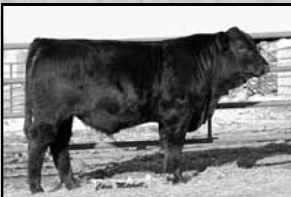
DAHL 60Y • Sells as Lot 24.