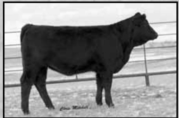
BDOC 264Y • Sells as Lot 53.

264Y is Bailey's heifer out of W287 Wow and a 1st calf heifer. We are very happy with the first Wow offspring. She is a very correct and stylish heifer with lots of spring and depth of rib. Sells open.