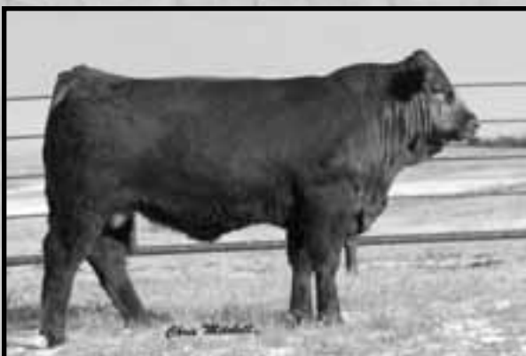
MKT Y124 • Sells as Lot 8.

Purebred Bull 02/06/2011 BW: 89 Red MKT Y124 WW: 793 Double Polled 1198301