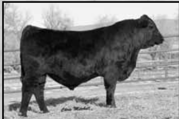
PHG Y29 • Sells as Lot 20.

An eye appealing homozygous black bull. He has doses of calving ease in his background alongside a cow family with a large degree of performance. His dam is the full sister to WOHL X7, the top selling bull in the 2011 Golden Rule Sale we sold to S.R. Gravely Ranch in Montana. Y24 is a Purebred with a nice head, clean neckline and maternal consistency within his pedigree. Retaining 1/3 Semen Interest