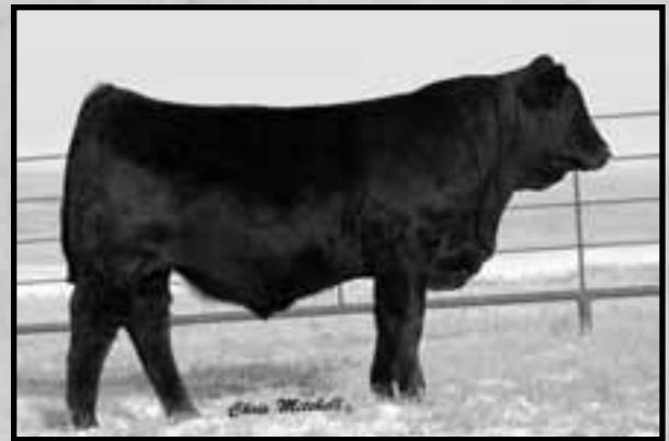
DCHD 725Y • Sells as Lot 33.

The Roy sons come to the top of the bull pen every year and this one is leading this year's pack. Check out the thickness from end to end along with a stylish package. 725 is made with a deep quarter and lots of depth of rib. Igenity results available by sale day. Retaining 1/2 semen interest.