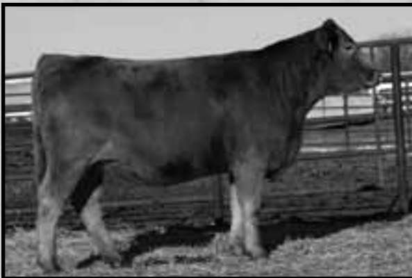
DCH X258 • Sells as Lot 48.