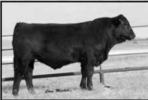
MKT Y121 • Sells as Lot 6.

75% Gelbvieh Bull 01/30/2011 BW: 87 Double Black MKT Y121 WW: 798 Double Polled 1198300