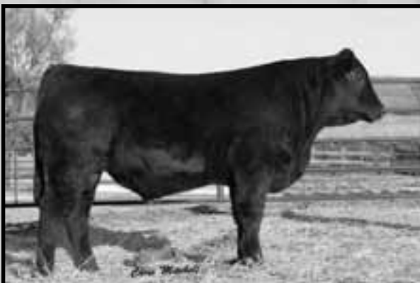
BDMP 6Y • Sells as Lot 23.