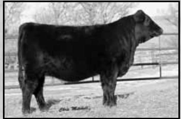
PHG Y27 • Sells as Lot 50.

Here she comes now – Mony Mony! This sweet March Balancer heifer puts all the right pieces together. Tight fronted, thick butted, and soggy in the middle. The maternal side of her pedigree is a "Who's Who" in the Gelbvieh breed with Cocoa, Fosters, and Exclusive all represented. Don't overlook the EPD strength she provides either – being well above average across the board. This gal is halter broke and should really shine by Junior Classic time!